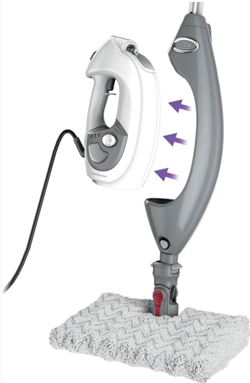
Image: The Shark S3973D Steam Mop Pro Lift-Away, showing its upright steam mop form and the detachable handheld unit.