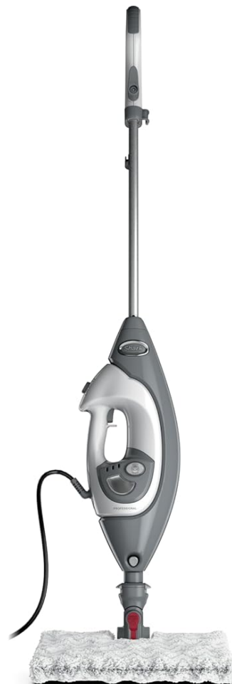
Image: All components included in the Shark S3973D package.