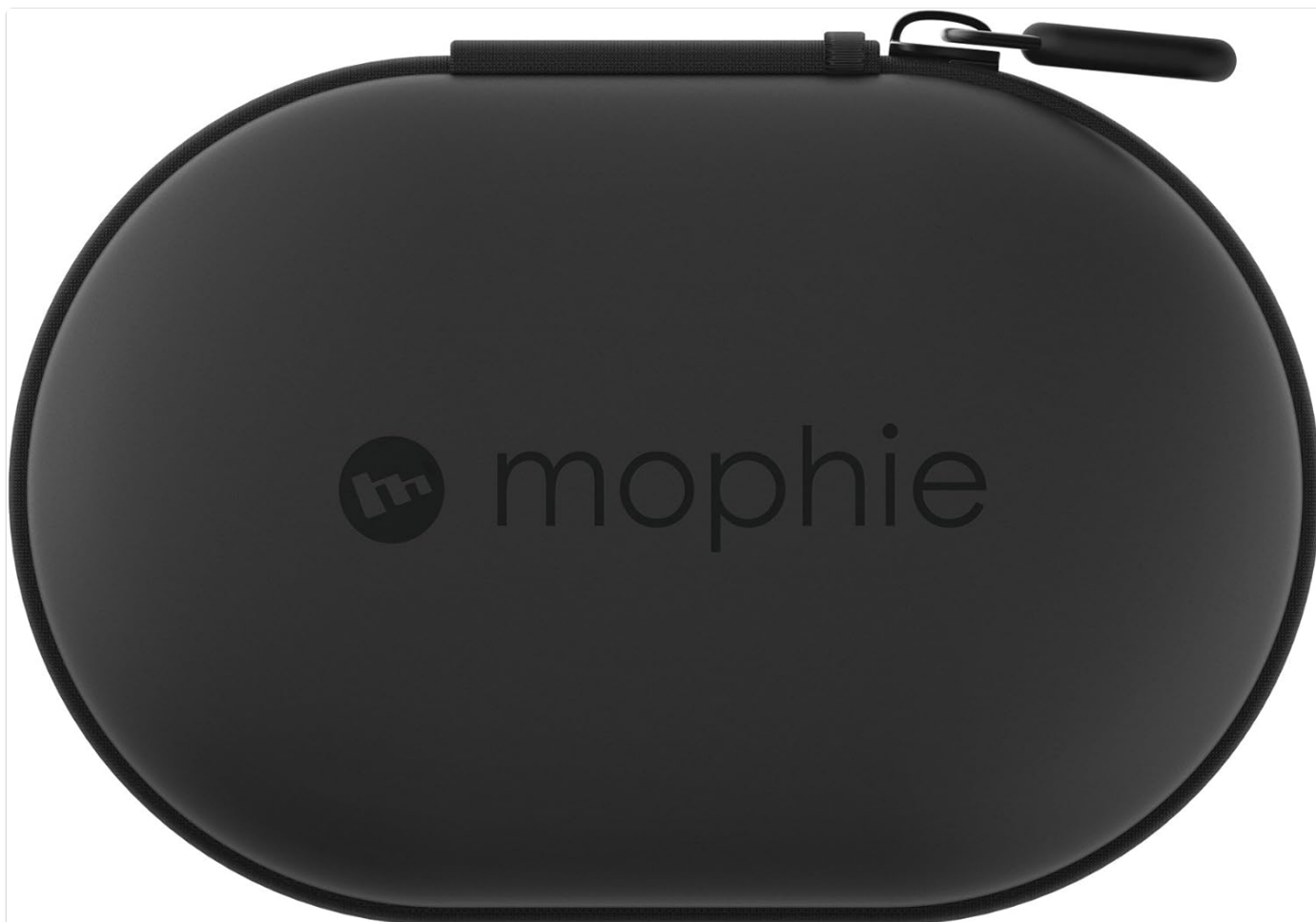
Figure 1: mophie Power Capsule (Closed)

The mophie Power Capsule is a compact and portable travel case designed to charge and protect your wireless earbuds, fitness trackers, or other small wearables. Featuring a built-in 1,400mAh battery, it ensures your devices are always ready for use. Its digital power management system delivers the correct amount of power for a safe and quick charge, while Charge Vault technology maintains the power capsule's battery charge for extended periods.