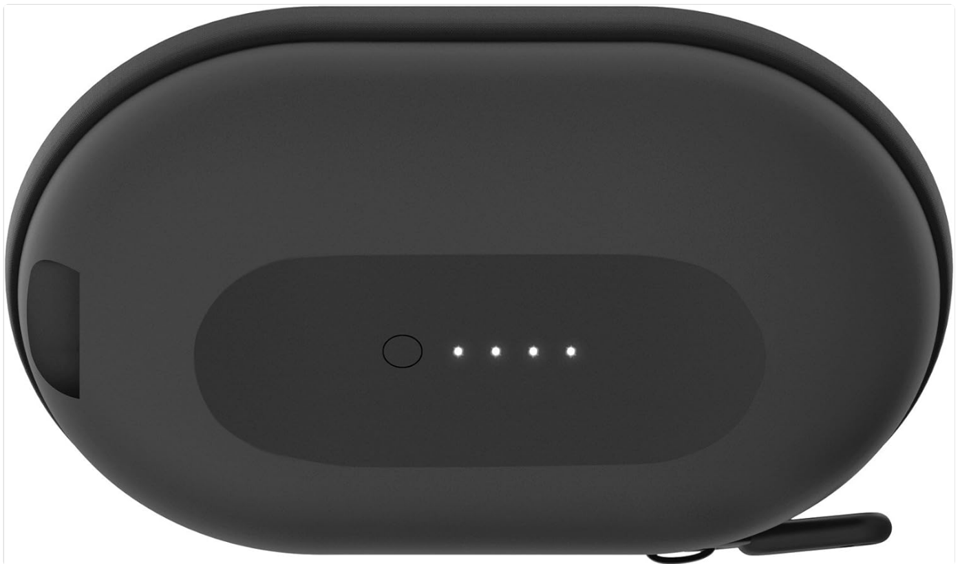
Figure 3: LED Battery Indicator Lights