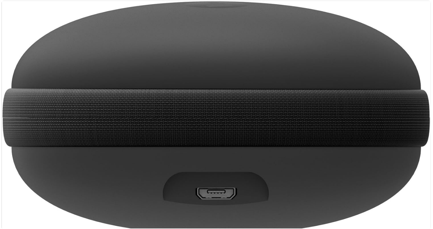
Figure 4: Micro-USB Input Port