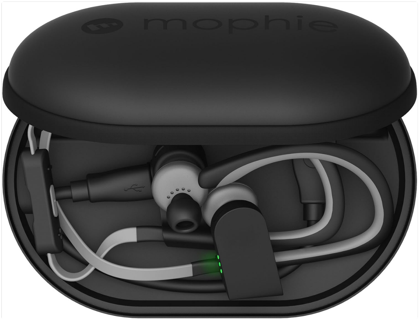
Figure 5: Charging a Device Inside the Power Capsule