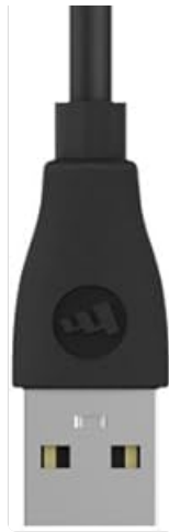
Figure 2: Included Micro-USB Cable