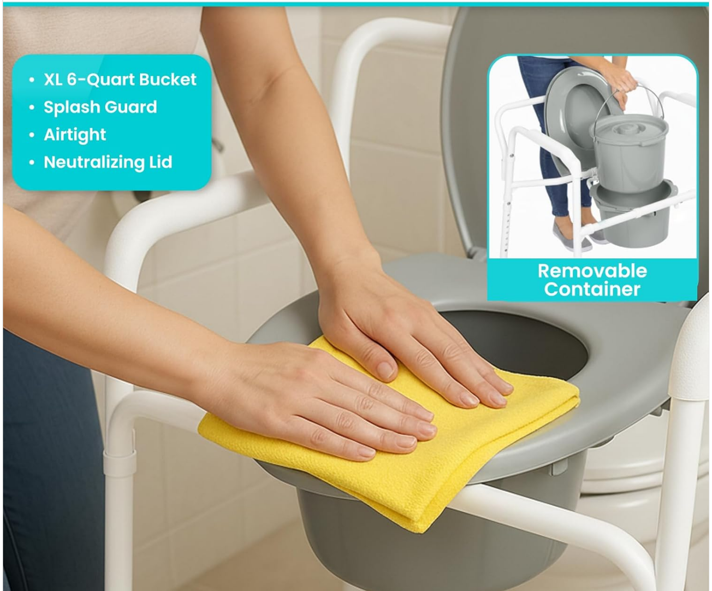
Image: A person demonstrating the easy cleaning of the spill-resistant, removable commode pail.

Spill-resistant, removable pail included