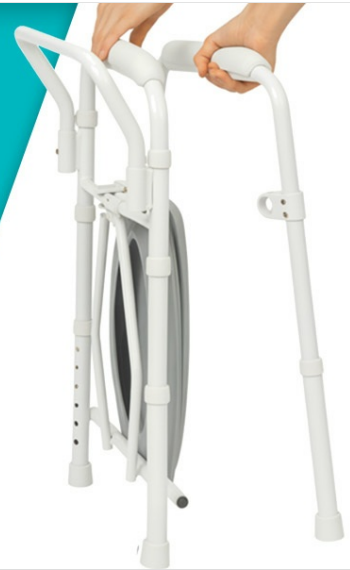
Image: The Vive Commode Chair highlighting its 3-in-1 functionality, tool-free setup, adjustable height, and 350 lb capacity.

Constructed from lightweight stainless steel, the frame supports up to 350 lbs and features non-skid rubber feet for secure placement. Padded armrests offer a firm, comfortable grip when sitting or standing.