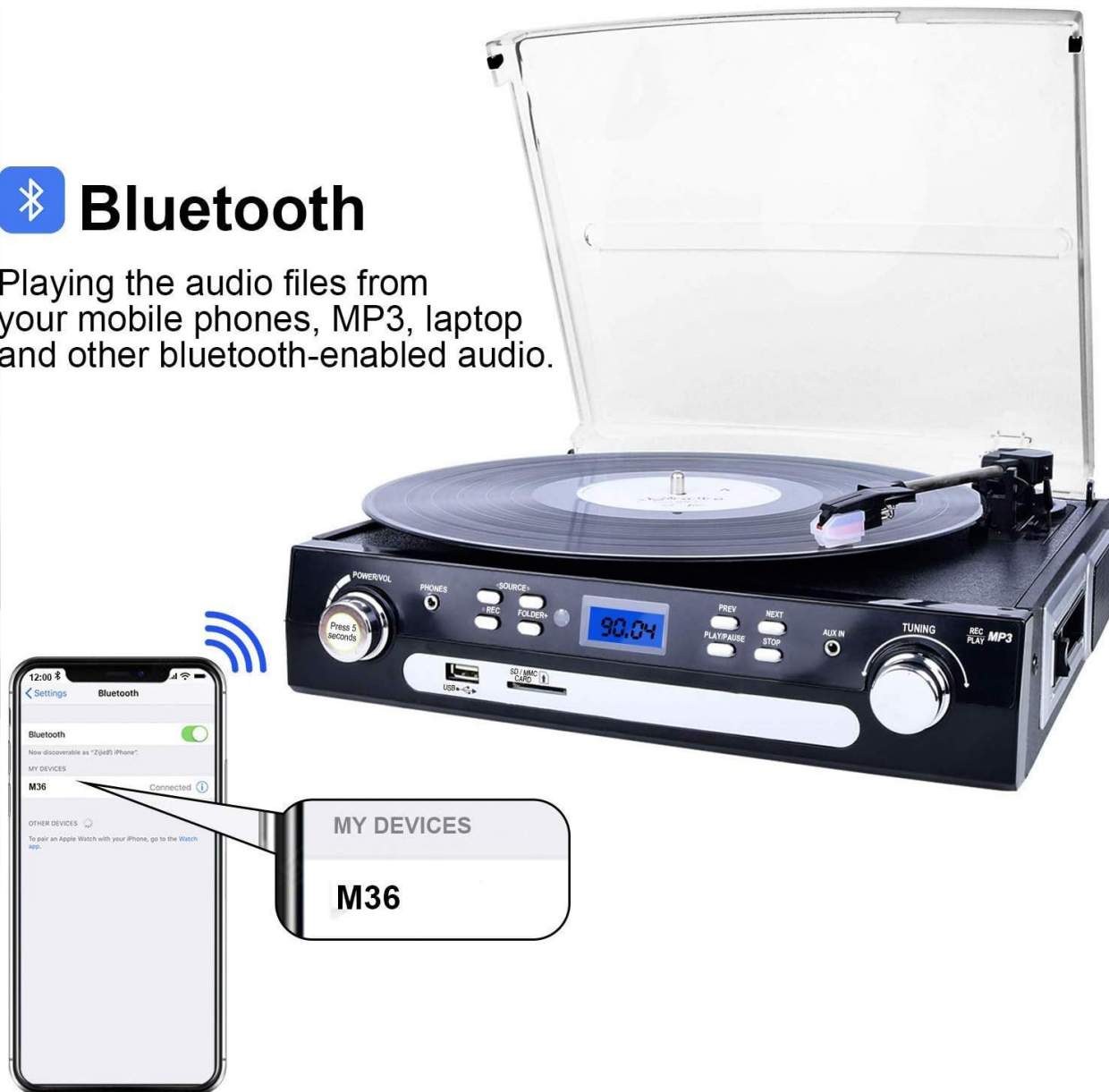
Image: Bluetooth pairing process.

Playing the audio files from your mobile phones, MP3, laptop and other bluetooth-enabled audio.