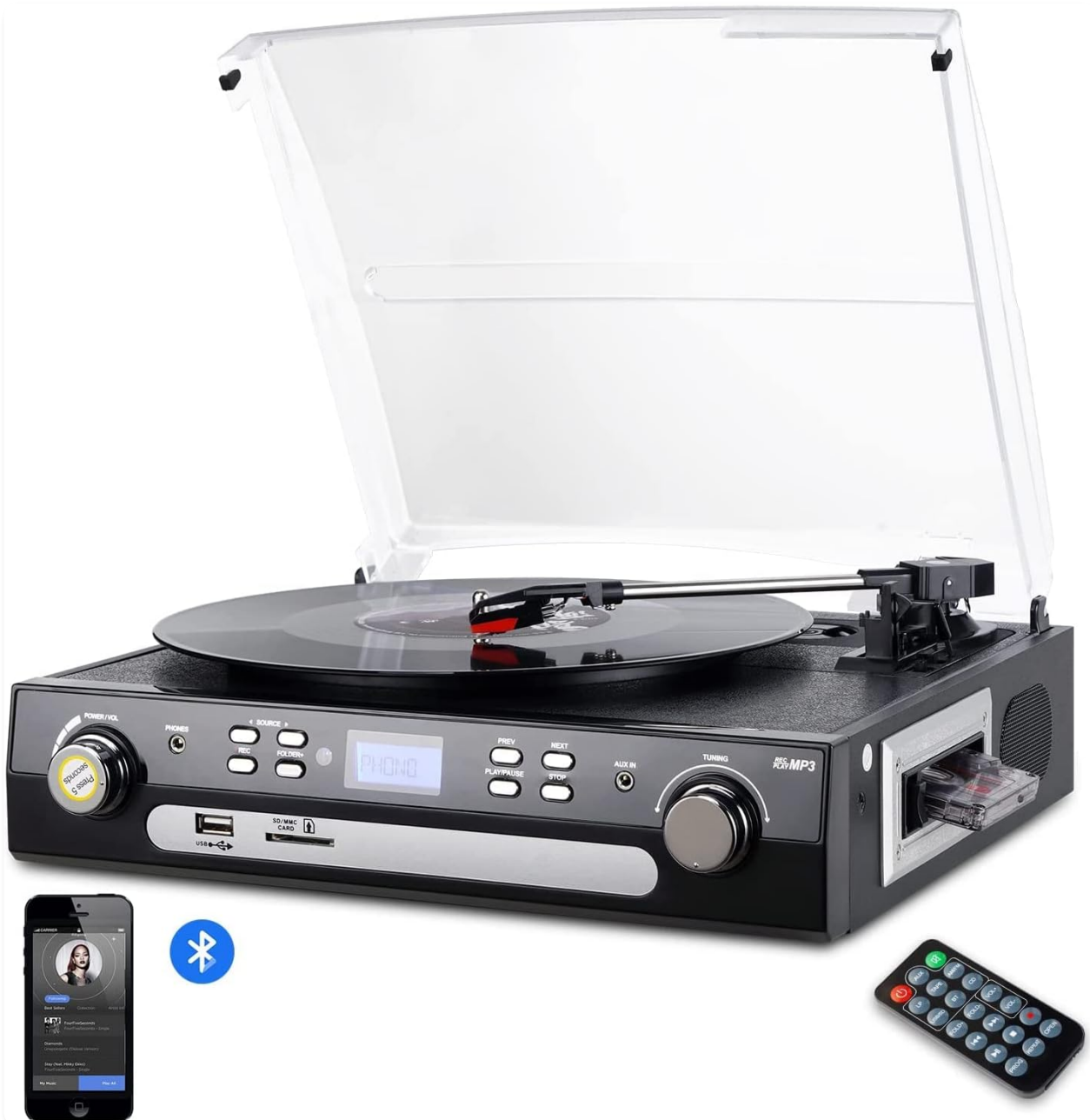
Image: Front view of the DIGITNOW Bluetooth Record Player.