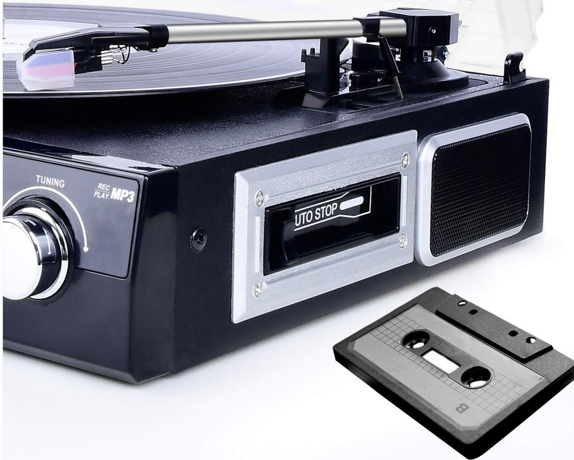
Image: Cassette tape playing feature.

Play your collected tapes with eject and fast forward function. You could enjoy old days with family and friends.