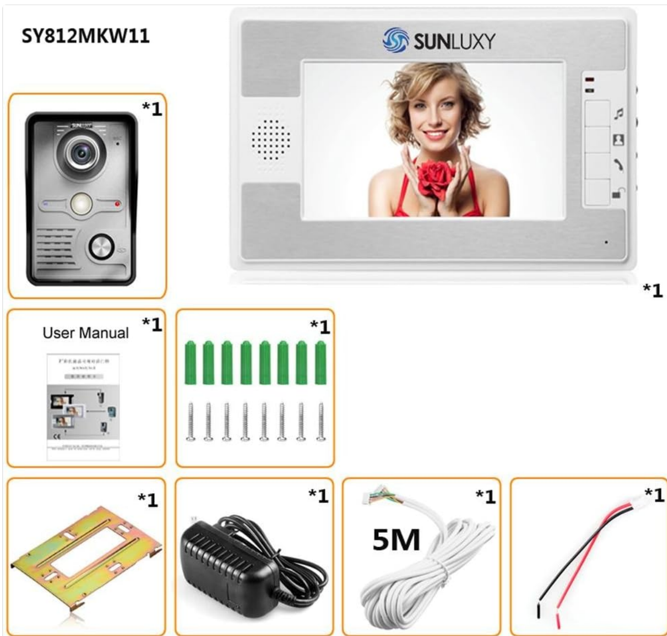
Image 3.1: Included components in the SUNLUXY Video Door Phone System package.