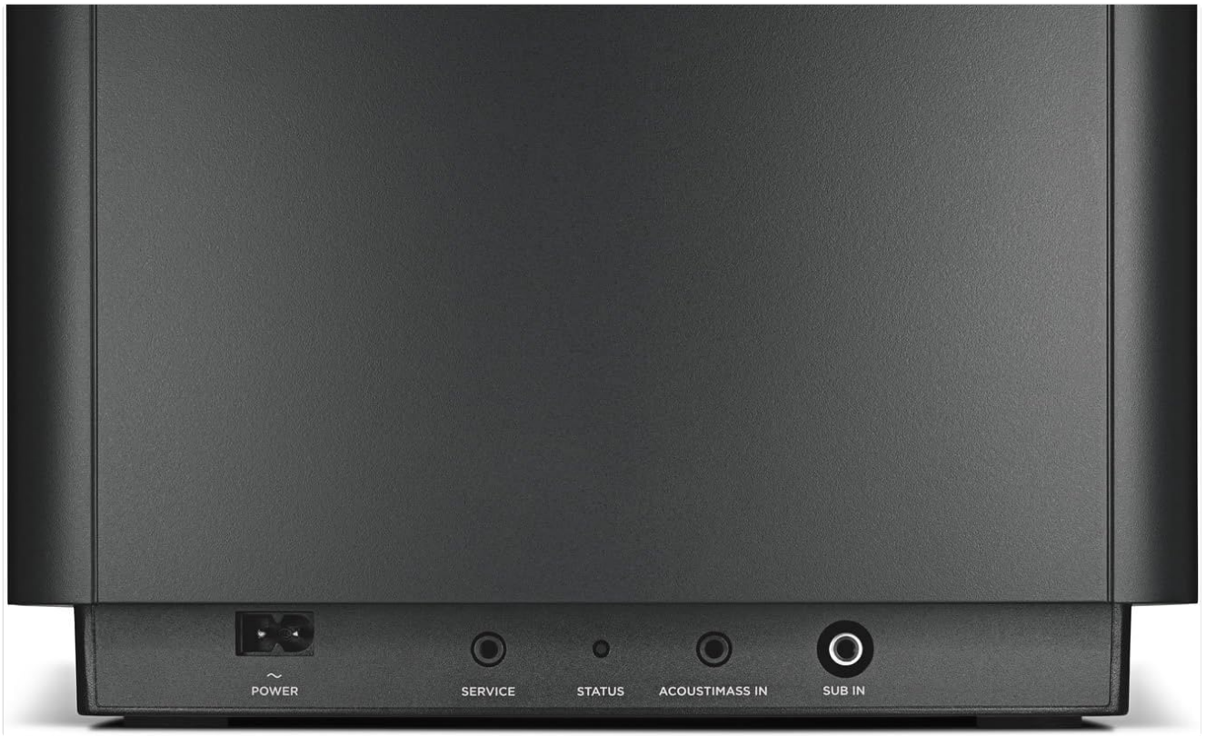
Figure 2: Rear panel connections of the bass module.