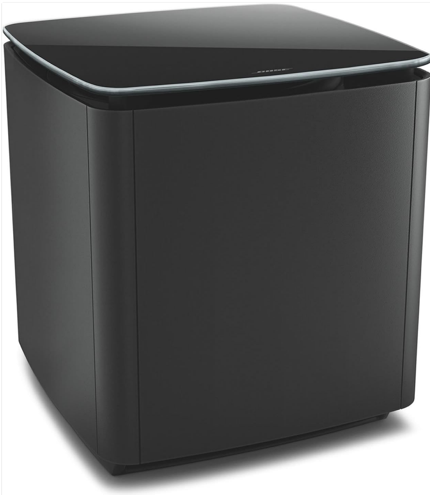
Figure 3: Front view of the Acoustimass 300.