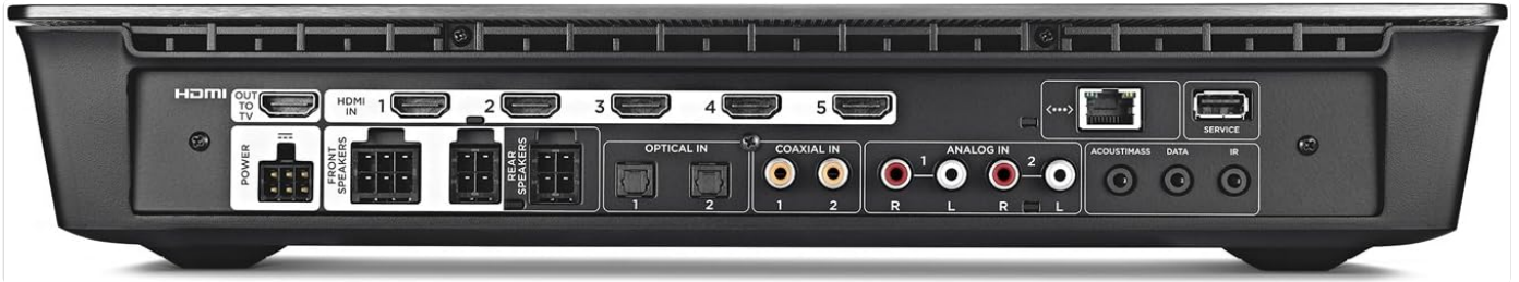
Figure 2: Rear panel of the console with connection ports.

Connect your television and other audio/video sources (e.g., cable box, Blu-ray player) to the console using HDMI cables. The console features 6 HDMI inputs for versatile connectivity.