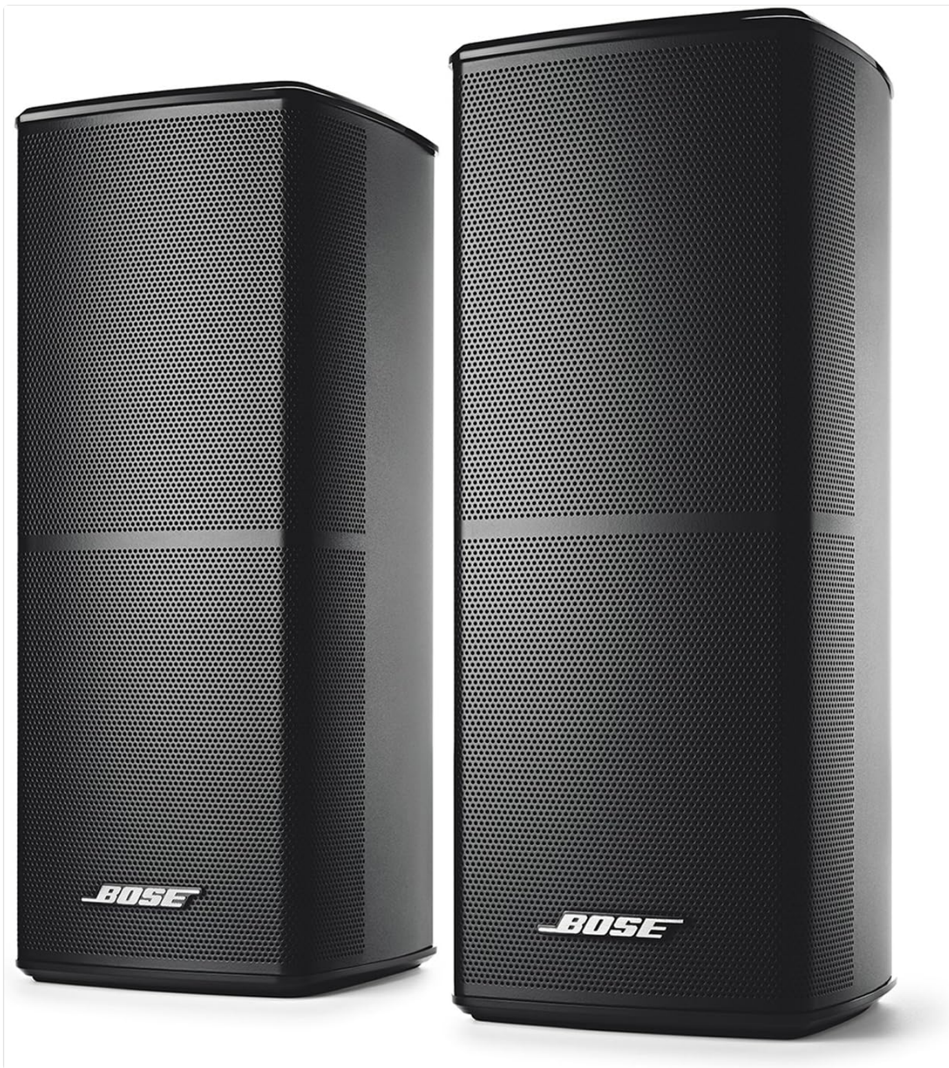
Figure 5: Jewel Cube satellite speakers.