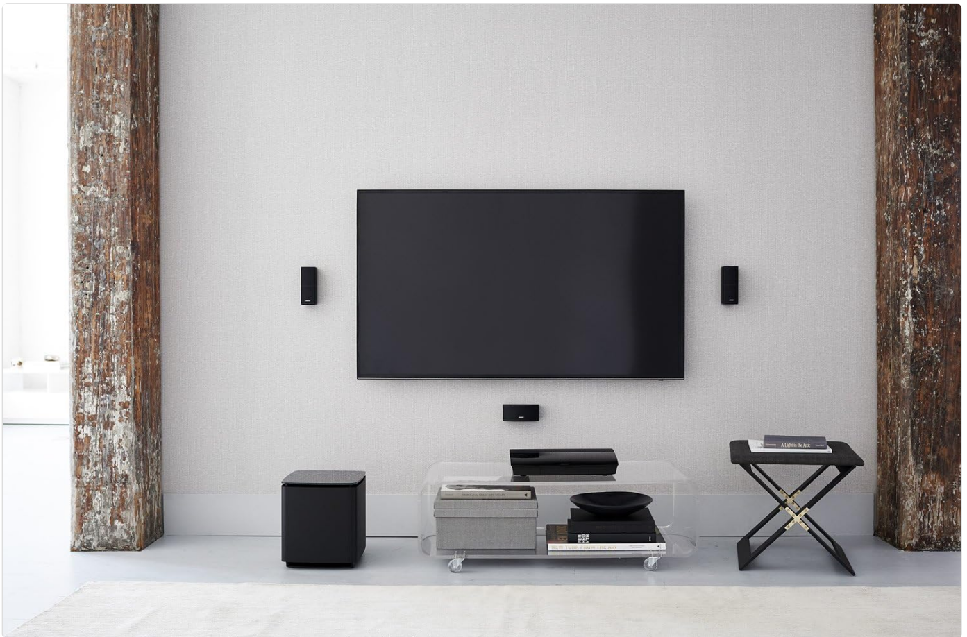
Figure 3: Example of a Bose Lifestyle 600 system setup in a living room.

Position the four Jewel Cube satellite speakers and the center channel speaker in your room for optimal surround sound. The wireless bass module can be placed discreetly within the room.