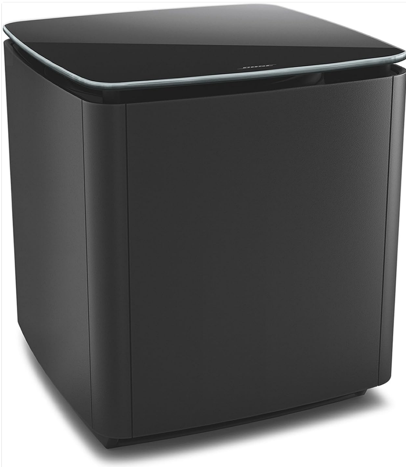
Figure 4: Acoustimass wireless bass module.