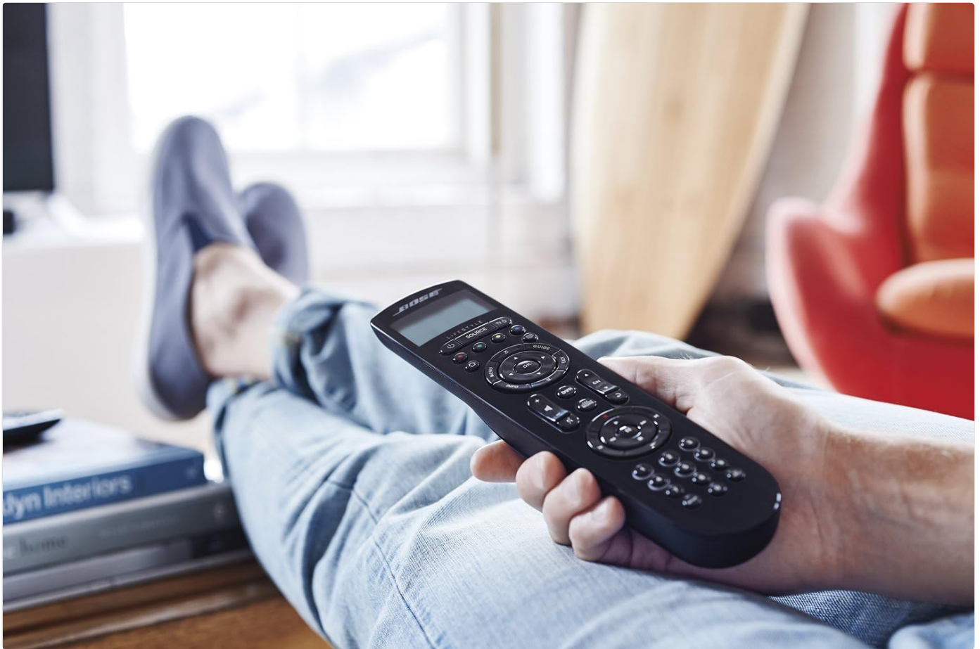
Figure 7: Using the universal remote control.