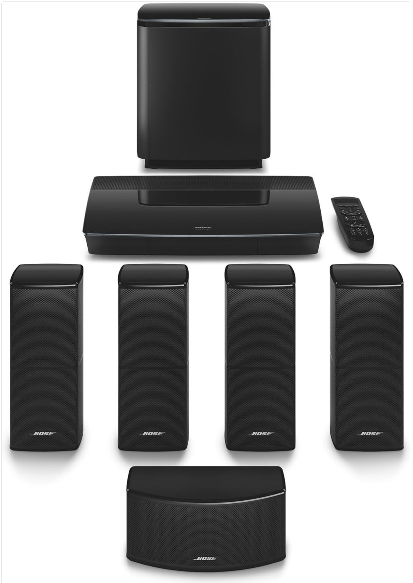
Figure 1: All components included with the Bose Lifestyle 600 system.