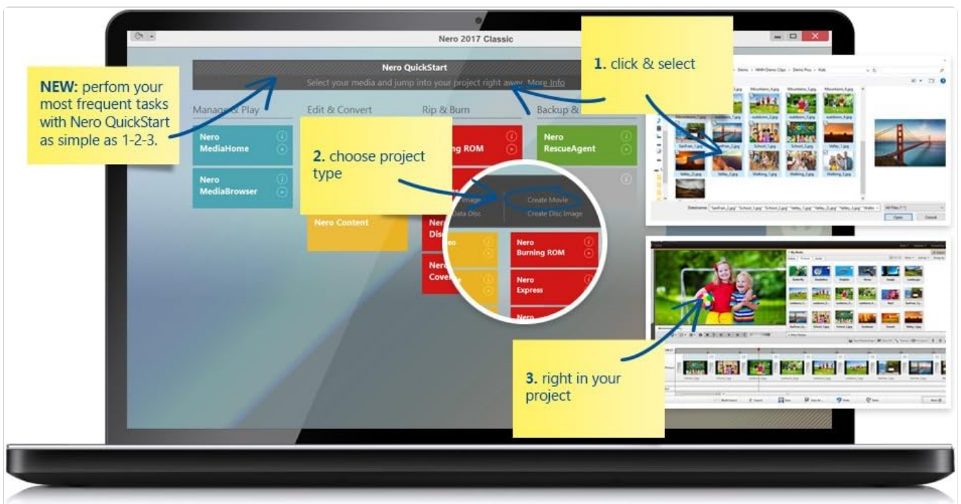
Figure 3: Nero QuickStart Workflow. This image illustrates the three-step process of using Nero QuickStart: 1. Click & select, 2. Choose project type, and 3. Right in your project, demonstrating how to quickly start tasks.