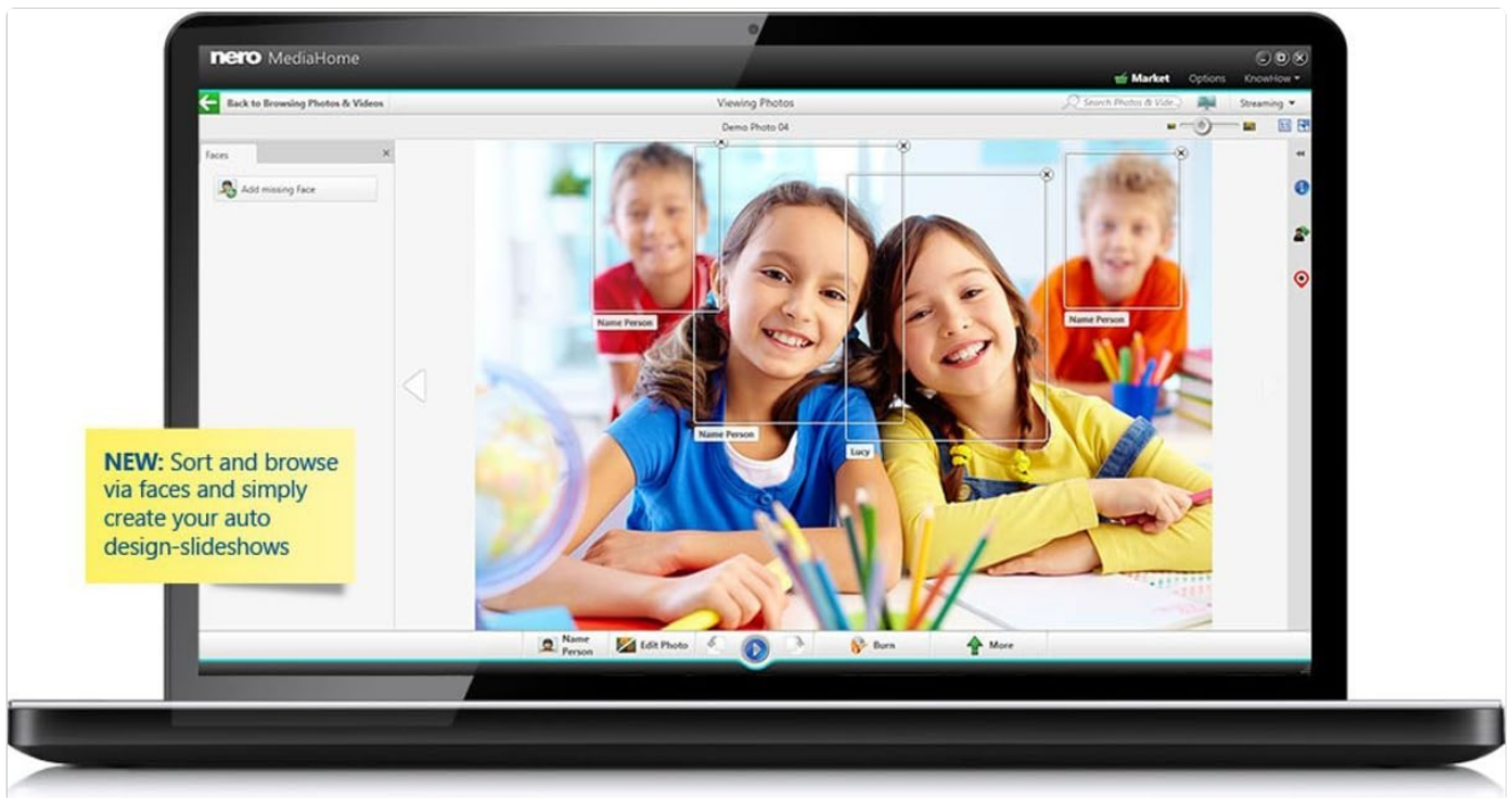
Figure 4: Nero MediaHome Face Recognition. This image shows the Nero MediaHome interface on a laptop, demonstrating the feature to sort and browse photos via faces, allowing for easy creation of auto-designed slideshows.