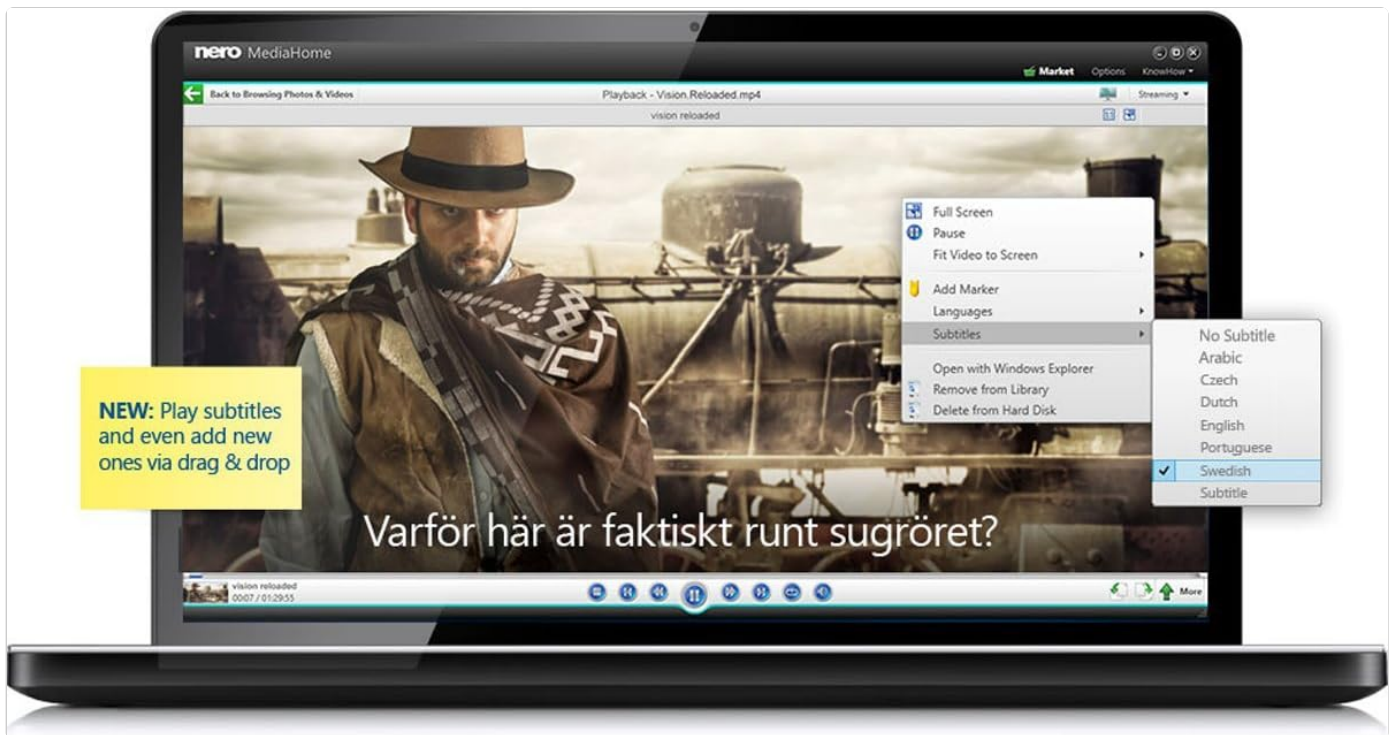
Figure 6: Nero MediaHome Subtitle Options. This image shows the Nero MediaHome interface on a laptop during video playback, highlighting the option to select and add subtitles via drag-and-drop, with various language choices available.