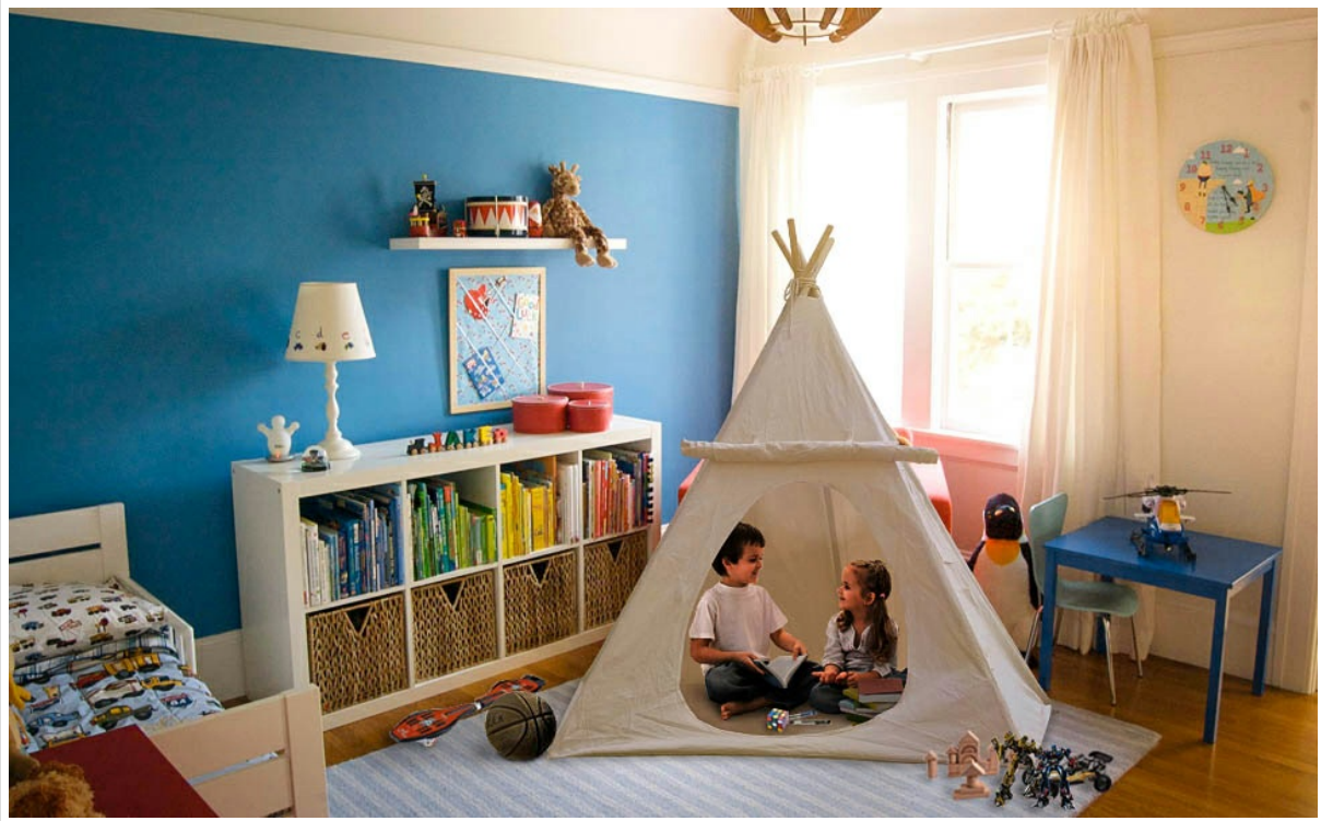
Image 3.2: The teepee provides a comfortable space for children to read and play indoors.