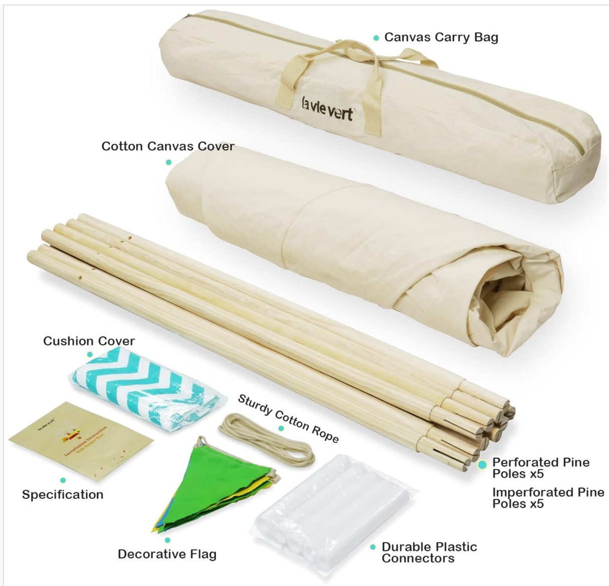
Image 1.2: All components included with the Lavievert Teepee Play House, neatly arranged for inspection.