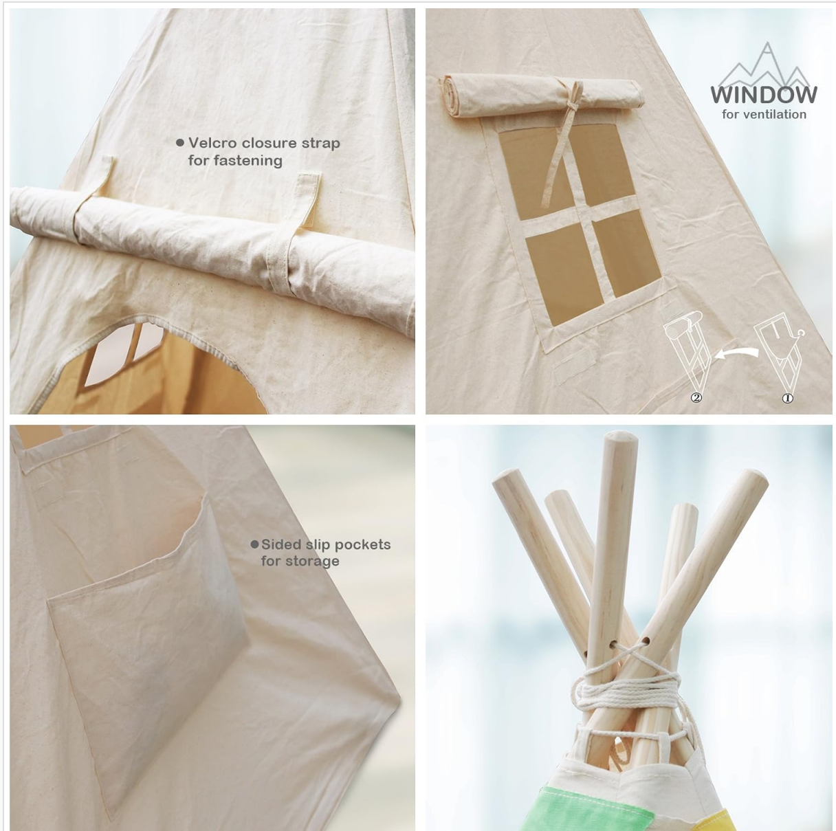
Image 3.1: Detailed view of the teepee's features, including the window, storage pockets, and pole assembly.