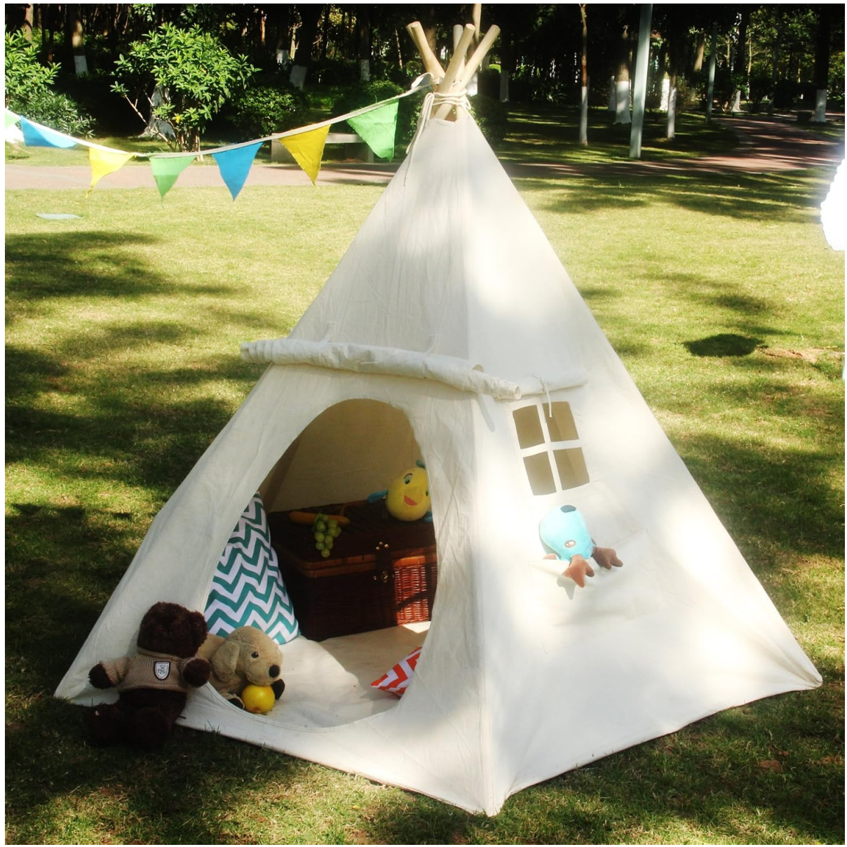
Image 1.1: The Lavievert Teepee Play House, showcasing its outdoor setup with decorative flags and toys inside.