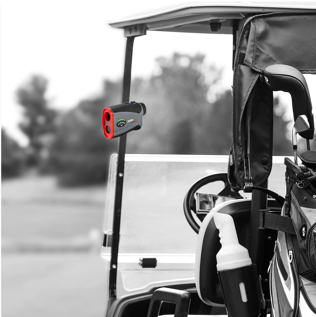
Image: The rangefinder utilizing MagnaHold to attach to a golf cart.

The integrated MagnaHold feature allows the rangefinder to securely attach to metal surfaces, such as a golf cart frame or club, for quick access and convenient storage during your round.