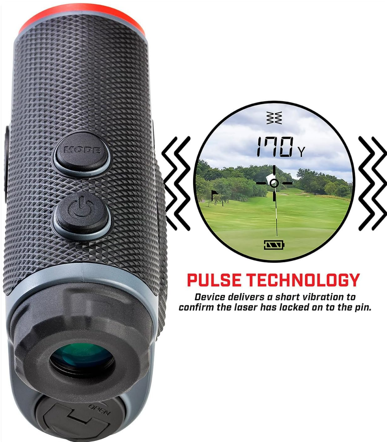
Image: Display showing Pin-Locking Technology with Pulse Confirmation.