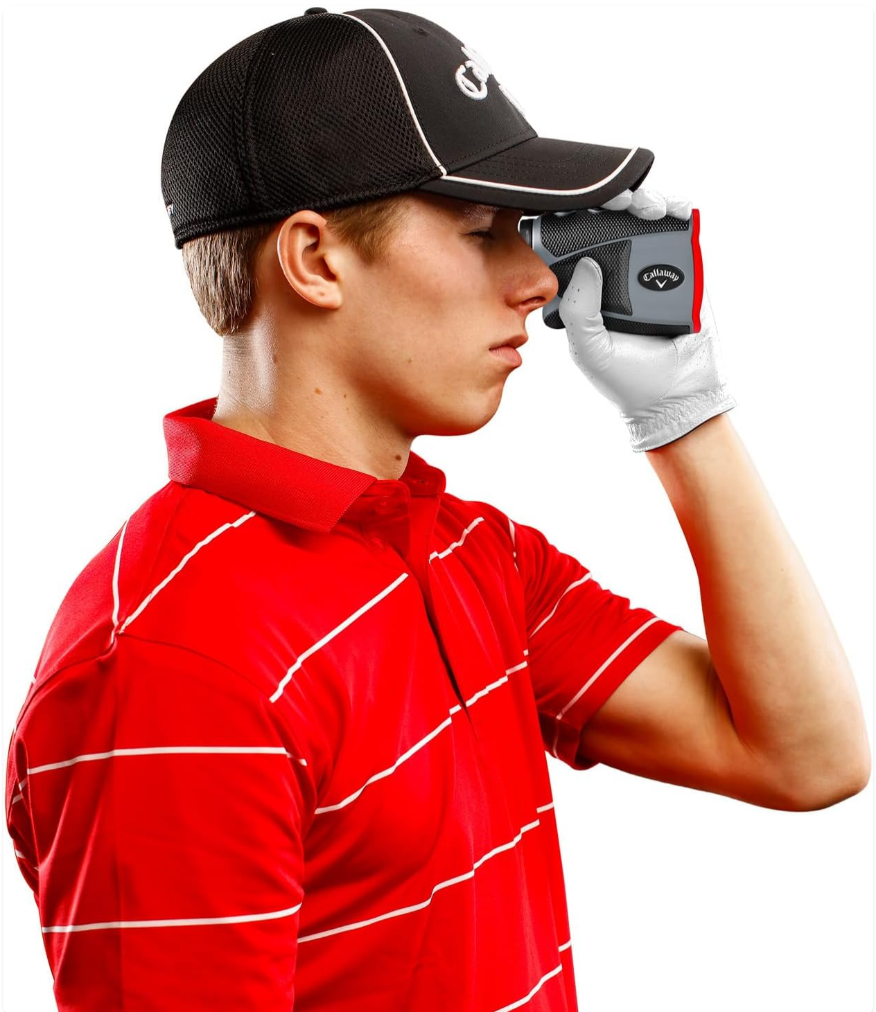
Image: Rangefinder display illustrating slope-adjusted distance calculation.