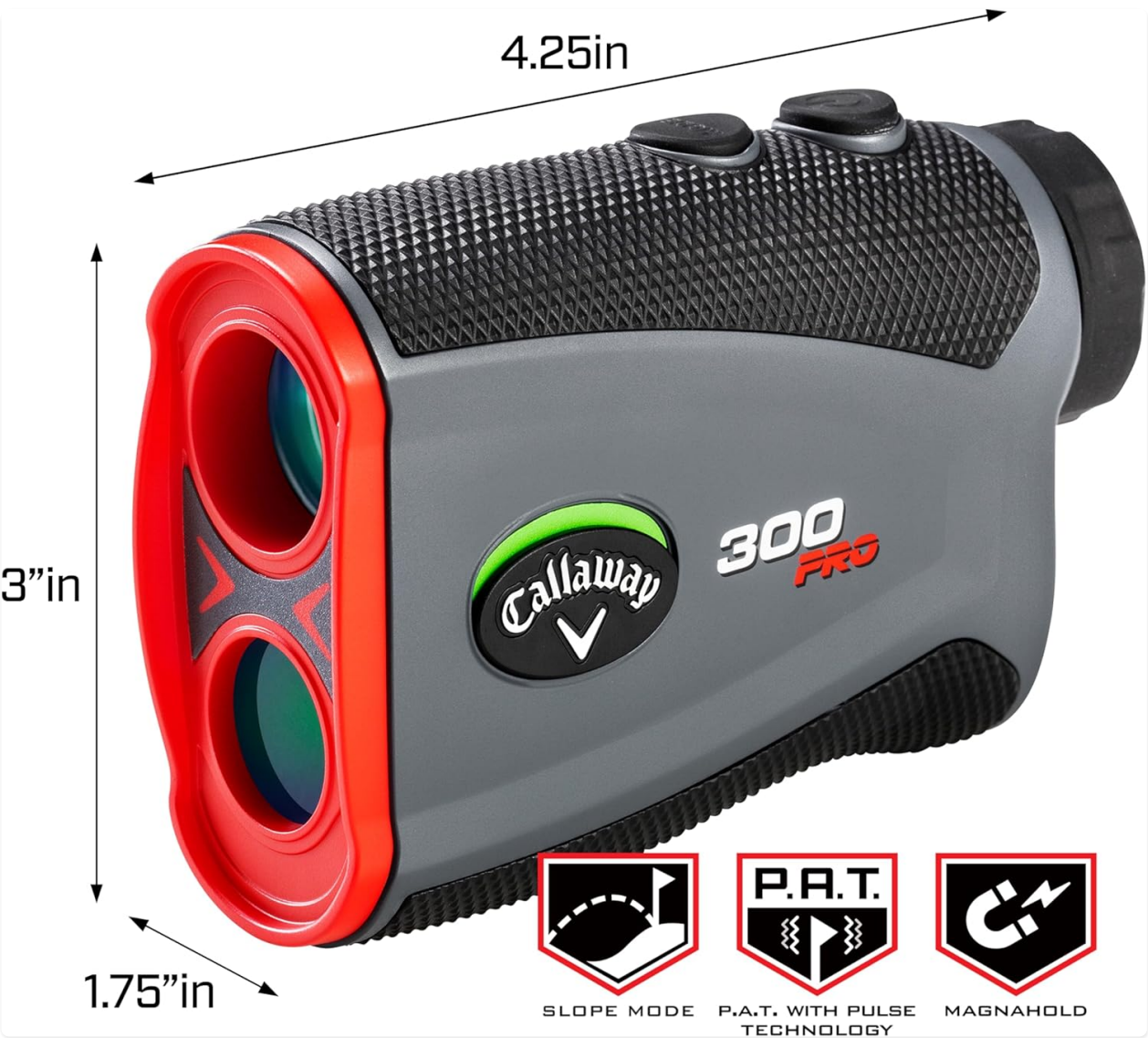
Image: Callaway 300 Pro Rangefinder with key dimensions.