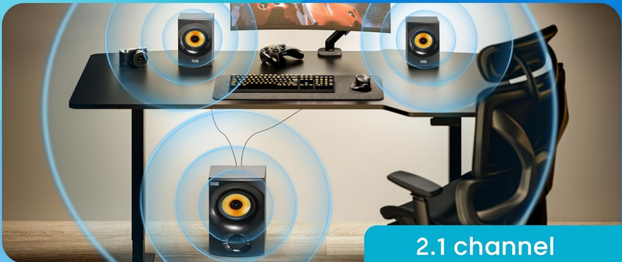
Image: Recommended speaker placement for an immersive 2.1 channel sound experience.