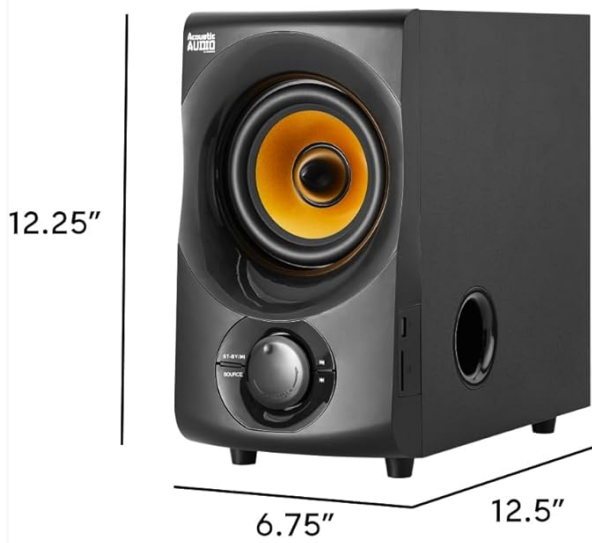
1 - Subwoofer