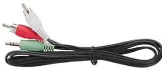
1 - 3.5mm AUX to RCA Cable