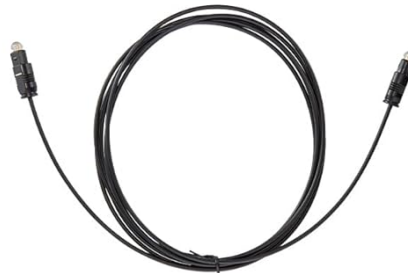
1 - Optical Cable