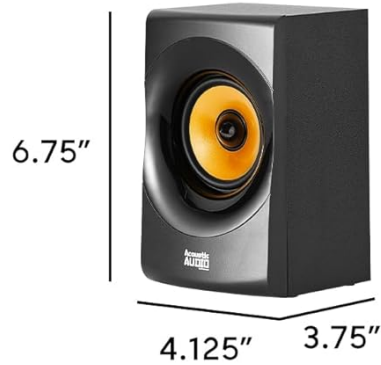
2 - Wired Satellite Speakers