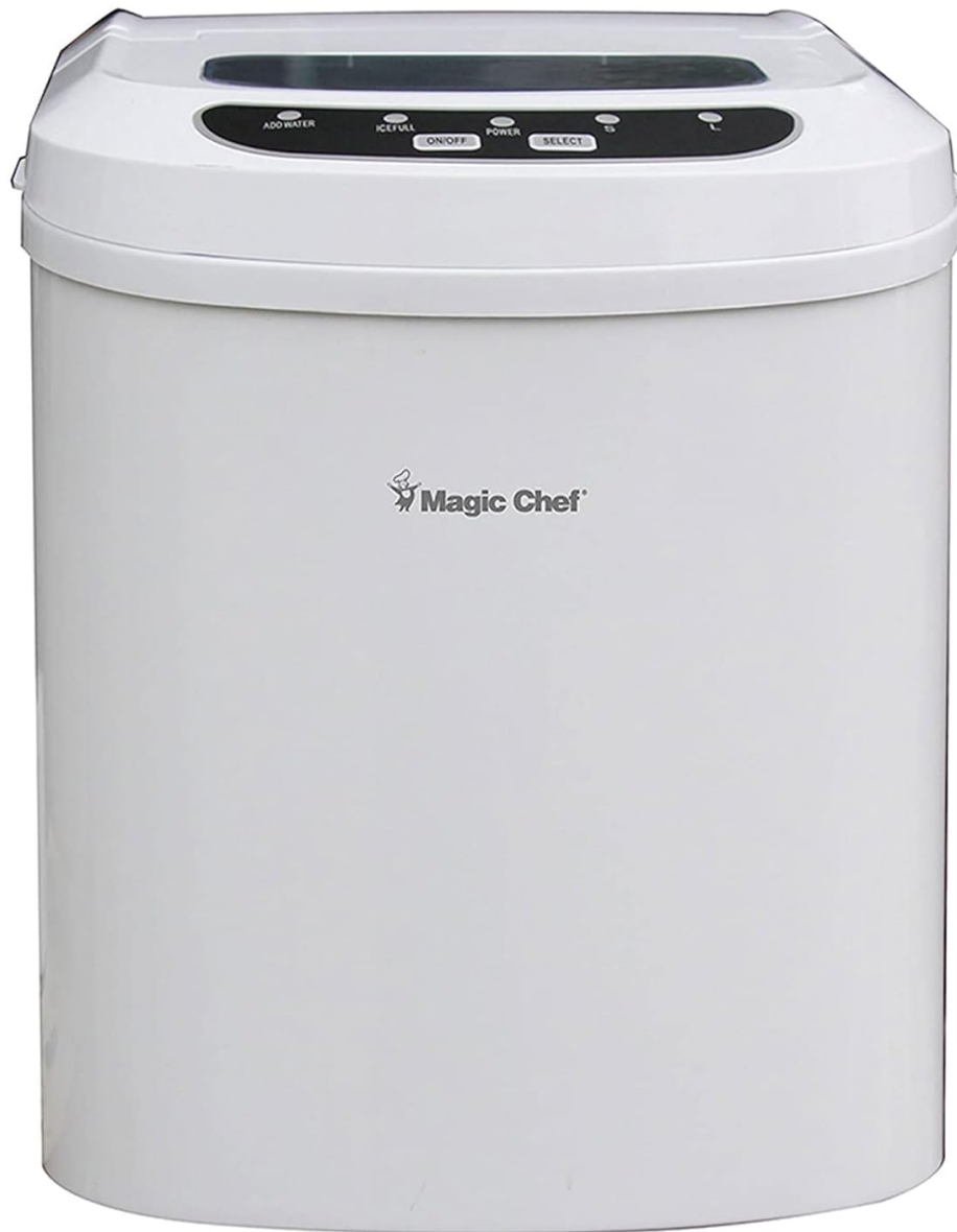
Figure 1: Front view of the Magic Chef Portable Countertop Ice Maker.