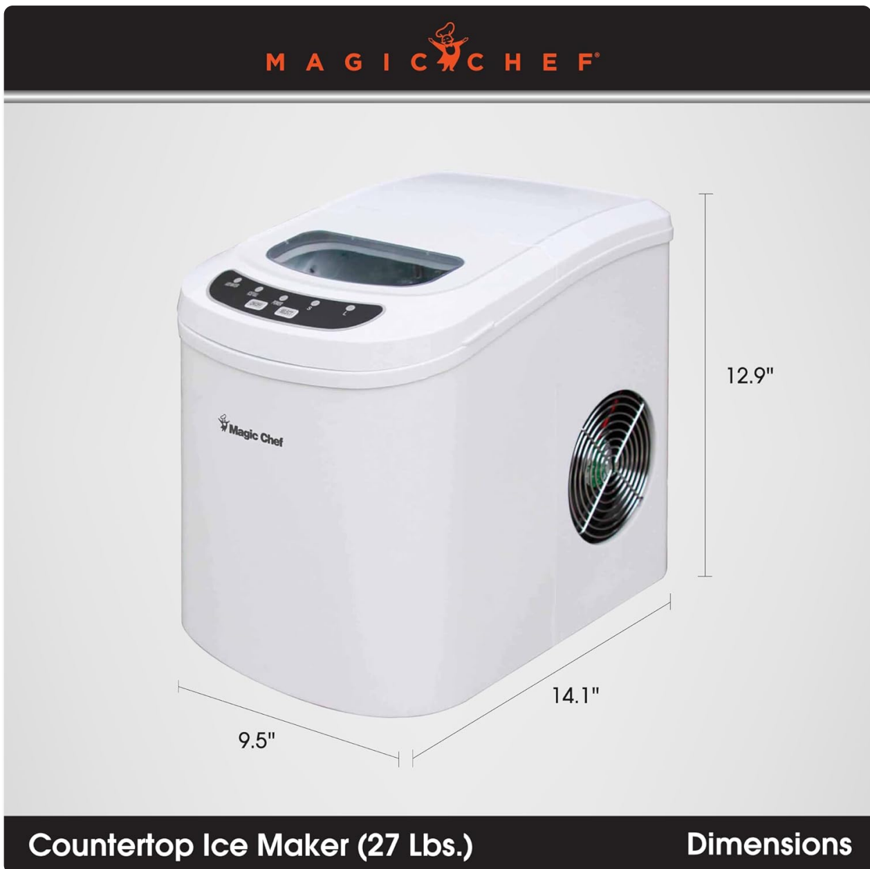
Figure 2: Dimensions of the Magic Chef Portable Countertop Ice Maker.