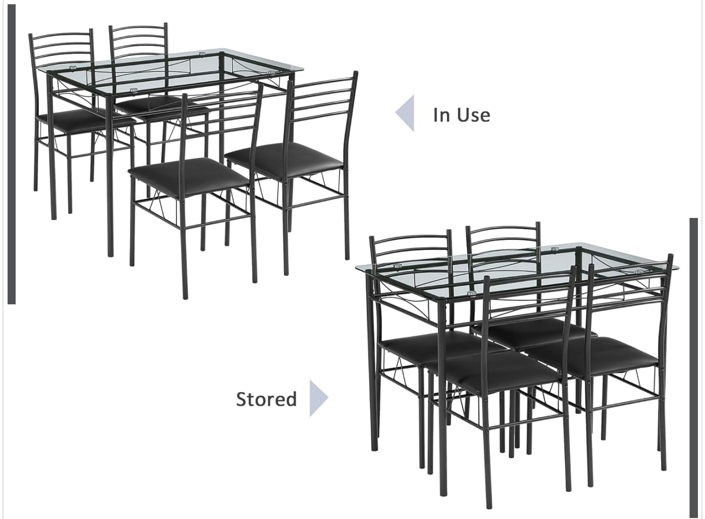
Image: Illustration of the VECELO dining set's space-saving design. The chairs can be neatly tucked under the table when not in use, ideal for smaller living spaces.

Store the chairs underneath the table when not in use, ideal for space-limited rooms.