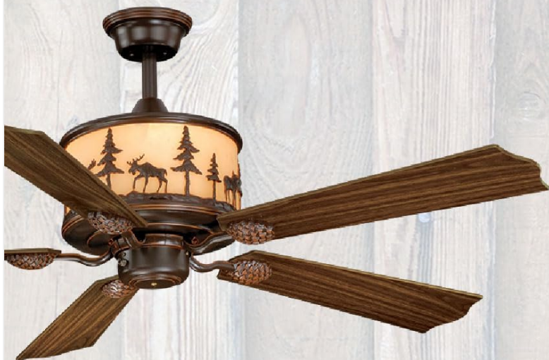
SHOWN WITH DARK WALNUT FAN BLADES