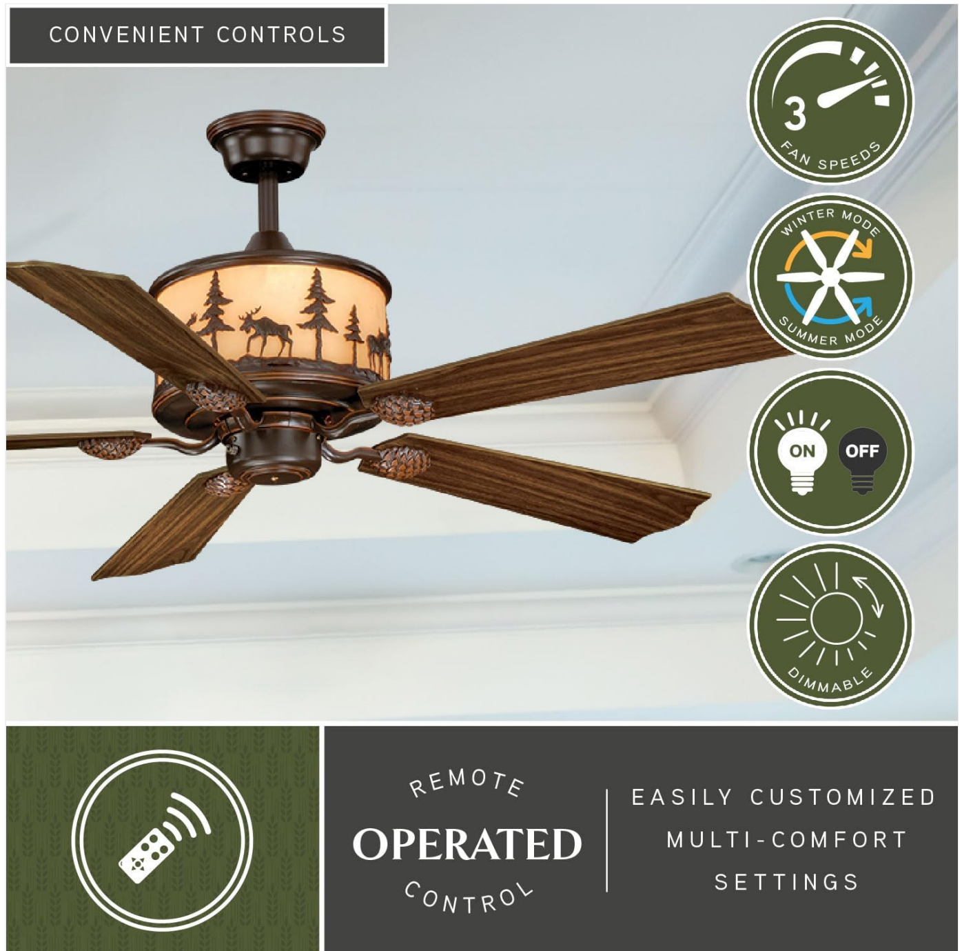
Image: A visual representation of the fan's convenient controls, including the remote control and icons indicating 3 fan speeds, seasonal reverse mode, light on/off, and dimmable functionality.