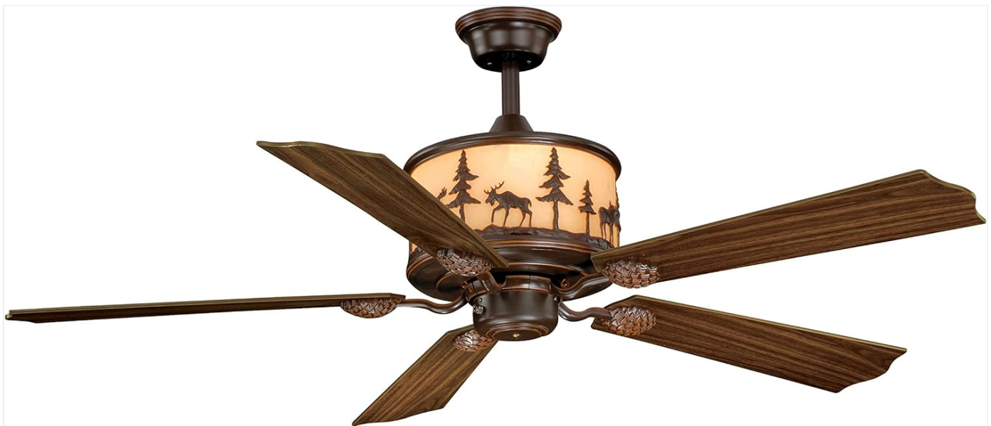
Image: The VAXCEL Yellowstone 56-inch ceiling fan, featuring a burnished bronze finish, a wildlife-themed motor housing with moose and trees, and five reversible rosewood-dark walnut blades.

This manual provides detailed instructions for the installation, operation, and maintenance of your VAXCEL Yellowstone 56-inch Burnished Bronze Indoor Ceiling Fan. Please read all instructions carefully before beginning installation to ensure safe and proper use of the product. Keep this manual for future reference.