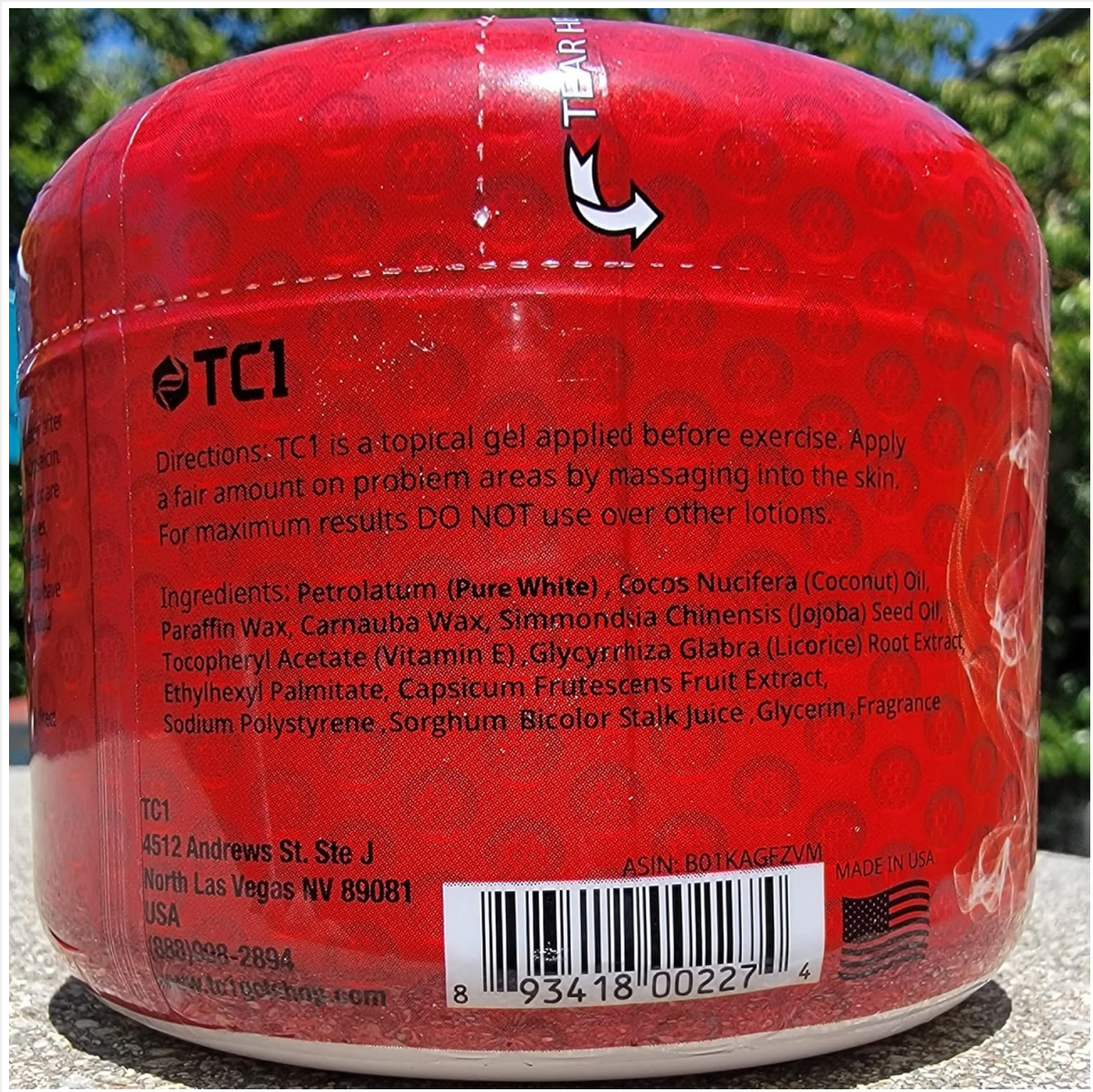
Figure 2: Back of the TC1 Sweat Ignition Workout Gel jar, showing directions and ingredients.

Your browser does not support the video tag.