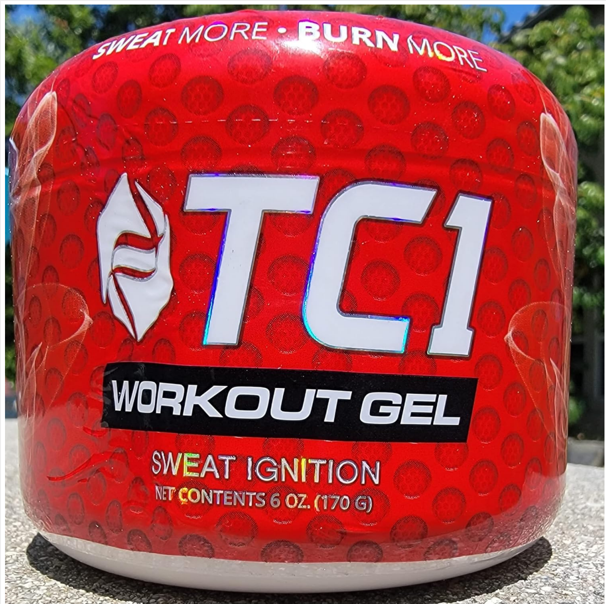
Figure 1: Front view of the TC1 Sweat Ignition Workout Gel jar.