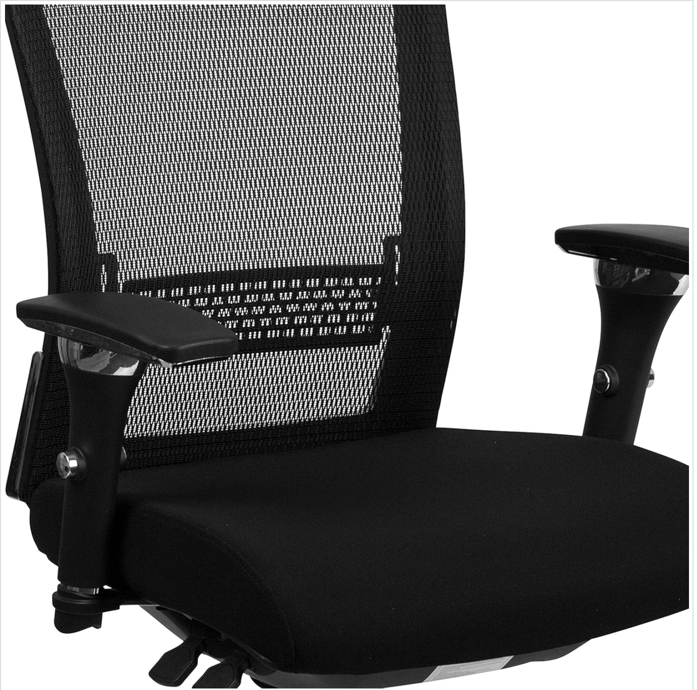
Figure 3: View of the adjustment levers located beneath the seat.