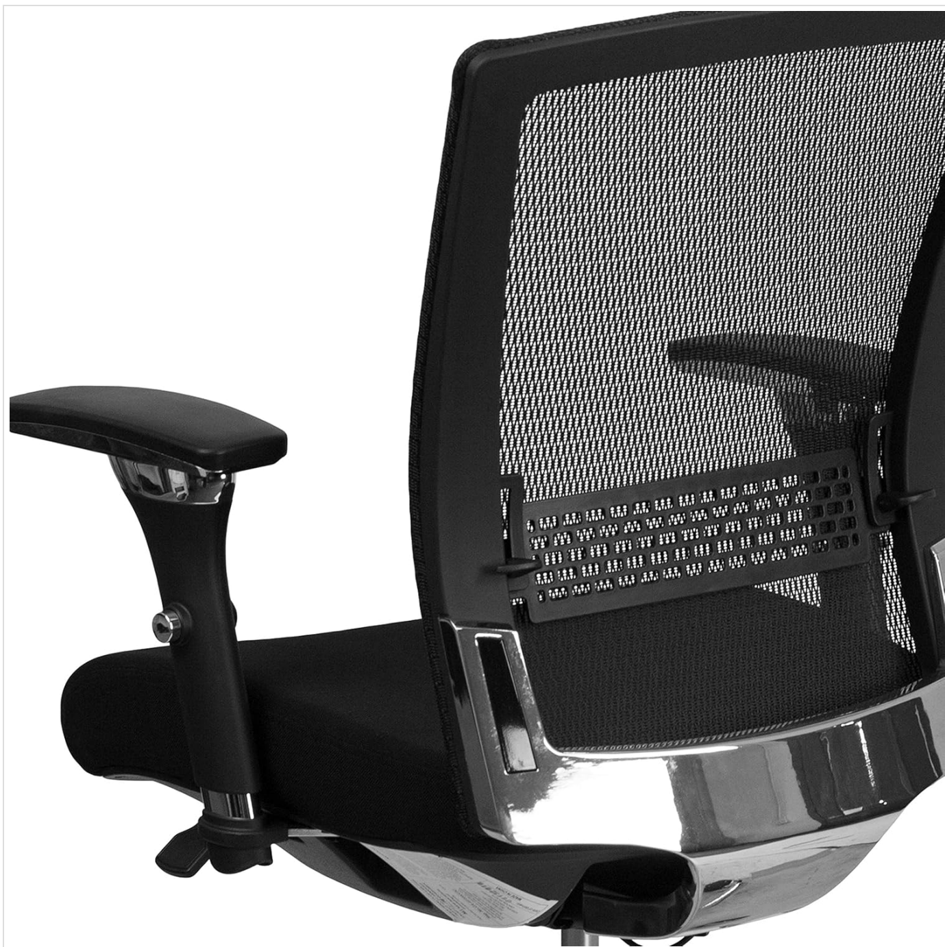
Figure 6: Detailed view of the adjustable lumbar support mechanism on the mesh backrest.