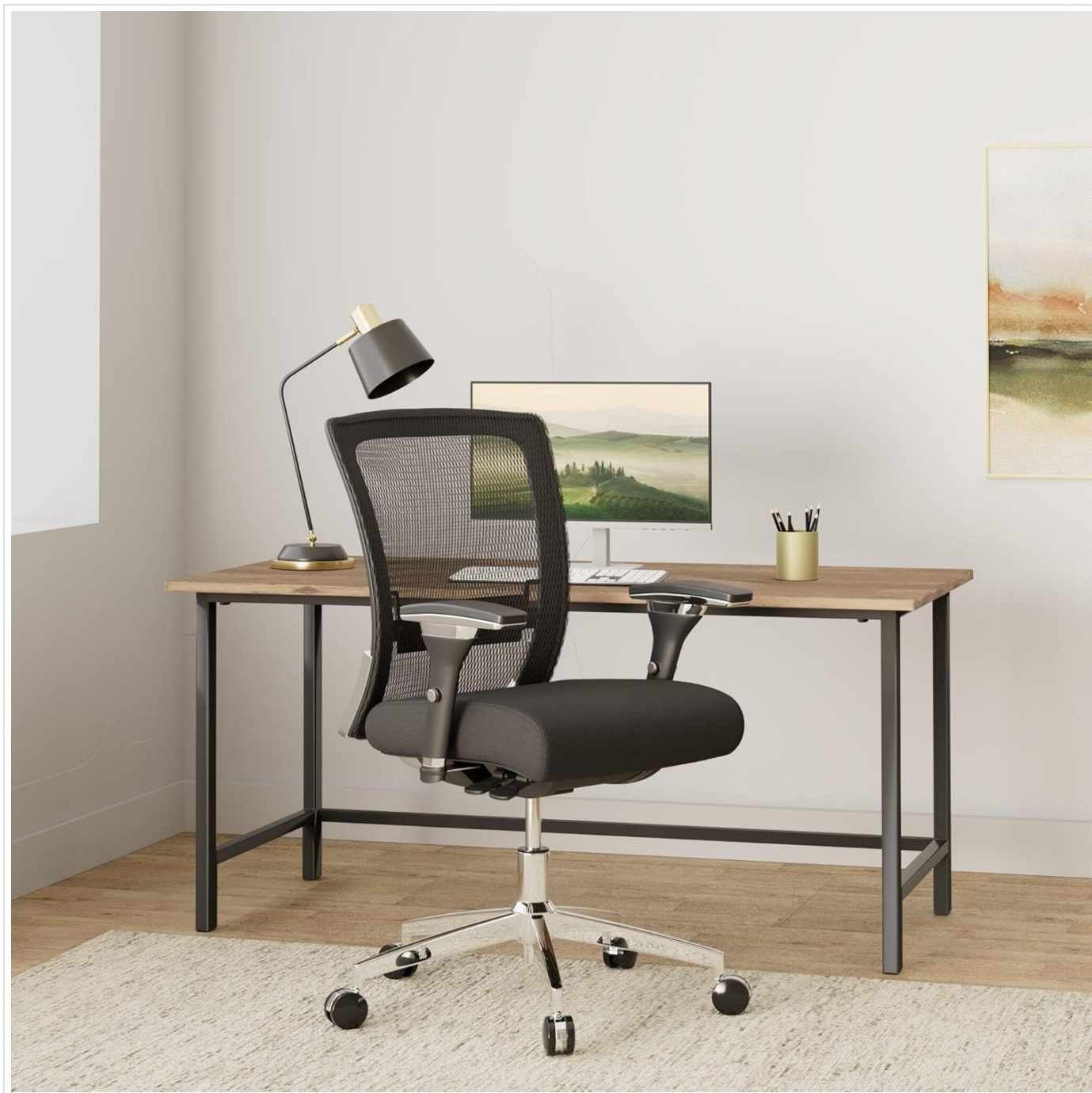
Figure 2: The HERCULES Series Office Chair ready for use in a home office environment.