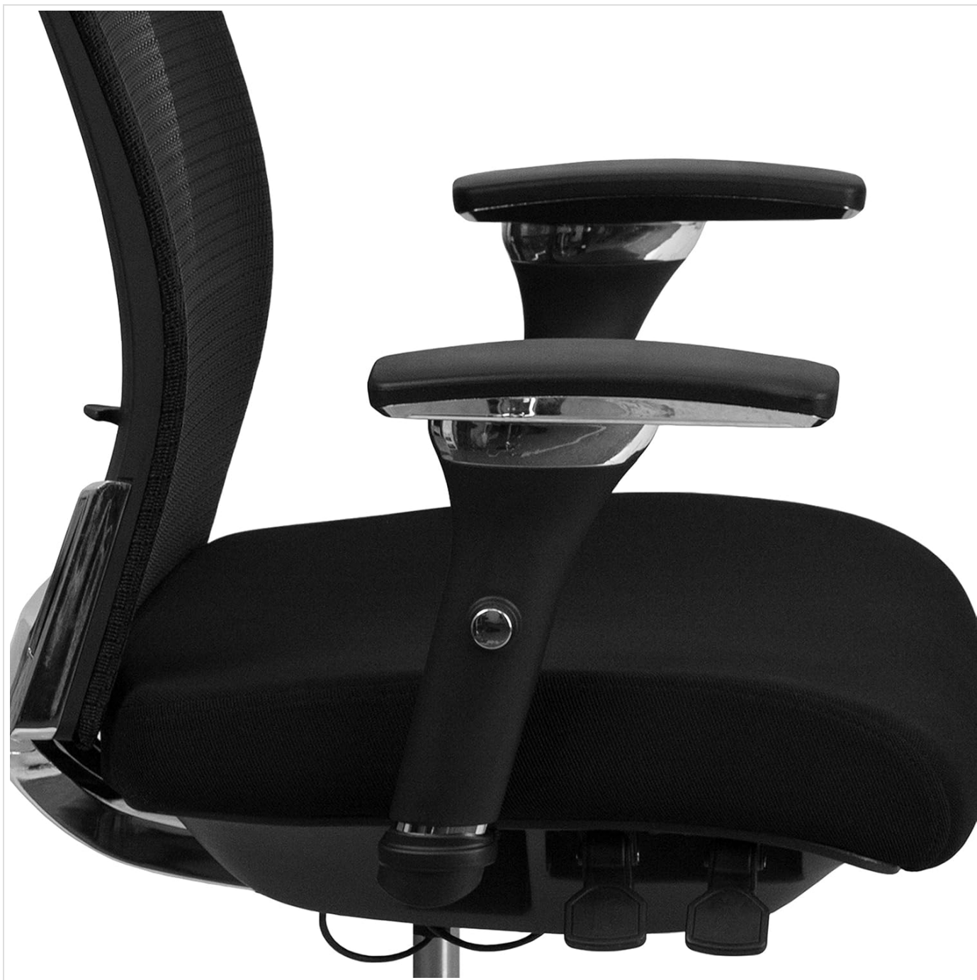
Figure 5: Detail of the adjustable armrest, highlighting the height adjustment button and pivot function.

The armrests are height adjustable. Press the button on the side of the armrest support and slide the armrest up or down to your desired height. The arm pads also pivot inward and outward for greater customization, providing optimal support for your arms and shoulders.