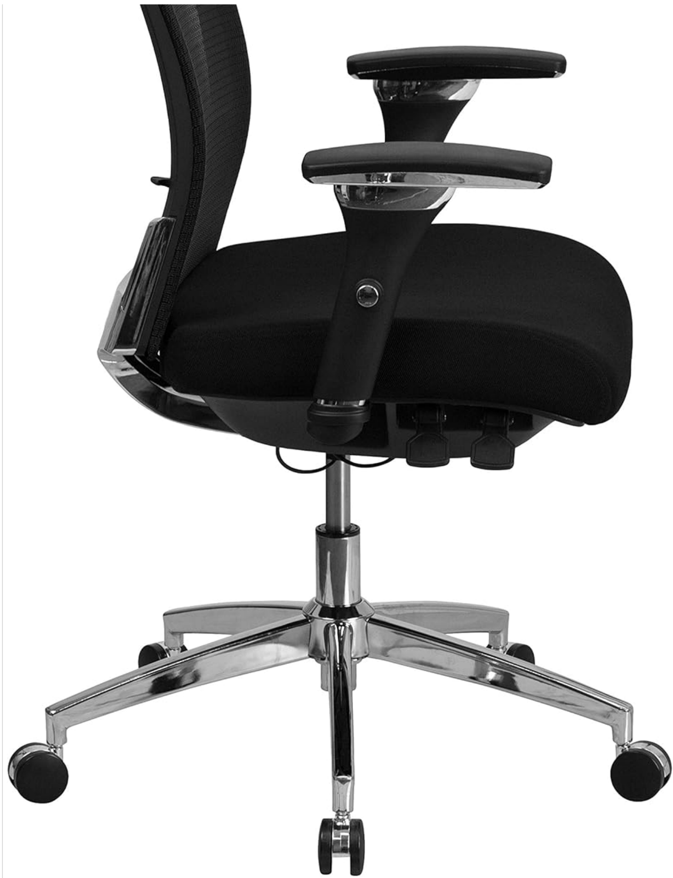
Figure 4: Side profile showing the chair in a reclined position, illustrating the synchro tilt function.