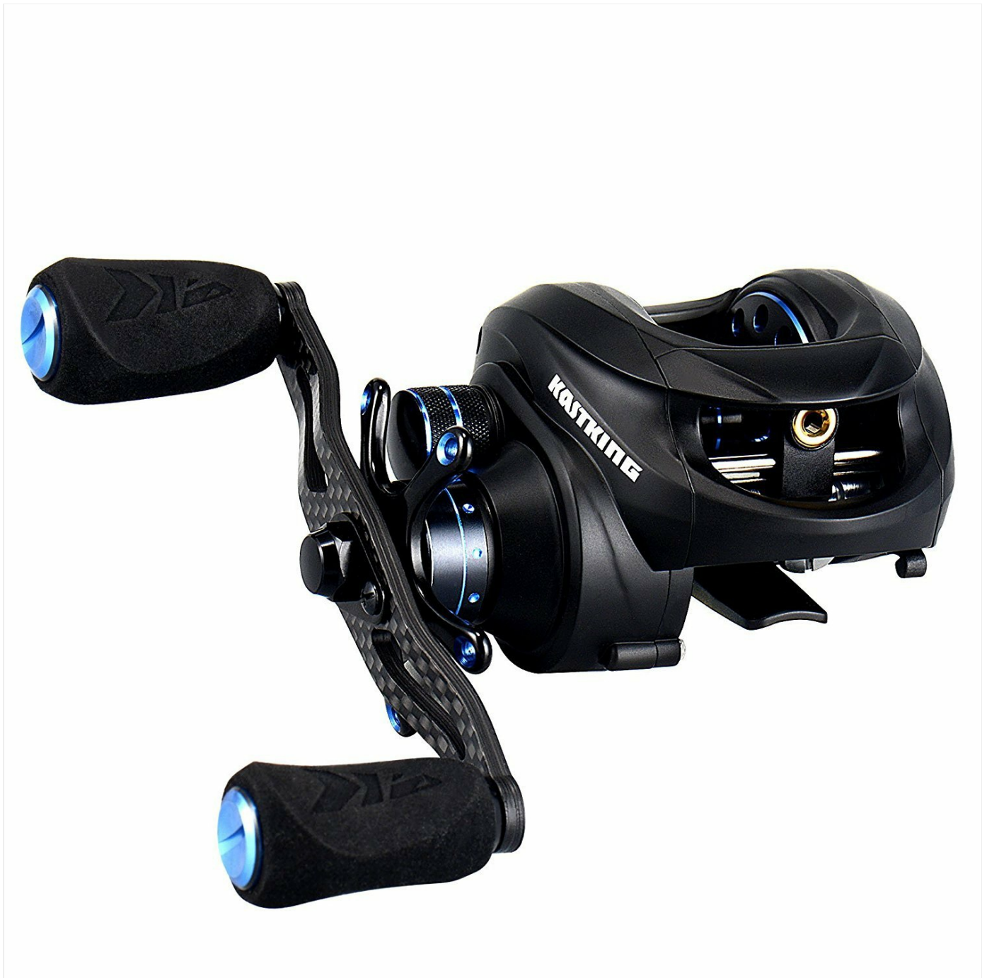
Image: The KastKing Assassin Carbon Baitcasting Reel, showcasing its sleek design and compact form factor.