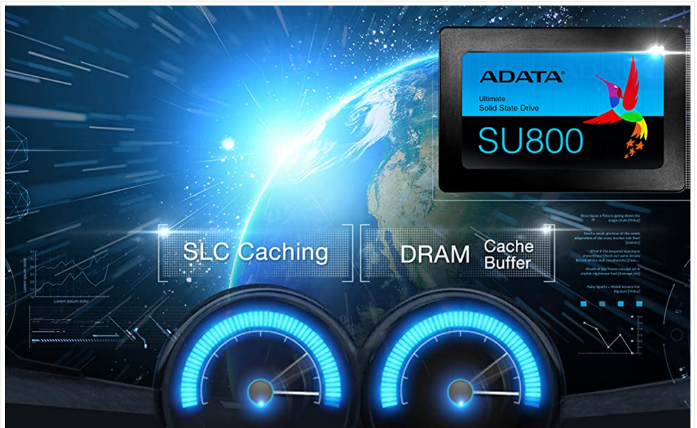
Figure 3: SLC Caching and DRAM Cache Buffer