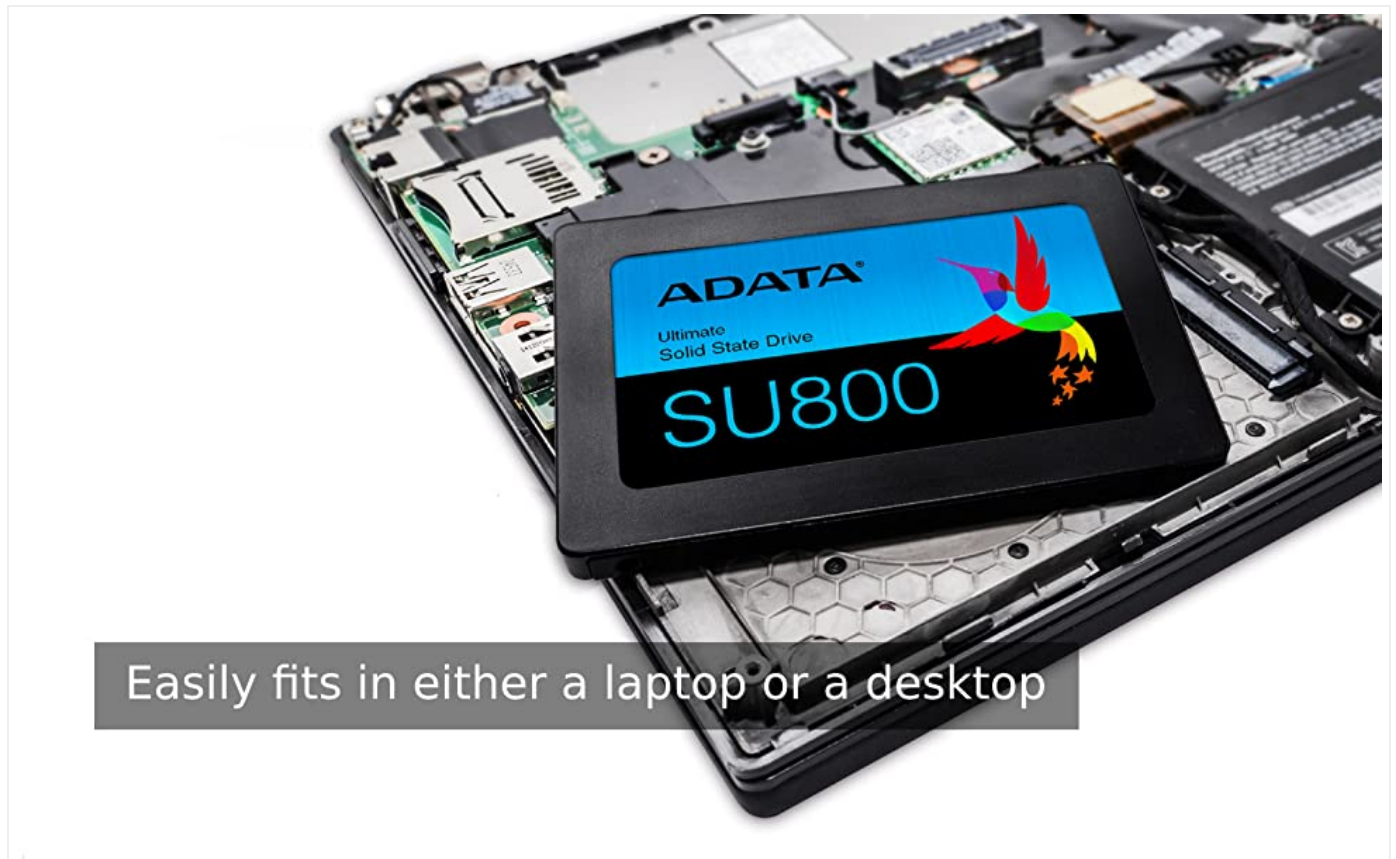
Figure 6: SSD fitting into a laptop bay