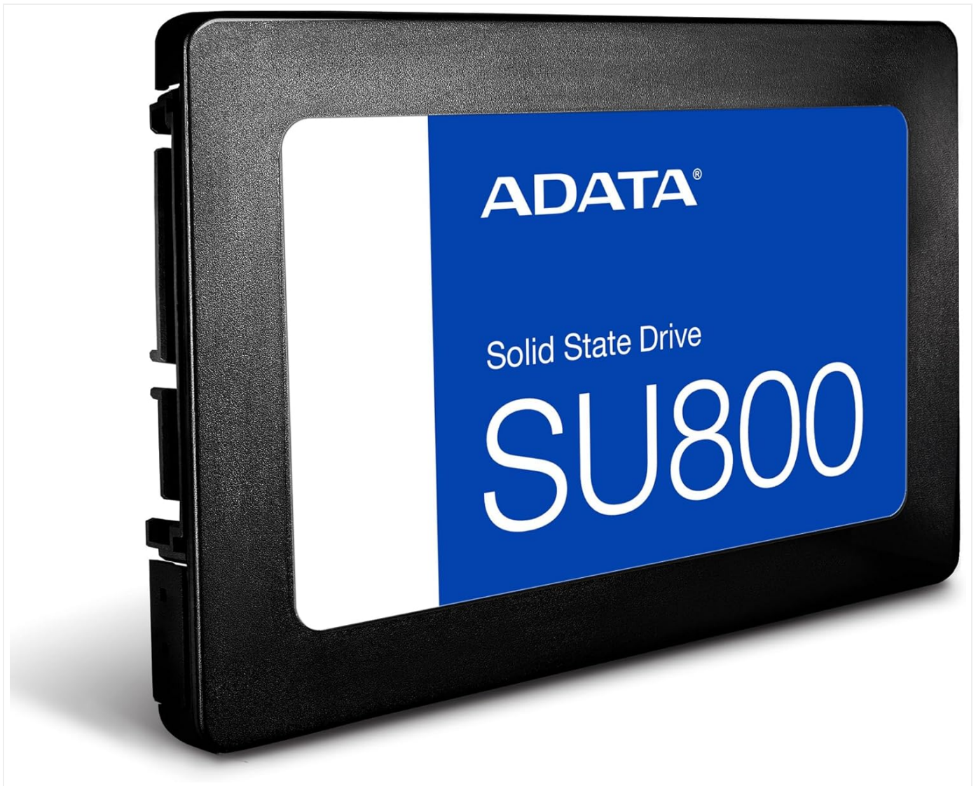
Figure 8: SSD Back Label with Model Information