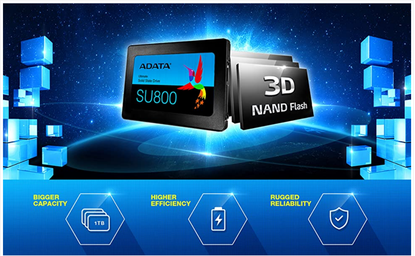
Figure 2: 3D NAND Flash Technology