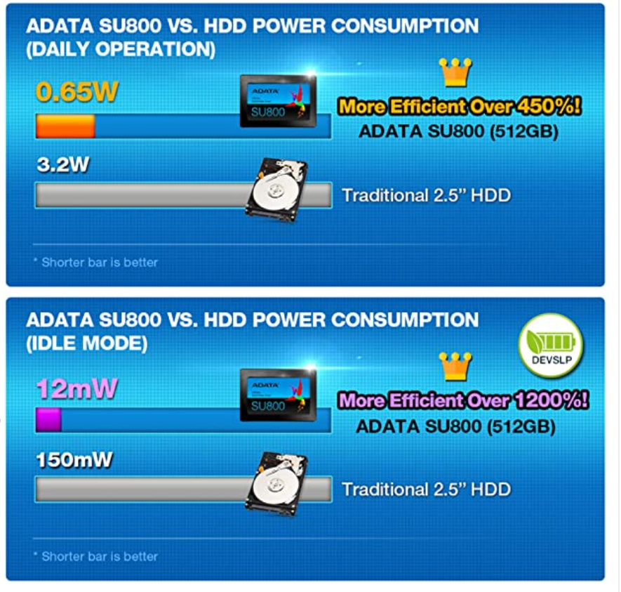
Figure 4: Low Power Consumption

Lower Power Consumption, Longer Battery Life