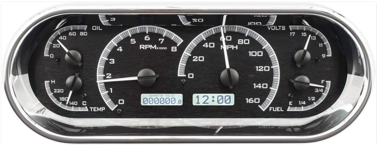
Figure 2.1: Front view of the VHX-1018-K-W gauge system, displaying speedometer, tachometer, oil pressure, water temperature, voltmeter, and fuel level gauges, along with digital readouts for odometer and clock.