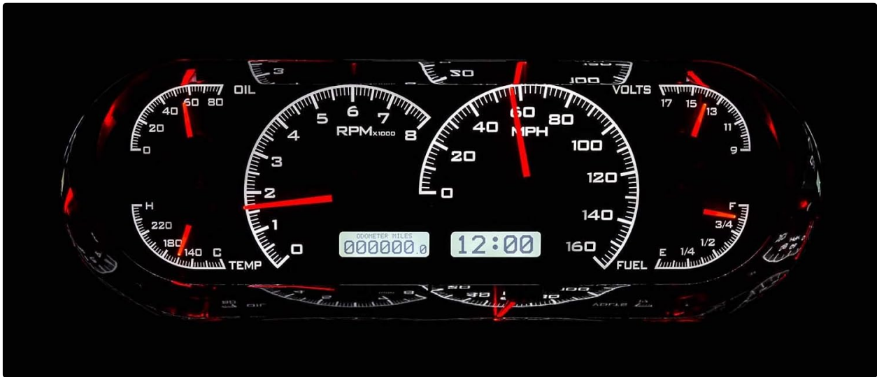
Figure 4.1: Gauge system with indicators active, demonstrating the visual alerts.