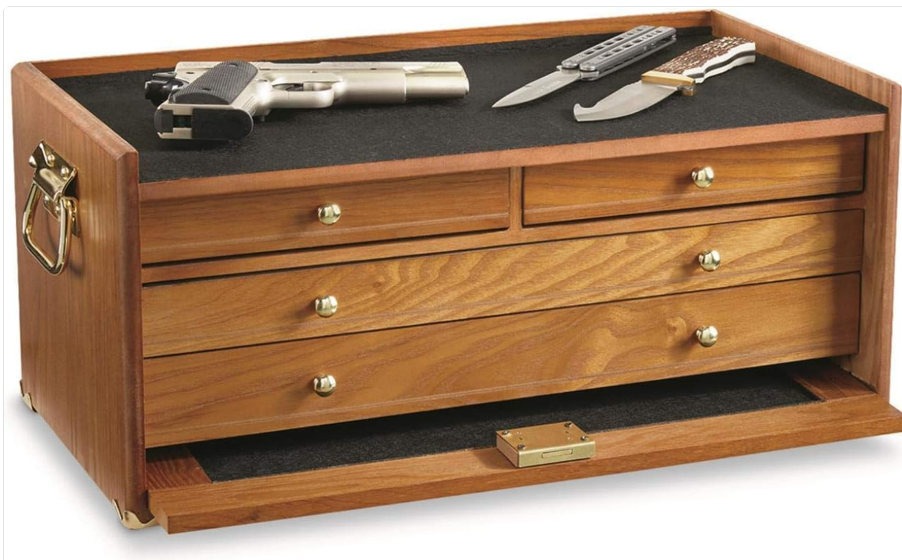
Image: The CASTLECREEK 4-Drawer Lockable Storage Chest, showcasing its oak finish and felt-lined top surface.

This manual provides instructions for the proper setup, operation, and maintenance of your CASTLECREEK 4-Drawer Lockable Storage Chest. This unit is designed to provide secure and organized storage for various items such as collectibles, keepsakes, and other valuables.