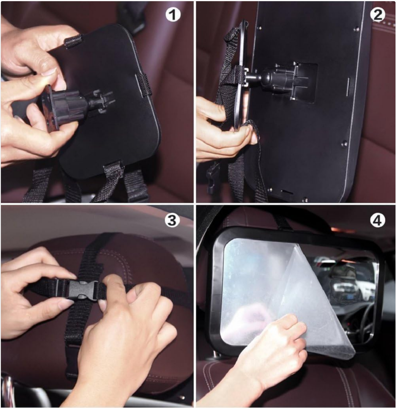
Image: A detailed view of the mirror's adjustable ball joint, highlighting its 360-degree rotation capability.