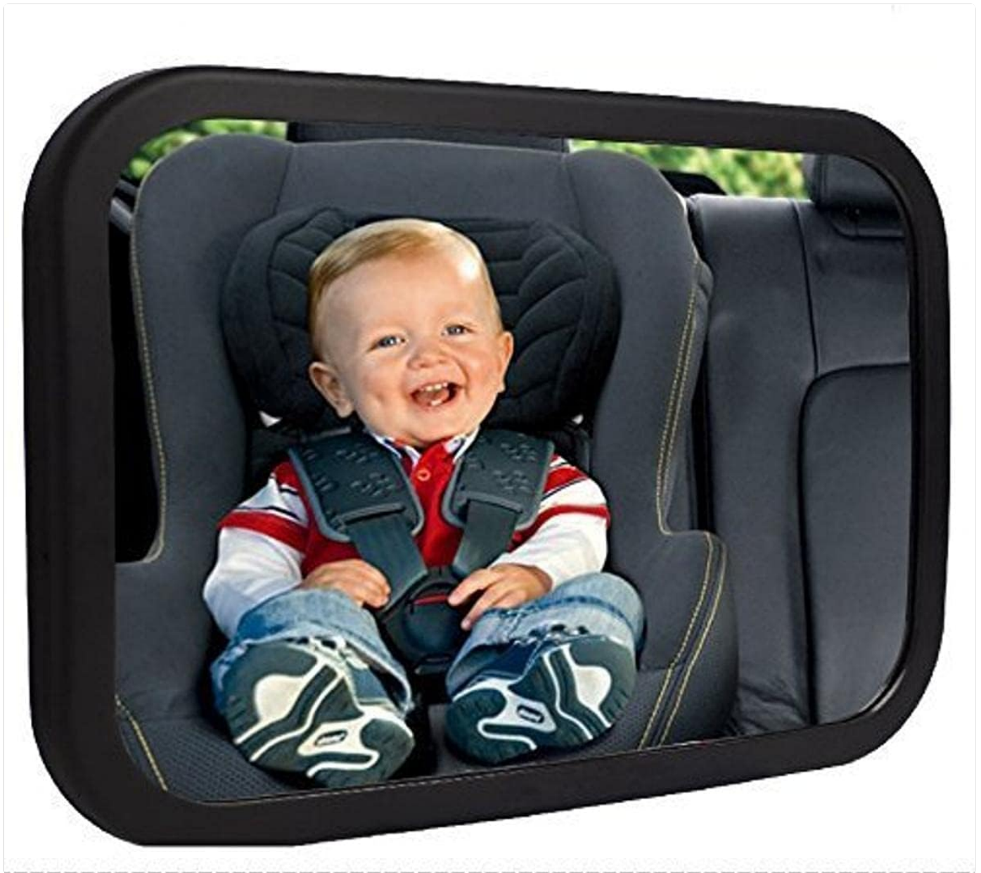
Image: The Shynerk Baby Car Mirror installed, reflecting a happy baby in a rear-facing car seat.