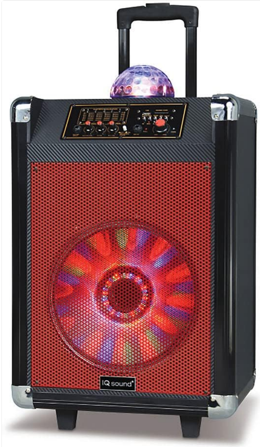
Figure 1: Front view of the IQ Sound IQ-3612DJBT speaker, showing the 12-inch woofer with LED lights, control panel, disco ball light on top, and retractable handle.

Familiarize yourself with the main components of your speaker.