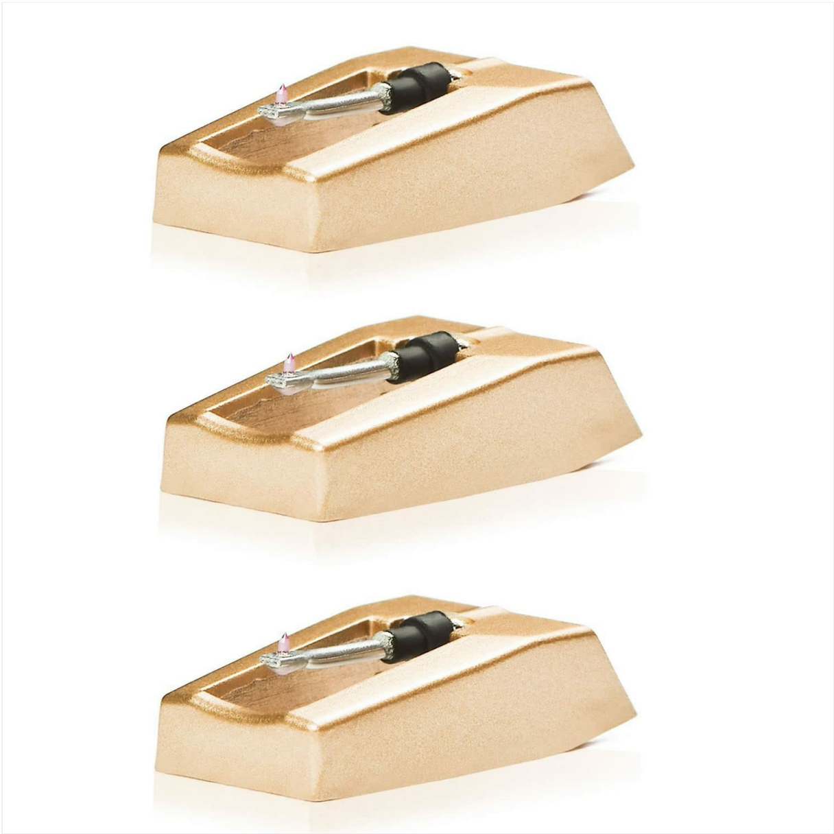
Image: The eXuby Diamond Tip Record Player Needle, emphasizing its benefits for sound quality, record preservation, and durability.