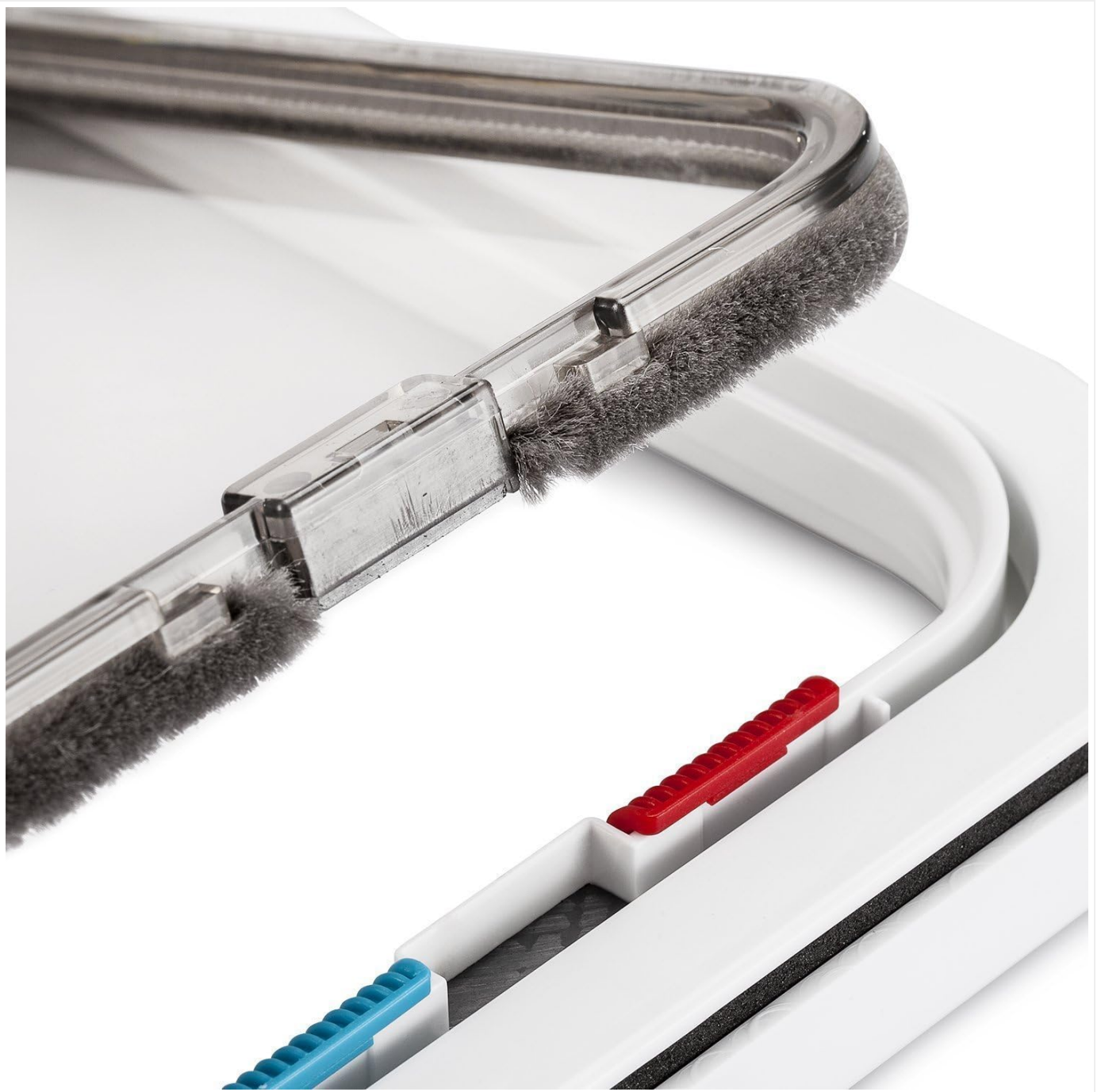
Figure 4: Detail of the 4-way locking mechanism. This image shows the red and green sliders at the base of the cat flap, which are used to select the desired access mode, along with the brush strip for weather sealing.