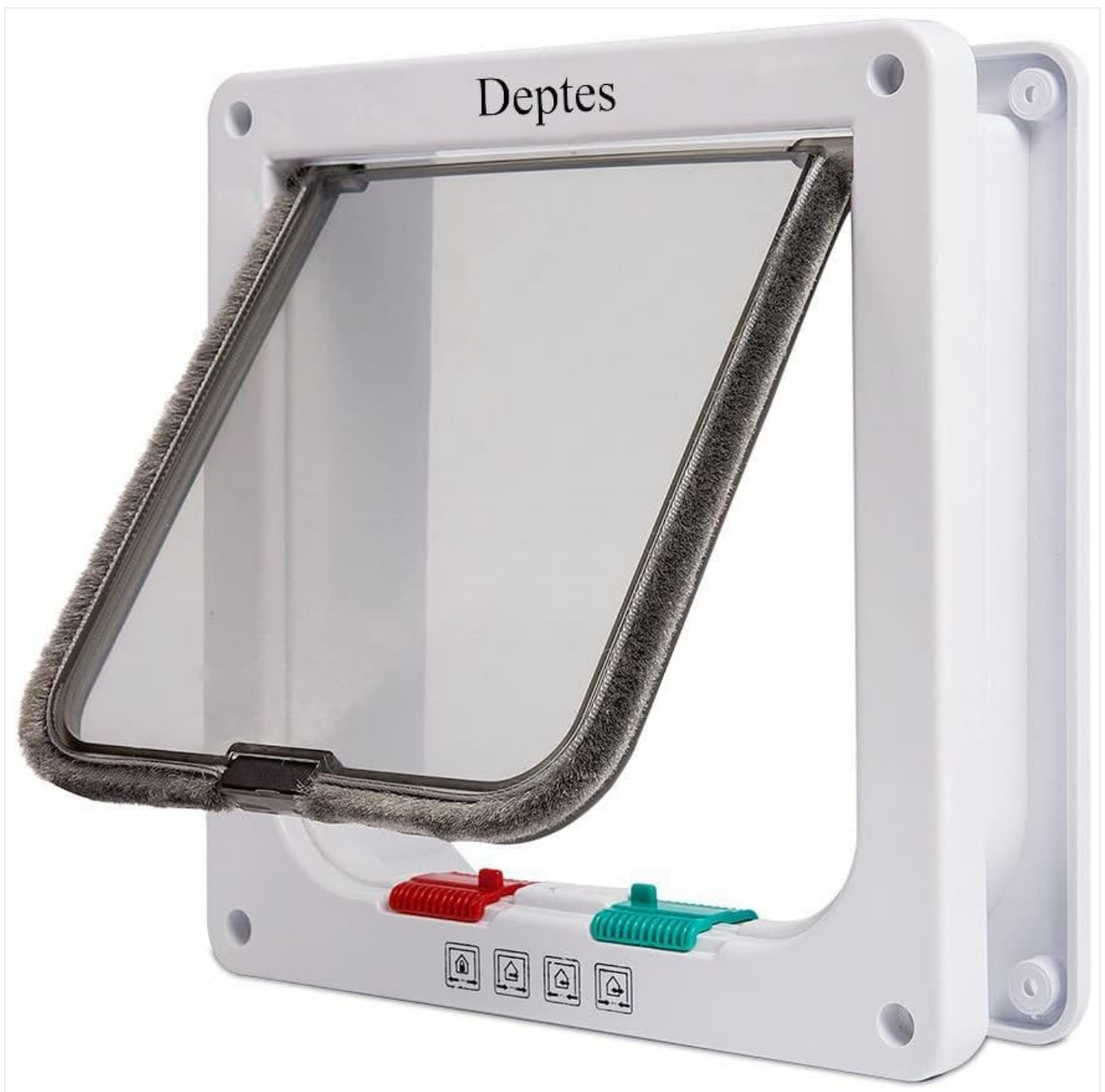
Figure 3: The Depets Cat Flap Door ready for use. This image shows the cat flap installed in a door, highlighting its transparent flap and the red and green sliders for the locking mechanism.