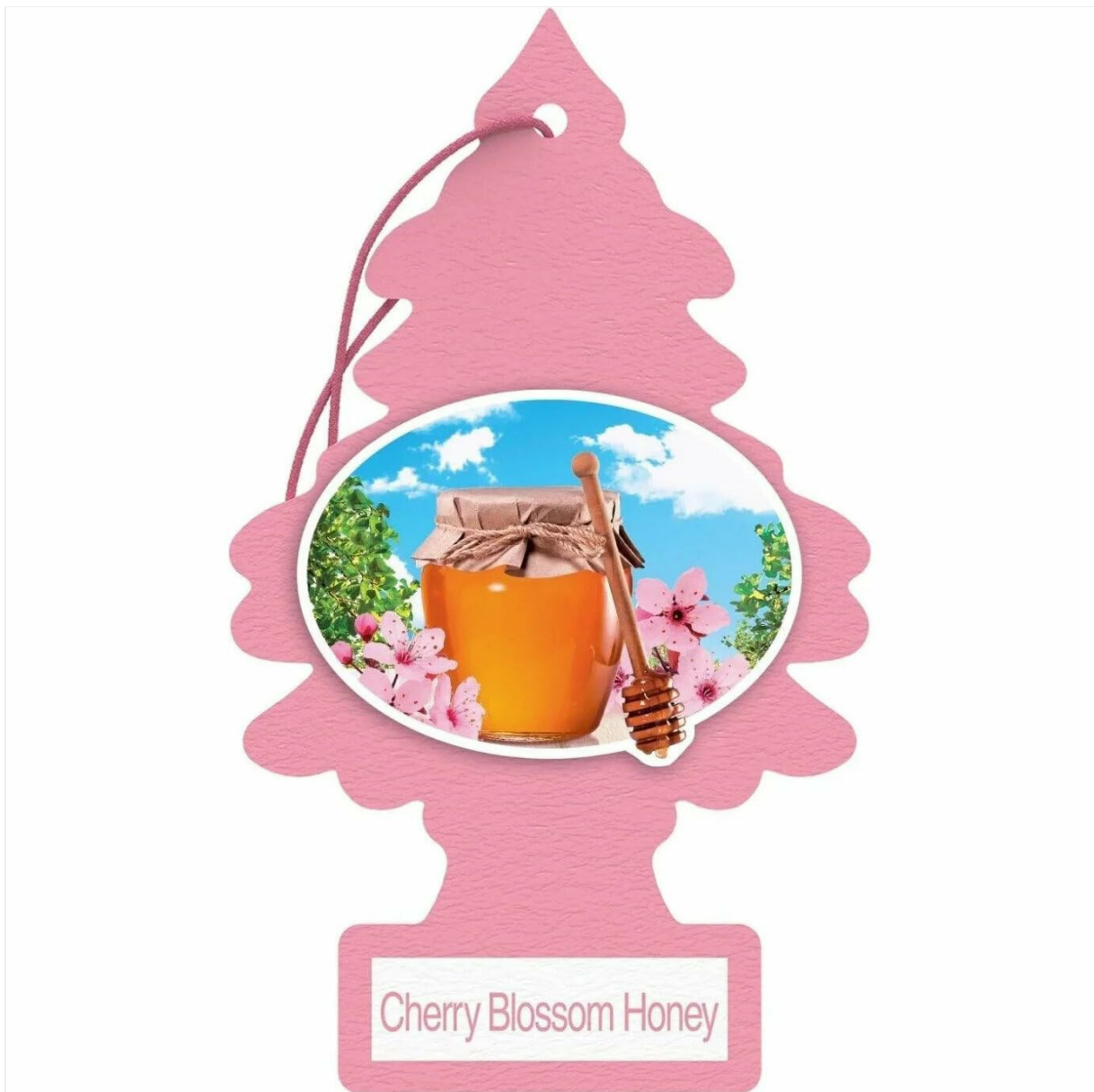
Image 1: Front view of the LITTLE TREES Cherry Blossom Honey Air Freshener in its original packaging.