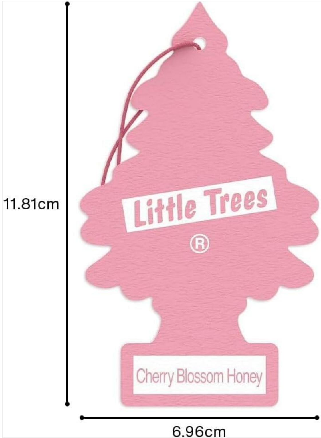
Image 5: Visual representation of the air freshener itself, showing approximate dimensions of 11.81 cm (length) and 6.96 cm (width).