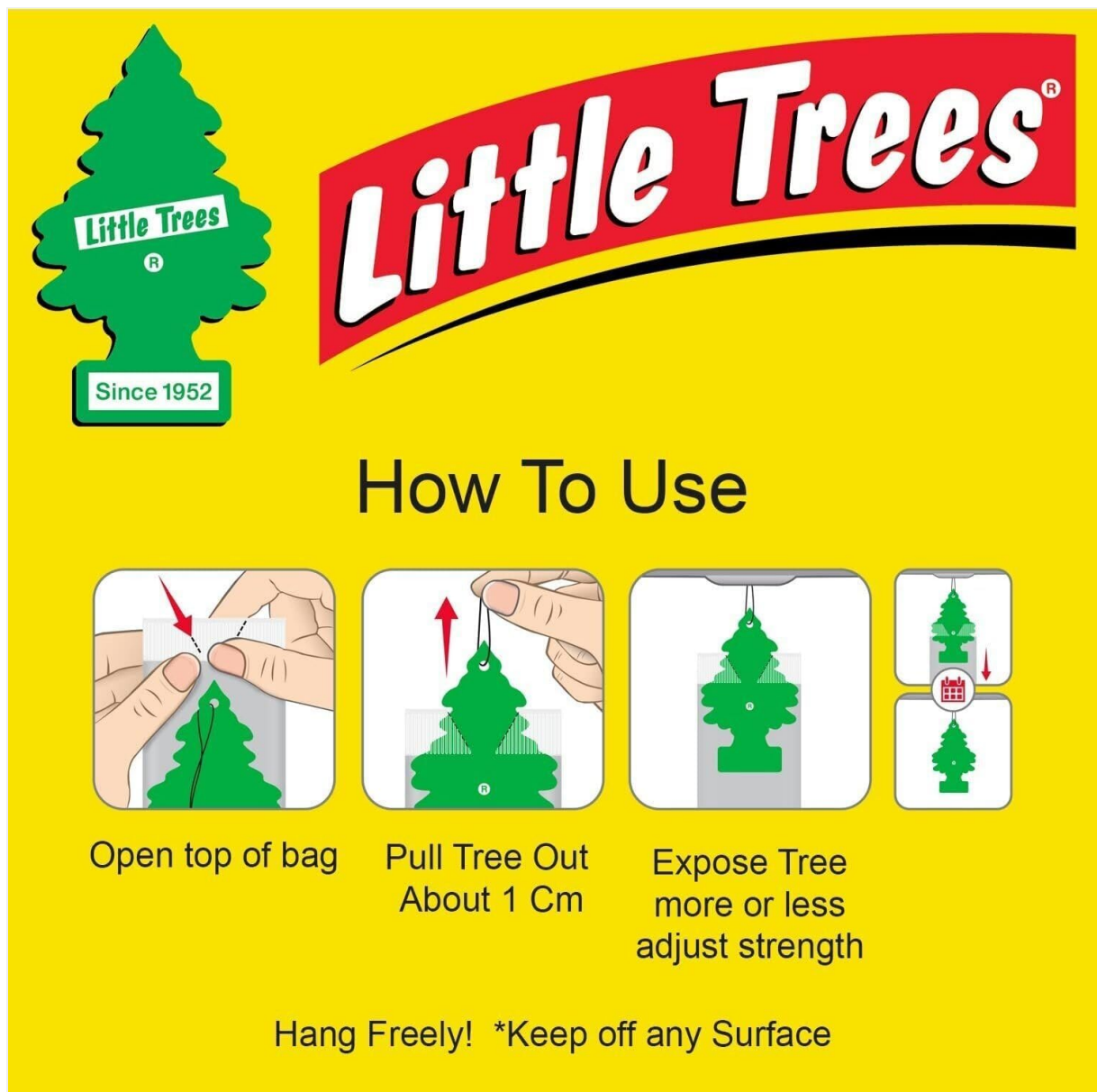
Image 3: Step-by-step visual guide for setting up and adjusting the air freshener's fragrance.