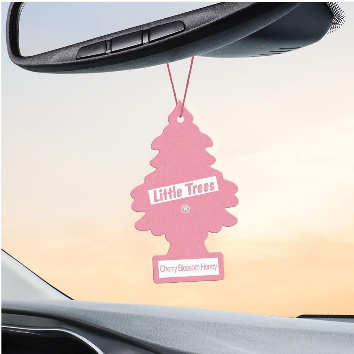
Image 4: Example of the air freshener properly hanging from a car's rearview mirror, demonstrating free suspension.