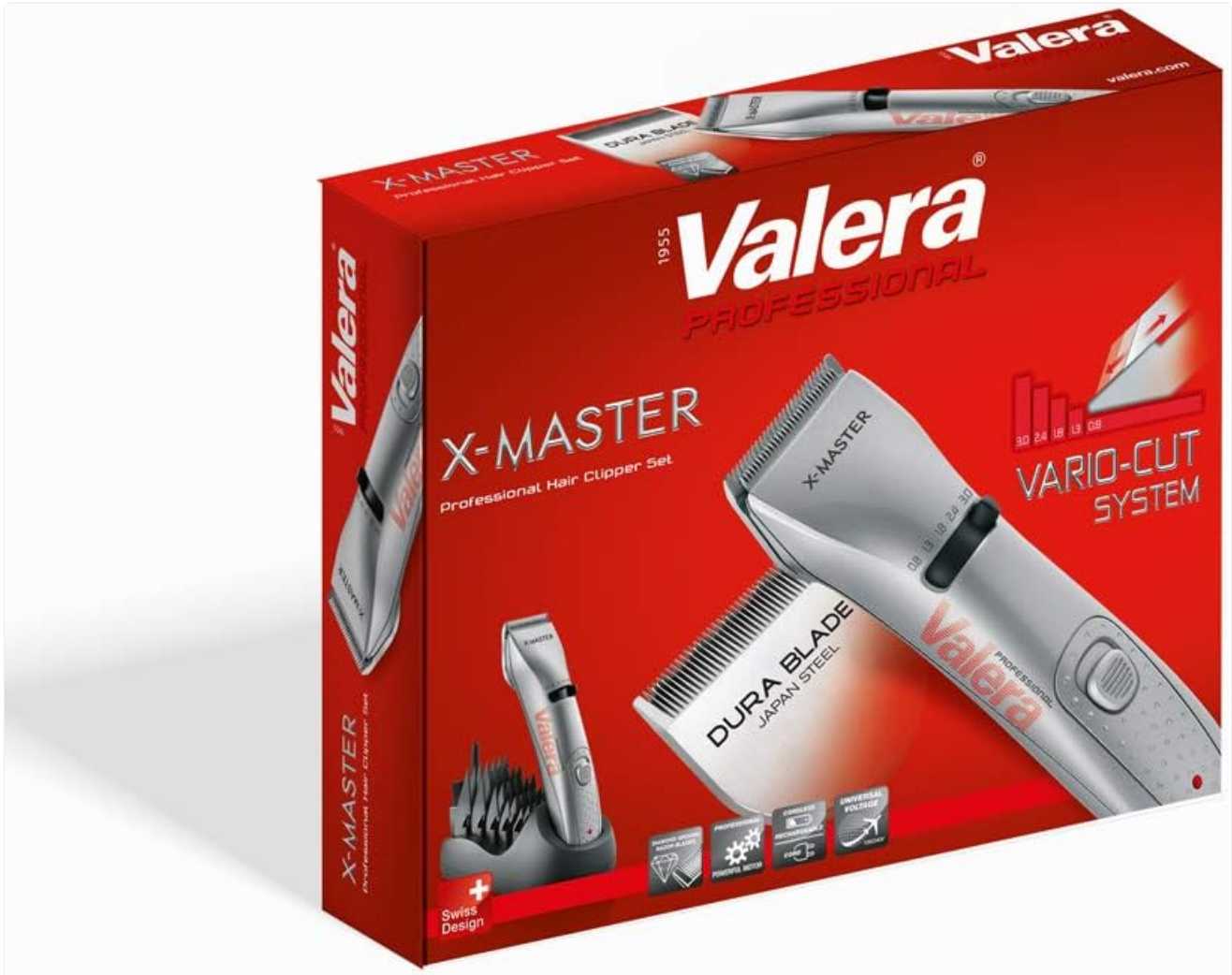
Figure 3.1: Contents of the VALERA X-Master 652.03 package.