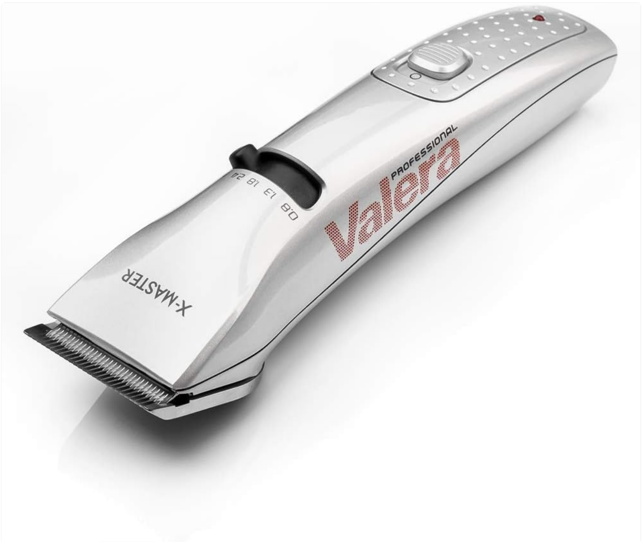
Figure 4.1: VALERA X-Master 652.03 Hair Clipper overview.