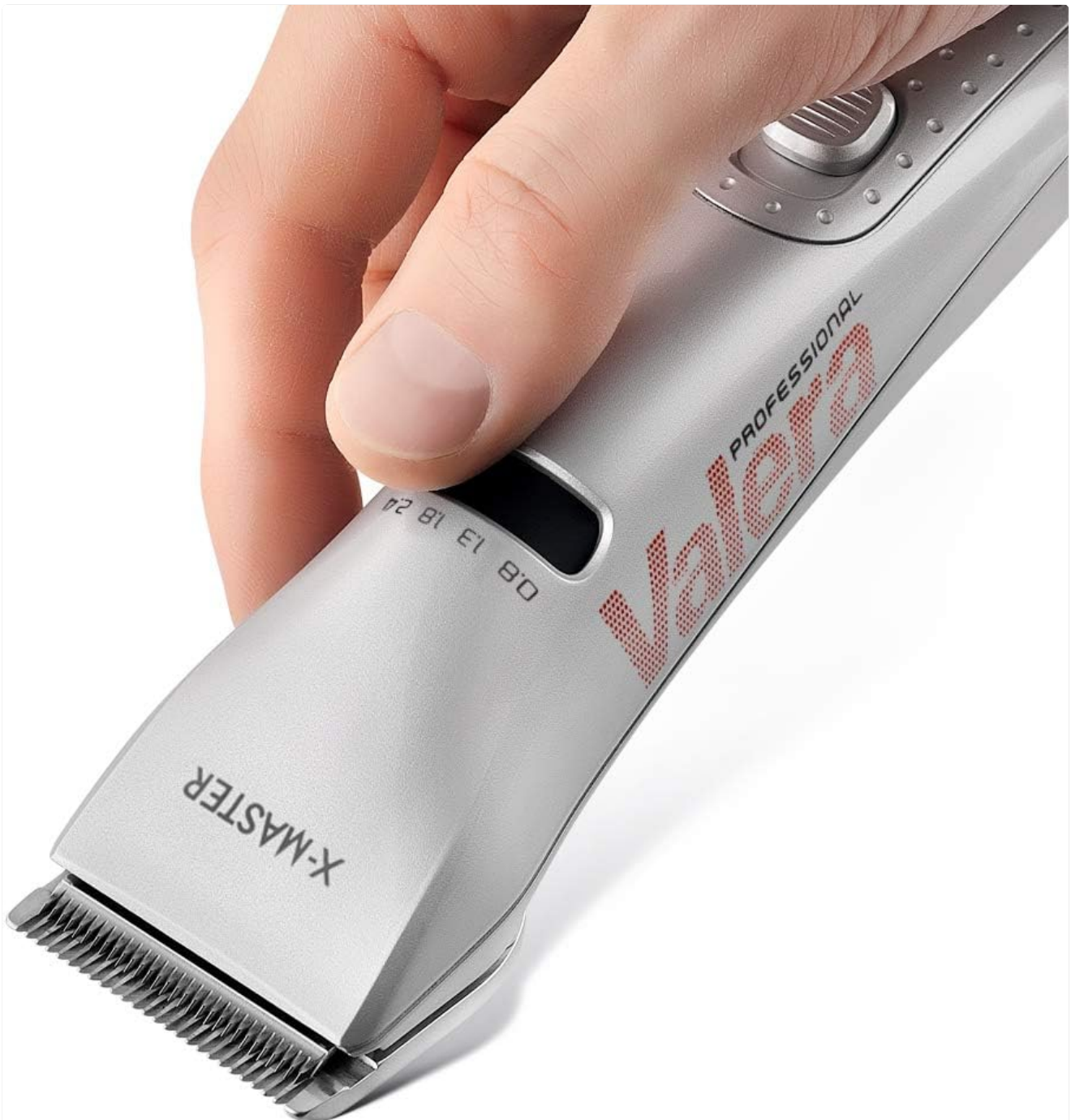
Figure 6.1: Adjusting the Vario-Cut system.