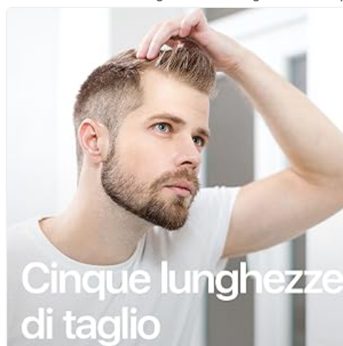
Figure 6.3: Checking haircut for evenness.