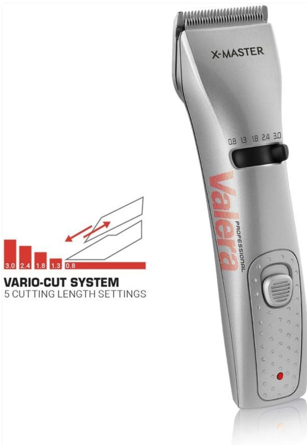
Figure 4.2: Vario-Cut system for adjustable cutting lengths.