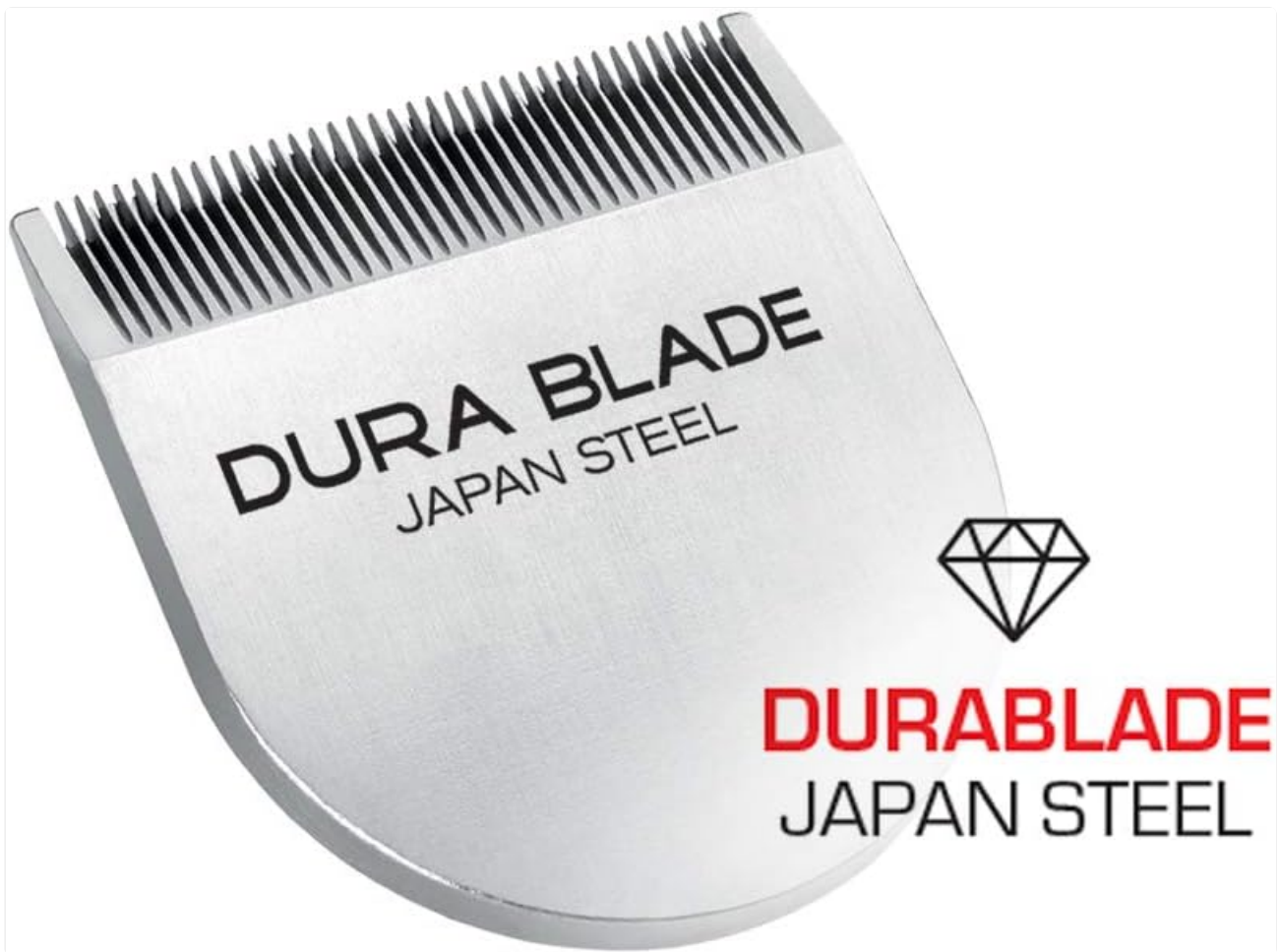
Figure 4.3: Dura Blade Japanese Steel blade.