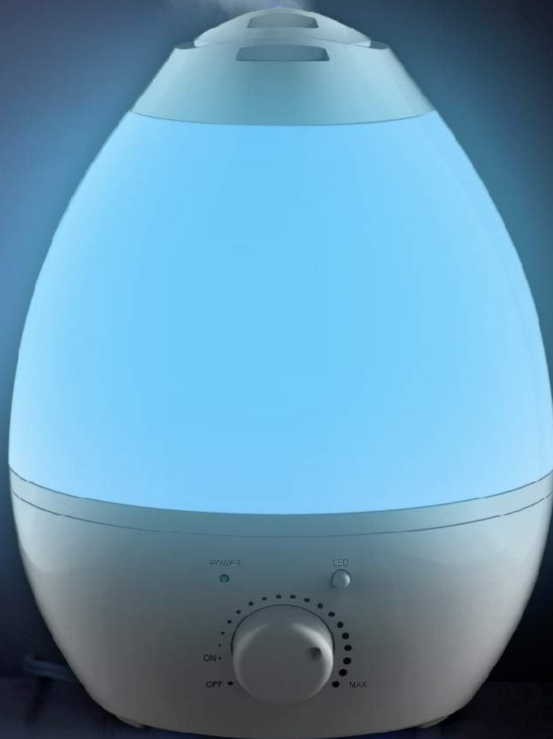
Image 5: The Bell+Howell humidifier in use, highlighting the aroma diffuser feature with mist and a gentle blue light, suggesting the integration of essential oils.

The aroma diffuser tray is compatible with essential oils, use your favorite oils such as lavender, eucalyptus, lemongrass, orange, peppermint, tea tree.