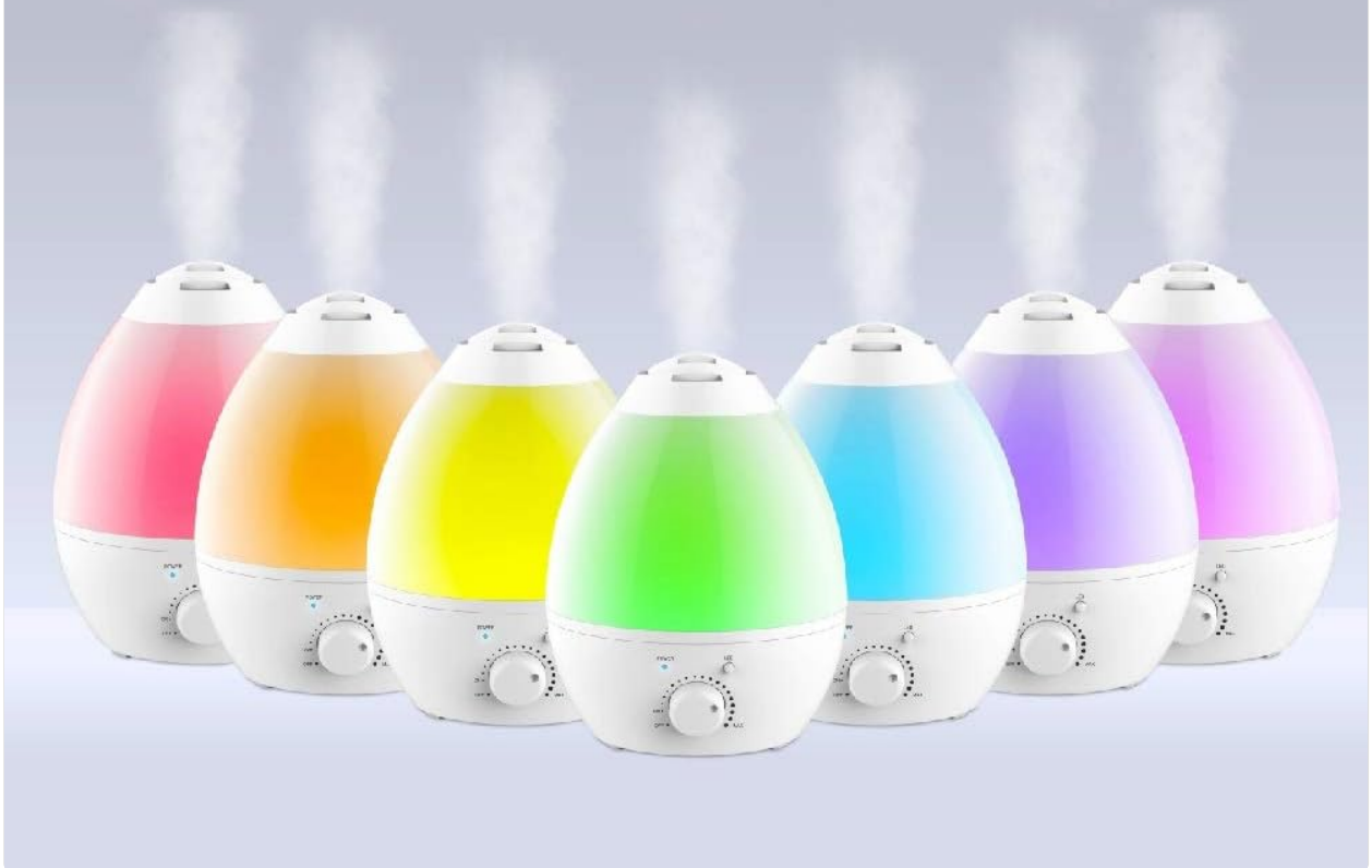
Image 4: Multiple Bell+Howell humidifiers displaying the range of 7 color-changing LED lights, providing a visual of the ambient lighting feature.

Note: The LED light cannot be turned off independently while the humidifier is in operation. It will remain on as long as the unit is producing mist.