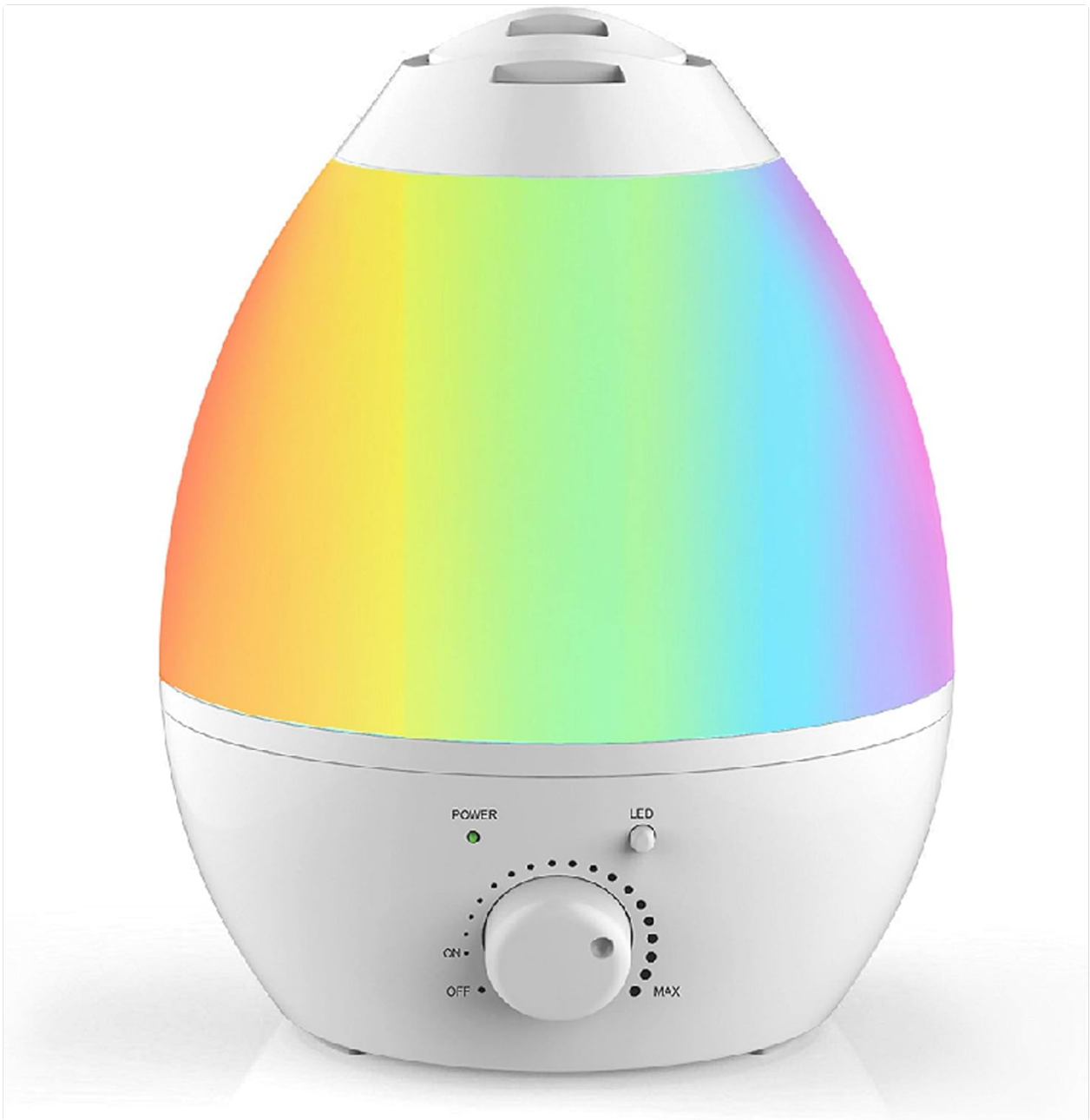
Image 1: The Bell+Howell 7 LED Color Changing Humidifier, showcasing its sleek design and vibrant LED lighting.

This humidifier features a 3.8-liter capacity, offering extended operation. It includes a built-in 7-color LED night light and an aroma diffuser tray for use with essential oils. The unit is designed for quiet operation and includes an automatic shut-off feature for safety.