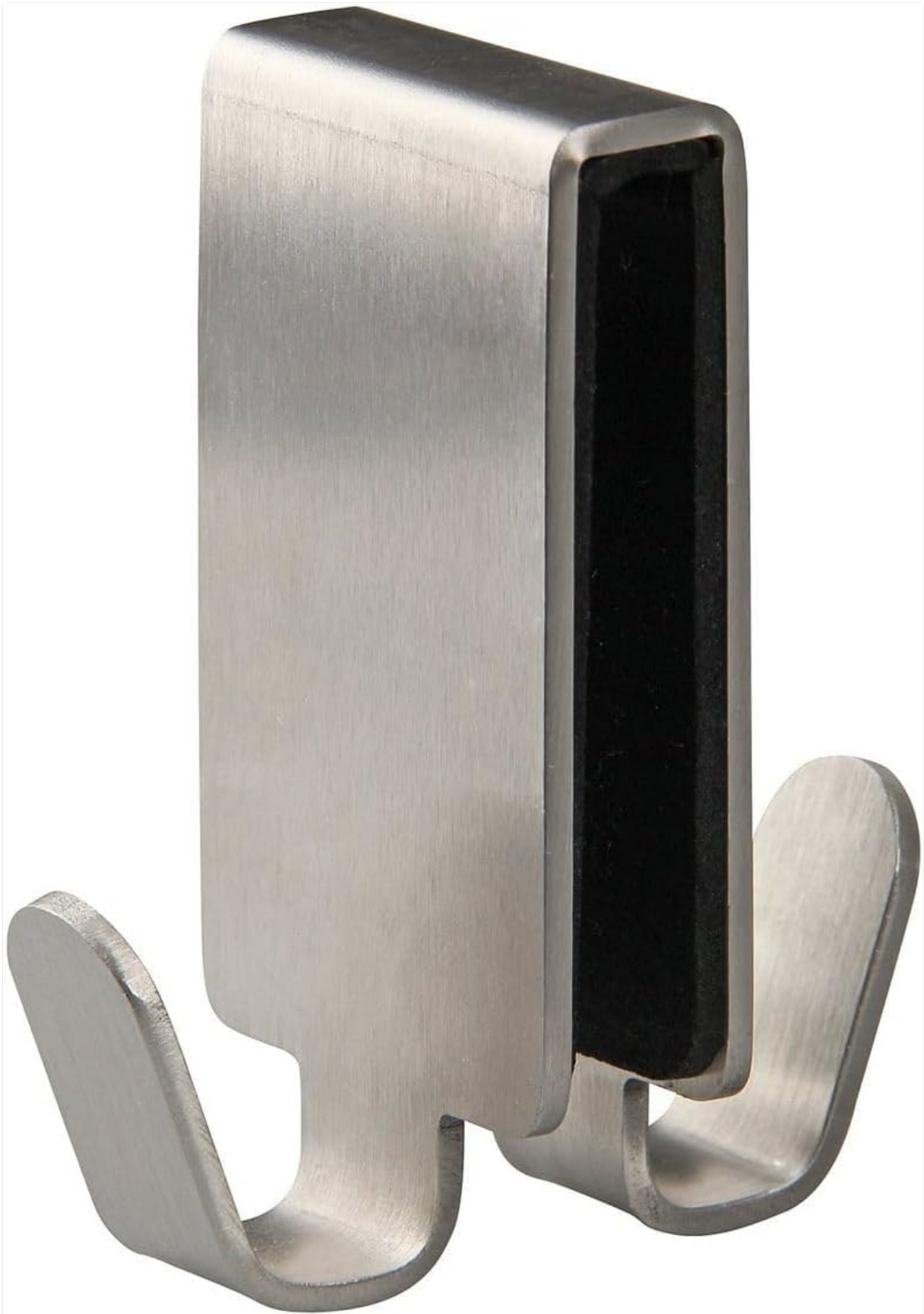
Image: The Fackelmann Double Hook, made of stainless steel with a black protective lining.