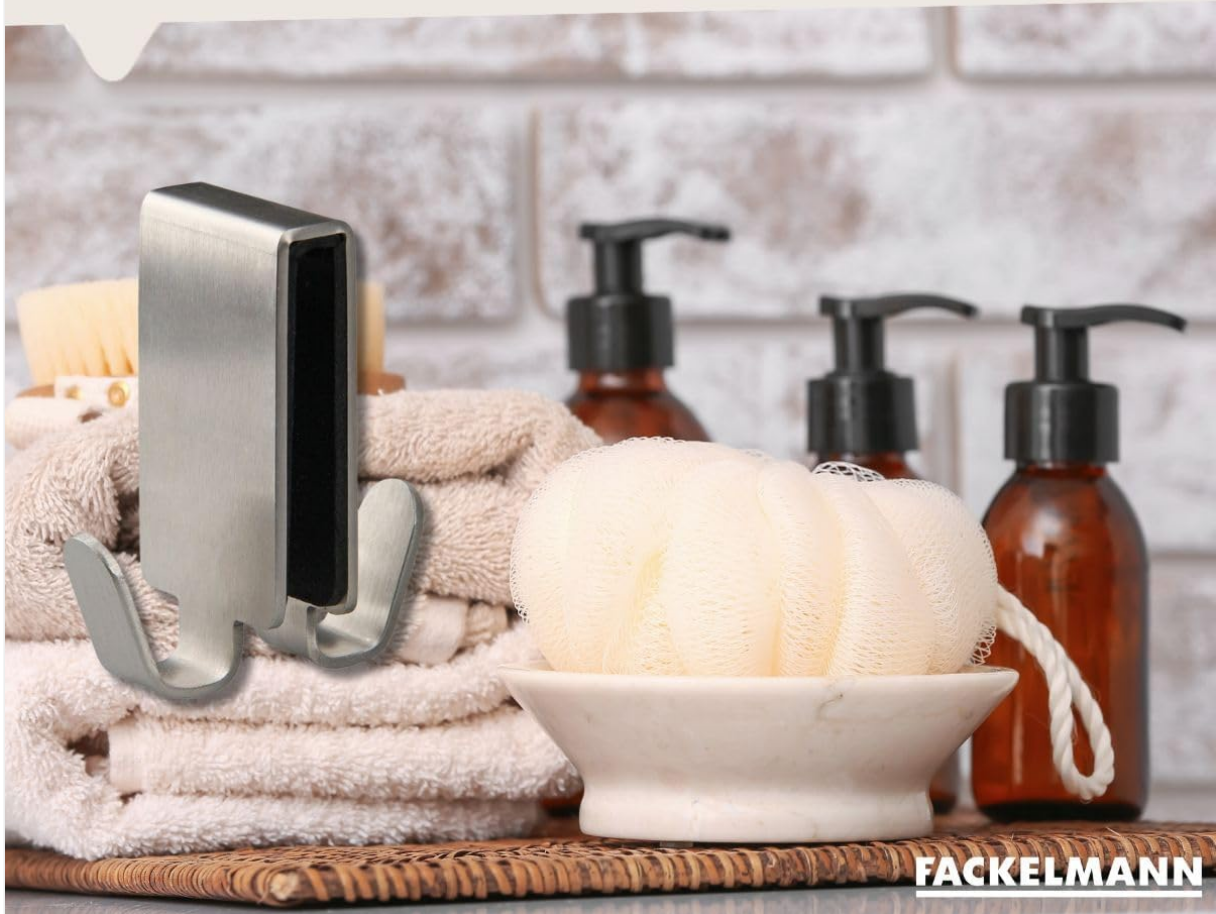
Image: The double hook in a shower setting, demonstrating its ability to organize items both inside and outside the shower, such as bath towels and shower accessories.