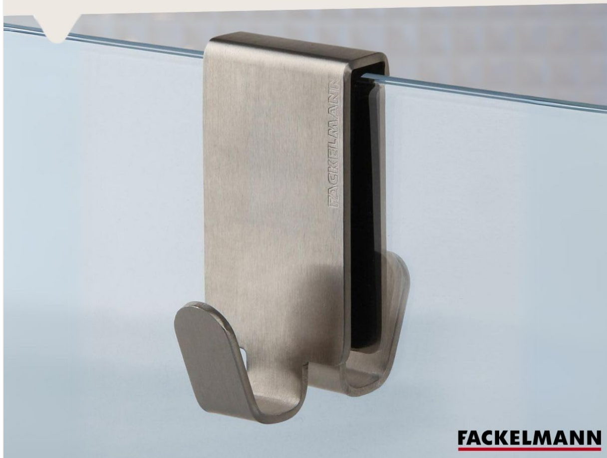
Image: The double hook securely placed on a glass shower wall, demonstrating its intended use.