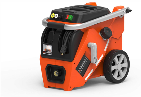
Figure 2: Side view of the pressure washer, highlighting its compact design and wheels.