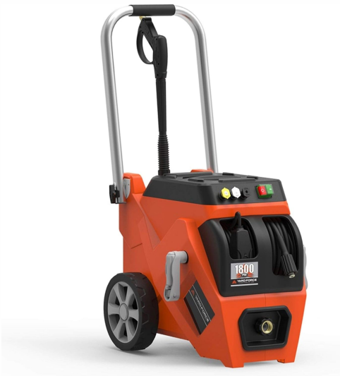
Figure 1: Front view of the Yard Force YF1800LR Electric Pressure Washer with its handle extended, showing the hose reel and nozzle storage.

Familiarize yourself with the main components of your Yard Force YF1800LR Electric Pressure Washer.