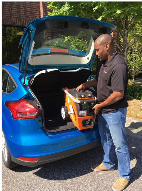
Figure 4: A person extending the handle of the pressure washer for use.

Extend the folding handle to its upright position until it locks securely. The handle provides a comfortable grip for moving the unit.