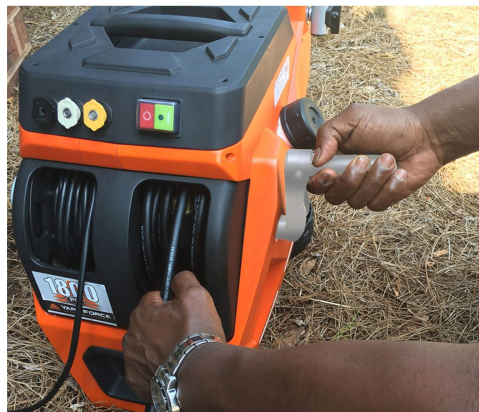
Figure 8: A close-up view of the quick-connect nozzles, showing their color coding and spray patterns.

To change nozzles, turn off the pressure washer and ensure no pressure remains in the system by squeezing the trigger. Pull back the collar on the spray wand, insert the new nozzle, and release the collar to lock it in place.