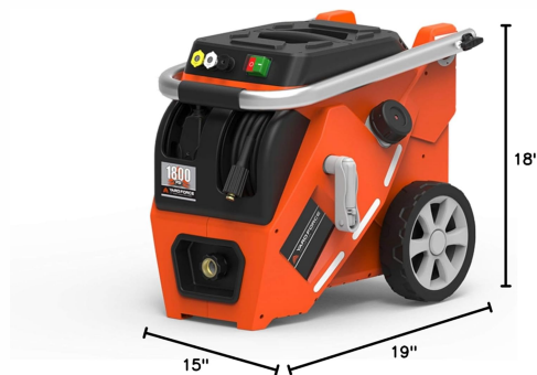
Figure 9: The compact dimensions of the pressure washer (19"L x 15"W x 18"H) for easy storage.

The folding handle allows for compact storage. Wind the power cord onto its reel and store the high-pressure hose on its reel. Store the spray gun and nozzles in the designated compartments on the unit.