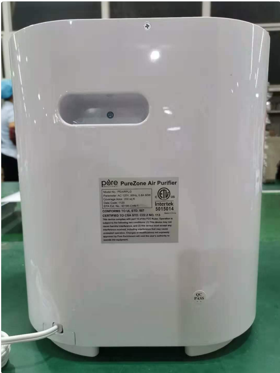
Image: Back view of the PureZone Air Purifier showing the model number and electrical specifications.