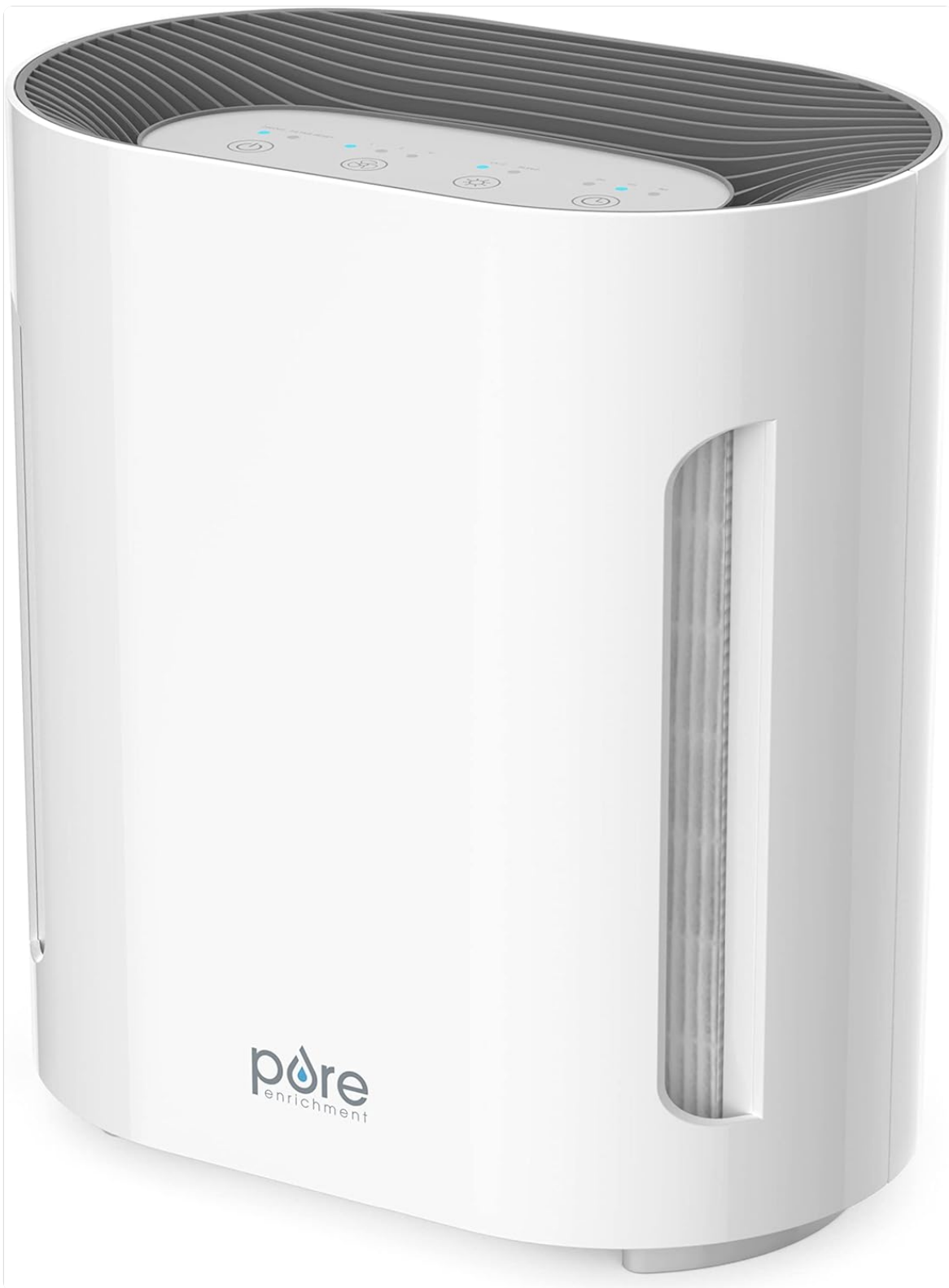
Image: Pure Enrichment PureZone Air Purifier, front view.