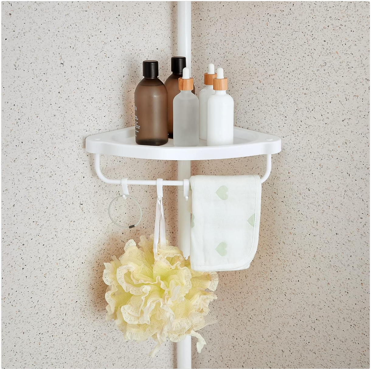
Image 5.1: A close-up of one of the shelves, demonstrating the practical hooks for hanging accessories like a loofah and a towel.