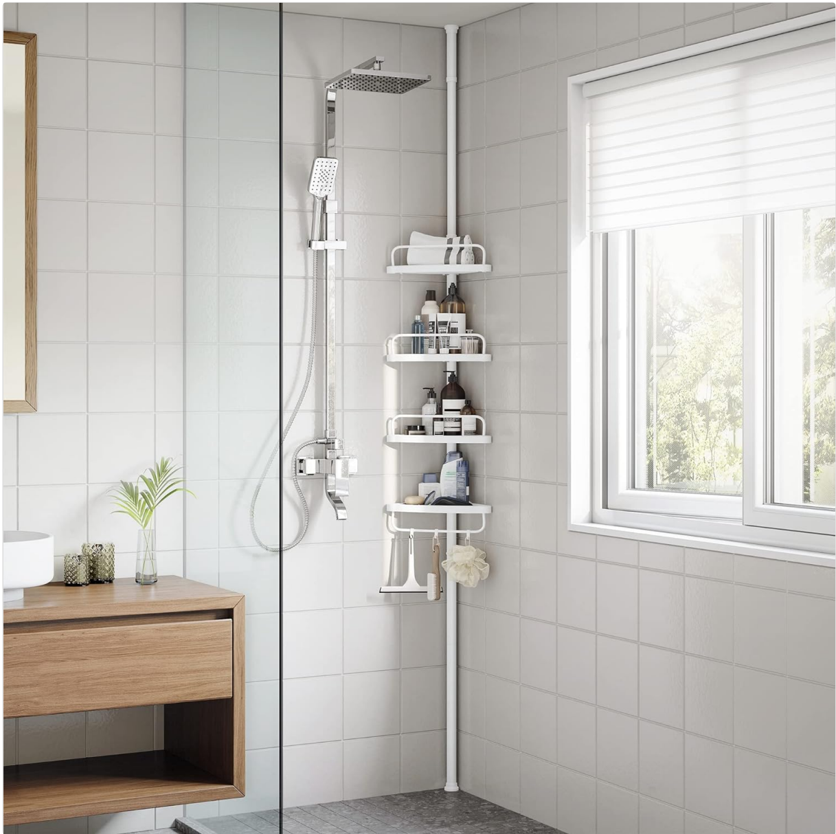
Image 1.1: The SONGMICS BCB001A Telescopic Bathroom Shower Shelf installed in a shower corner, showcasing its four shelves and space-saving design.