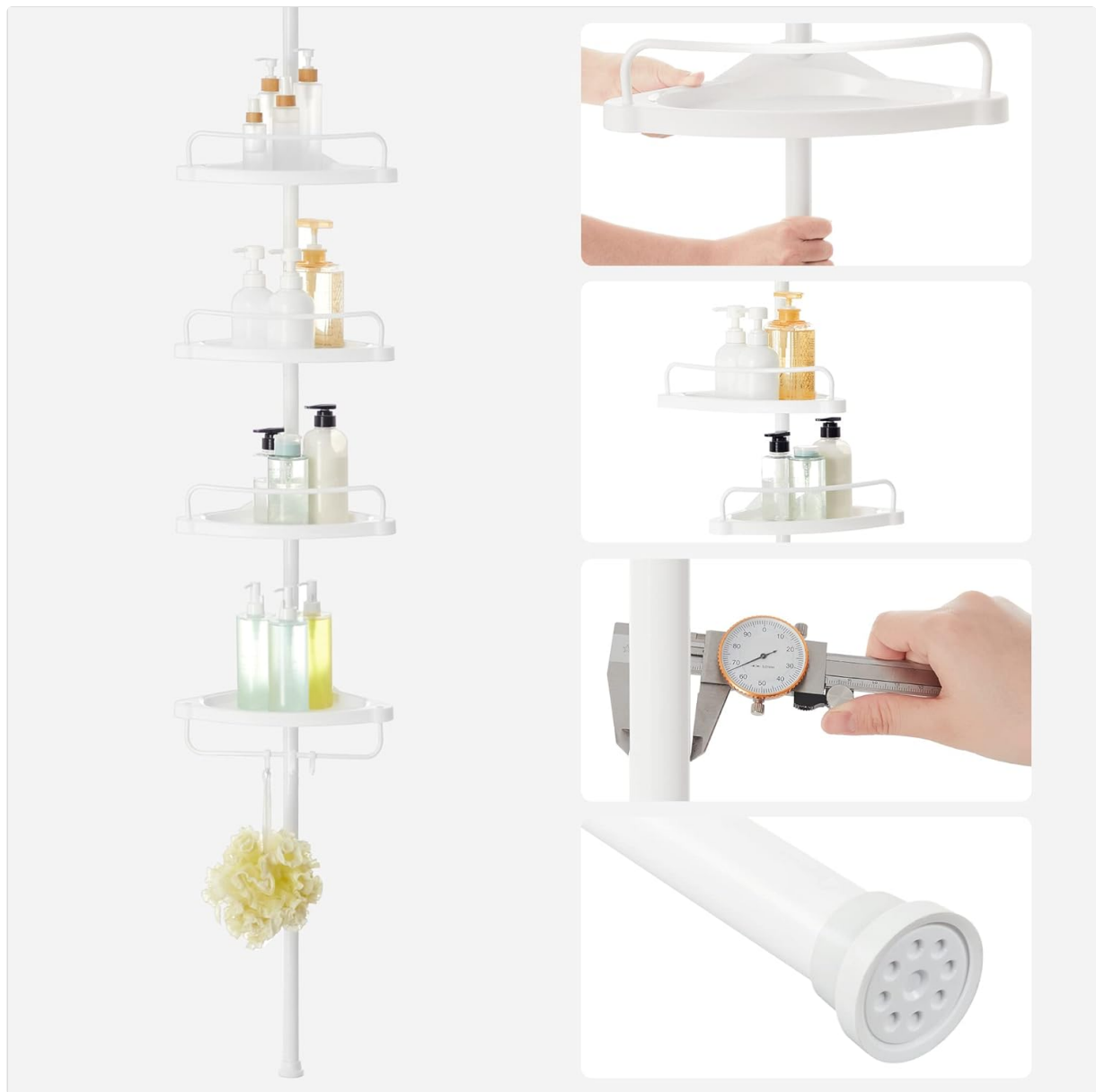
Image 4.3: Close-up views demonstrating how to adjust the shelves using rubber rings, the stability of items on the shelves, and the design of the pole's base.