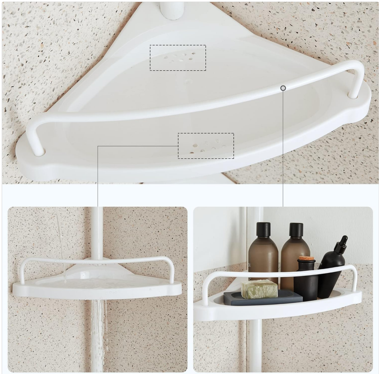
Image 5.2: This image highlights the drainage holes on the shelves, designed to prevent water from pooling and to keep stored items dry.