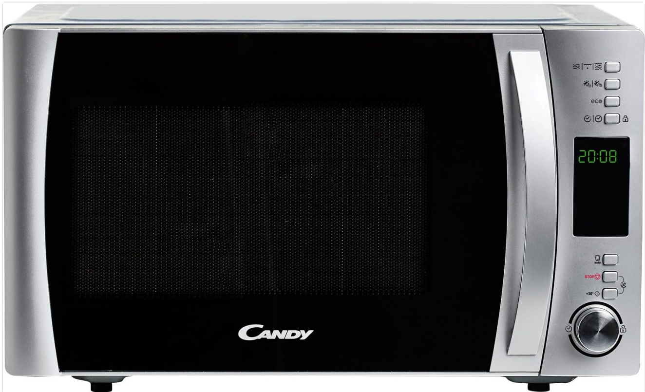
Image: Front view of the Candy CMXG 25DCS microwave, showing the digital display and control buttons on the right side.

The control panel features a digital display, function buttons, and a rotary knob for setting time and selecting programs.