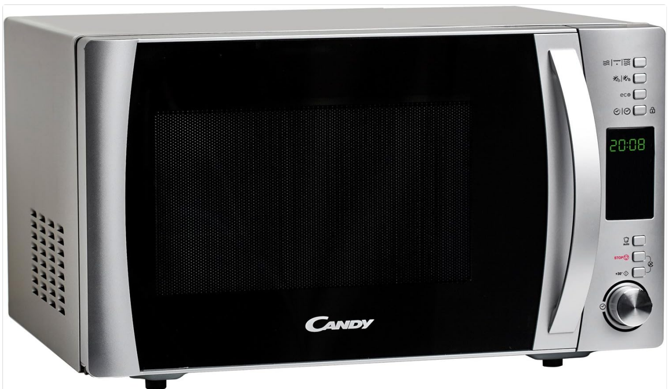
Image: Side view of the Candy CMXG 25DCS microwave, illustrating the ventilation grilles on the side panel. This highlights the need for adequate space around the appliance for proper airflow.

Do not block any ventilation openings. Do not place the oven near heat sources or in a damp environment.