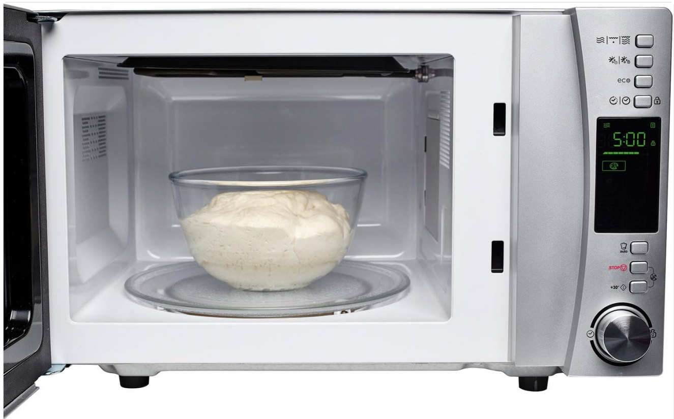
Image: Interior view of the microwave, showing the glass turntable and a bowl of dough. This illustrates the internal capacity and the turntable in use.