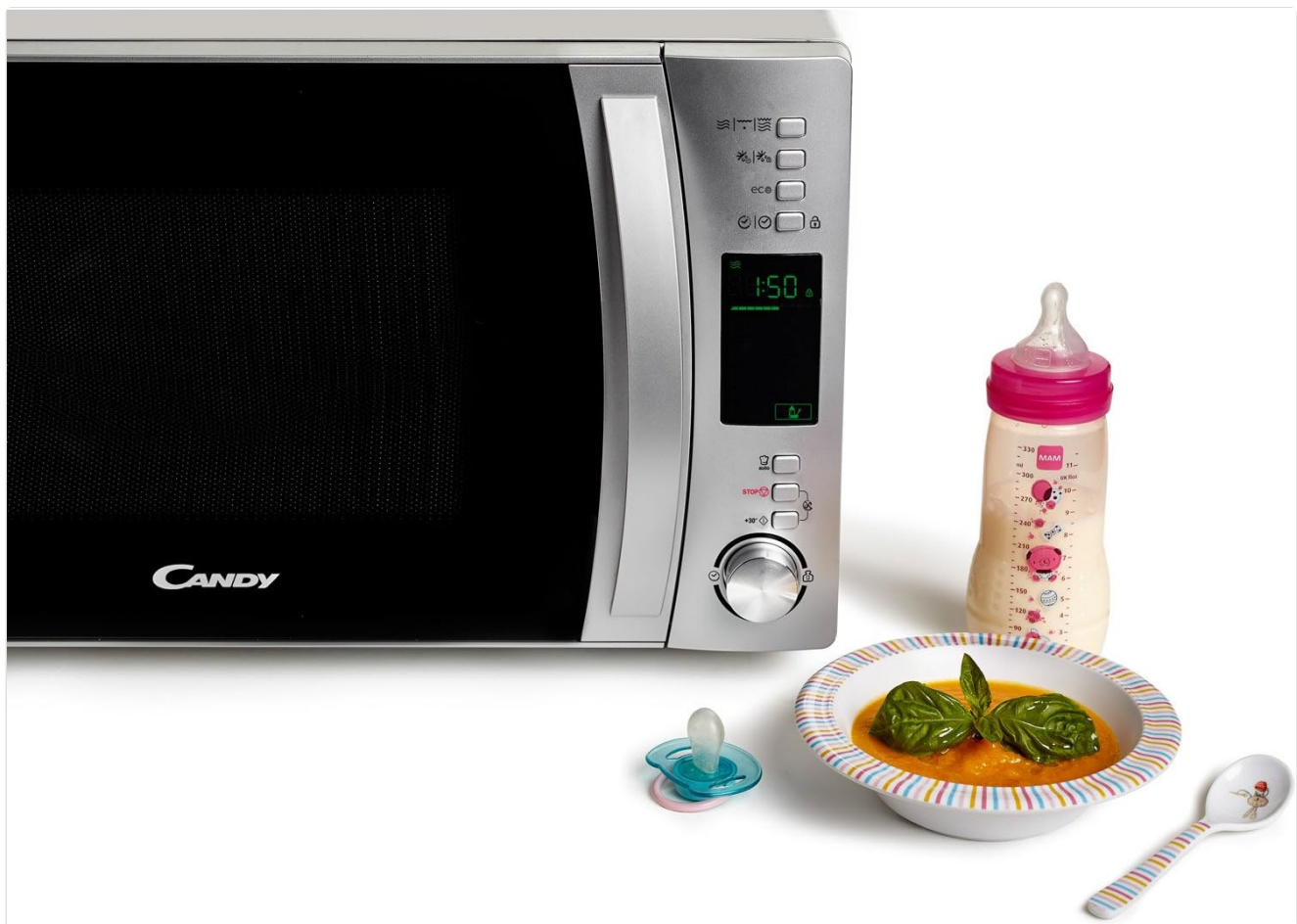
Image: The Candy CMXG 25DCS microwave positioned beside a baby bottle and a bowl of baby food, highlighting its "baby & healthy" automatic programs.