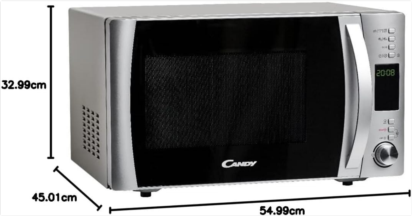
Image: Diagram showing the dimensions of the Candy CMXG 25DCS microwave: 32.99cm height, 45.01cm depth, and 54.99cm width.

Detailed technical specifications for the Candy X-Range CMXG 25DCS Microwave with Grill.