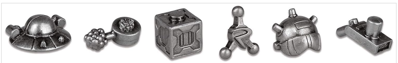
Image: A close-up view of the six unique metal game tokens: Council of Ricks Badge, Meeseeks Box, Oportal Gun, Plumbus, Rick's Car, and Snuffles' Helmet.