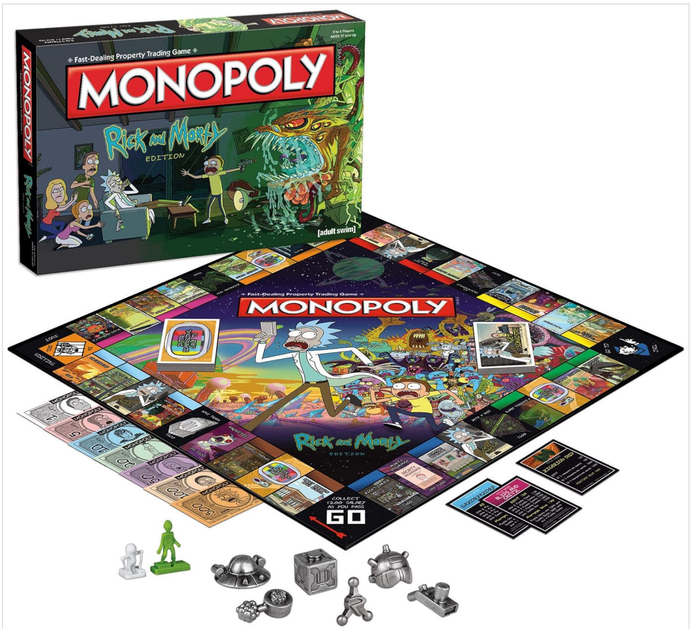
Image: An overhead view of the Monopoly Rick and Morty game board, displaying all game components including tokens, cards, and currency, laid out for play.