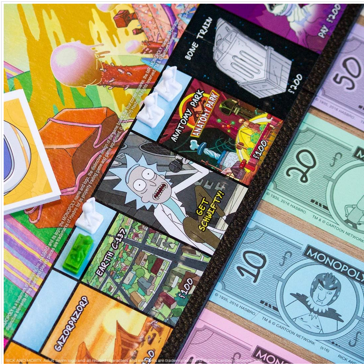
Image: A detailed view of several property spaces on the game board, showcasing Rick and Morty themed locations and artwork.