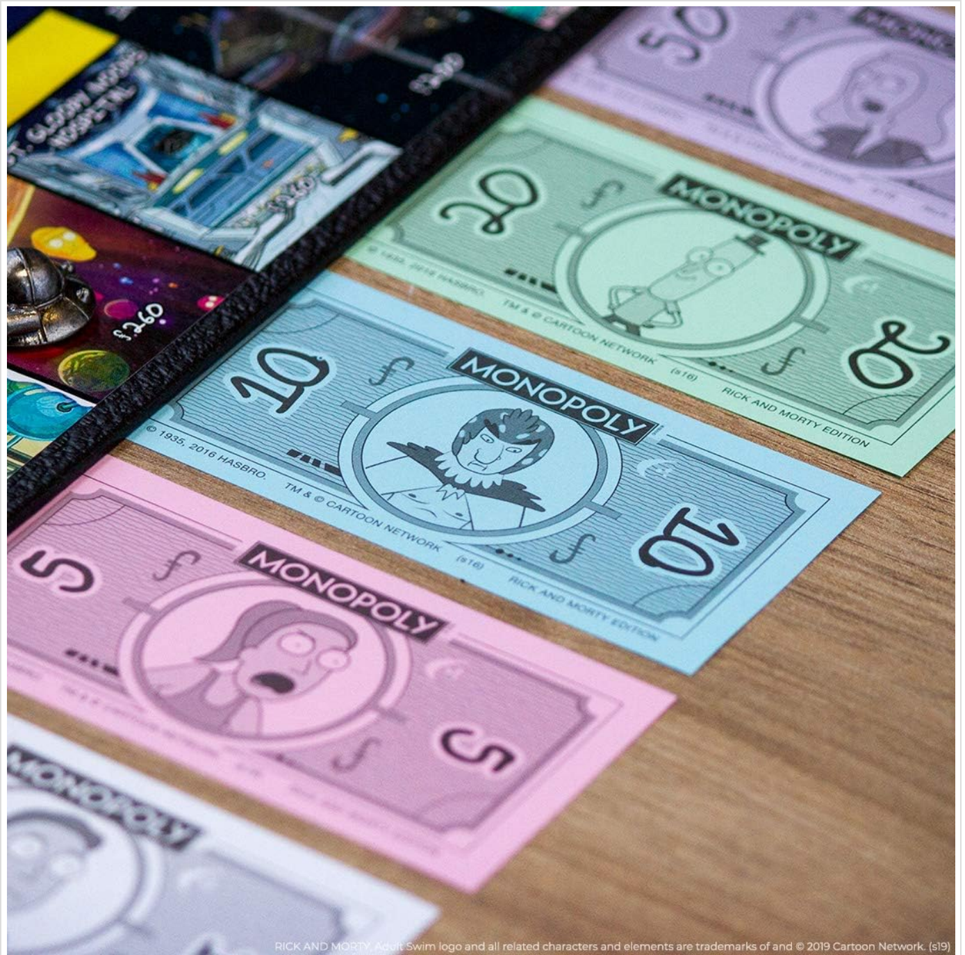
Image: A close-up of the custom Flurbo currency, featuring characters and designs from the Rick and Morty series.