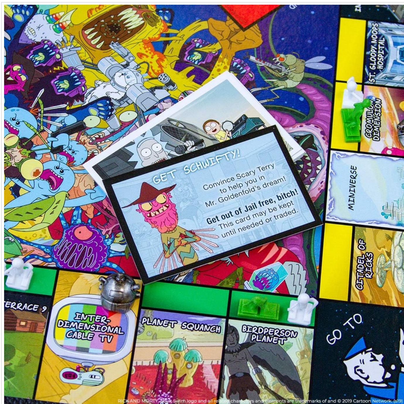
Image: A close-up of the "Get Schwifty!" card, which functions as a Chance card, along with other game cards on the board.