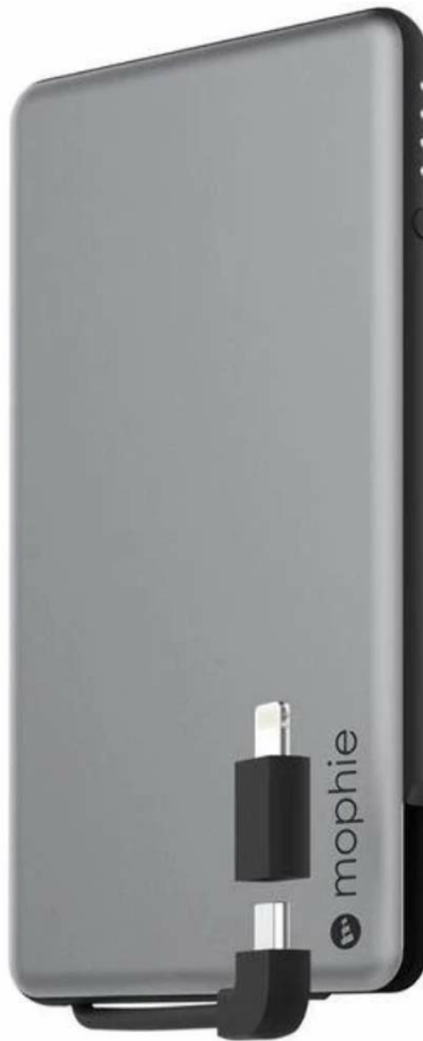
The Mophie powerstation Plus Mini in Space Gray, showcasing its sleek design.