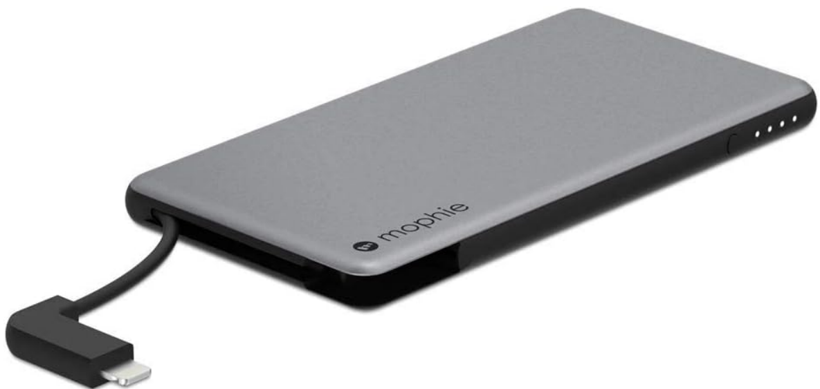
The powerstation features a convenient integrated charging cable for easy access.