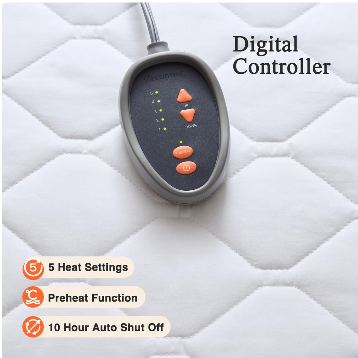
Image: Close-up of the digital controller with 5 heat settings and preheat function.

Your browser does not support the video tag.