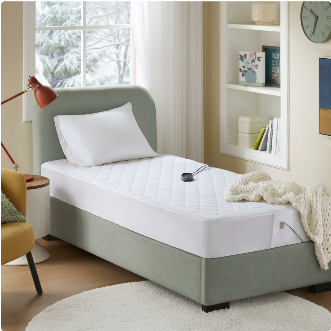
Image: Beautyrest Cotton Blend Heated Mattress Pad, showcasing its quilted surface on a bed.