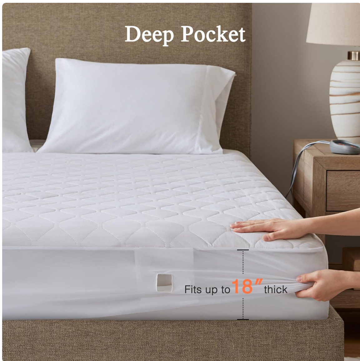
Image: Illustrates the connection point for the controller on the mattress pad.