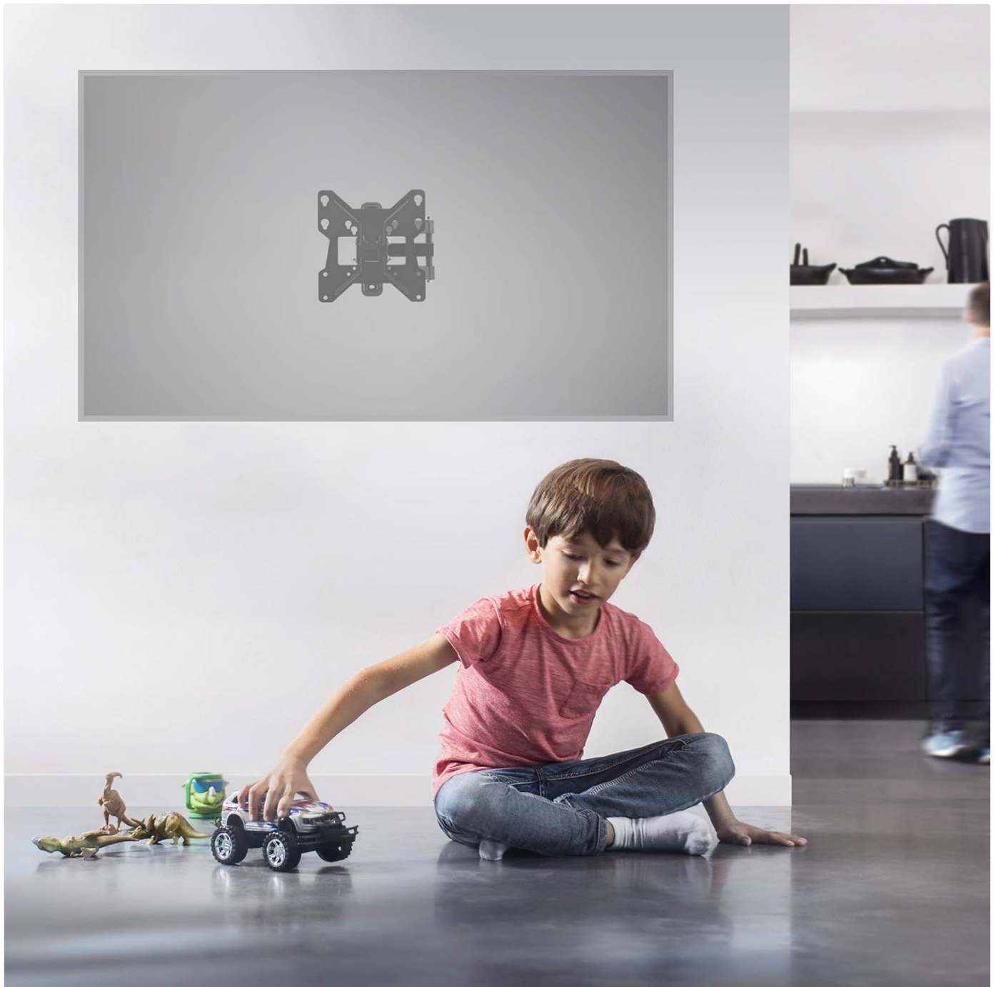
Image: An example of the TV bracket installed on a wall, demonstrating its discreet presence above a living space.

For additional assistance, you can download the One For All Toolbox app (available for iOS and Android), which includes tools like a spirit level and flashlight to aid installation.