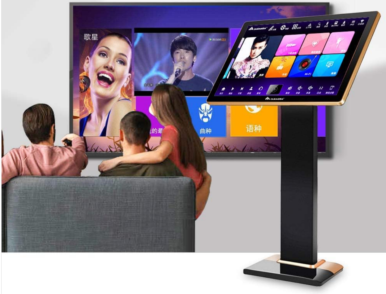
Image: The karaoke player displaying the KTV intelligent scoring system on a large screen, showing a singer and a score overlay.

Better grasp the singing effect, let you follow the rhythm to practice the song K song is over, enjoy your singing high score