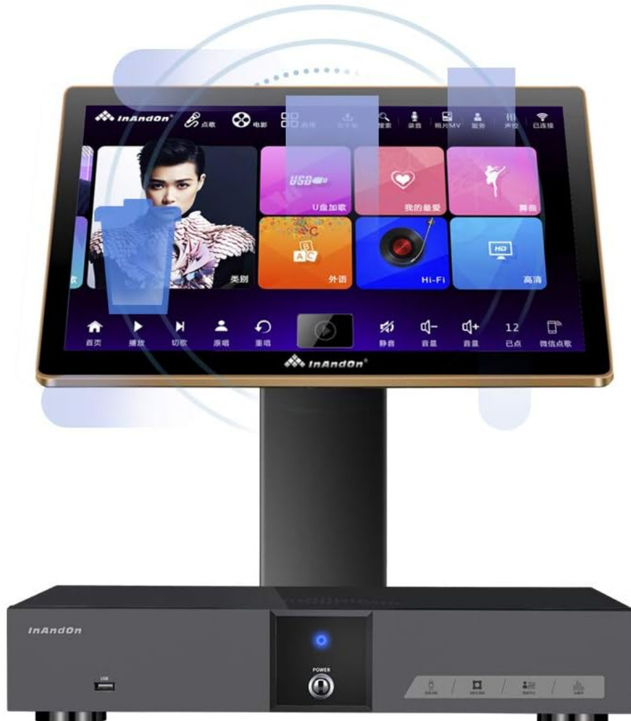
Image: The karaoke player screen displaying the intelligent song deletion feature, which helps maintain hard drive capacity by removing infrequently played songs.

Intelligently delete long-term unclicked songs according to the upper limit of hard disk storage