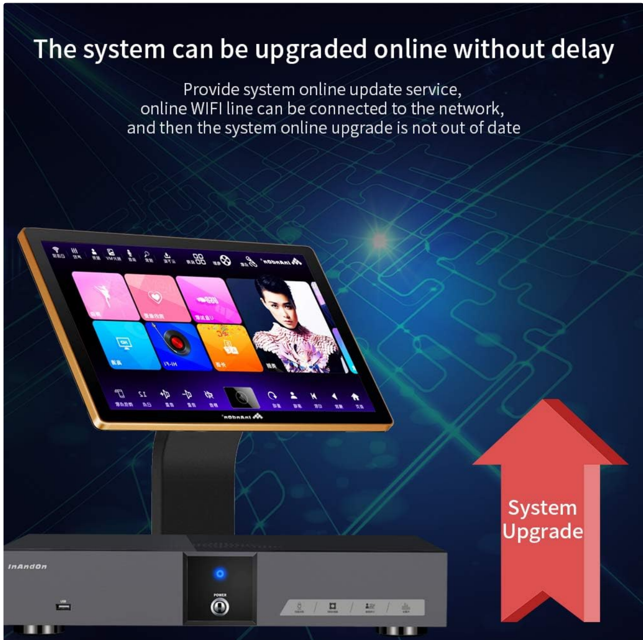
Image: The karaoke player screen indicating that the system can be upgraded online without delay, highlighting the online update service.