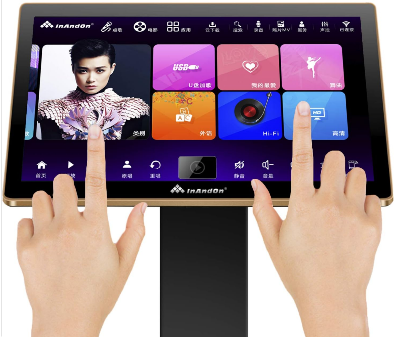
Image: The multi-finger touch interface of the karaoke player's screen, showing various application icons and controls.