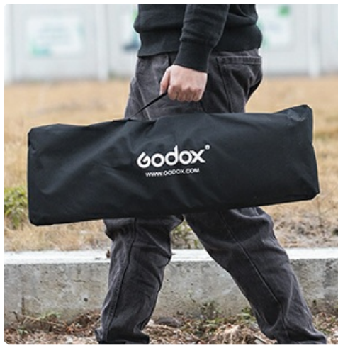
Image 5.1: The softbox and its components stored in the carry bag.