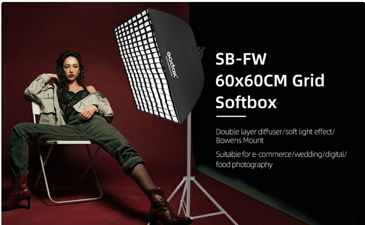
Image 1.1: The GODOX SB-FW6060 Softbox set up for a studio photoshoot.

The GODOX SB-FW6060 Studio Flash Honeycomb Grid Softbox is designed to provide soft, even, and controlled lighting for photography. This 60x60cm (24x24 inch) softbox features a Bowens mount for compatibility with various studio flashes and speedlites. It includes a honeycomb grid for directional light control and dual diffusers to further soften the light output. This manual provides instructions for assembly, operation, maintenance, and troubleshooting.