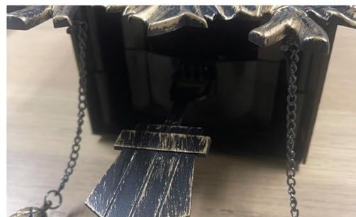
The pendulum can be inserted into the hanger for installation

The back panel of the cuckoo clock, illustrating the battery compartment, volume adjustment knob, reset button, and adjust button.