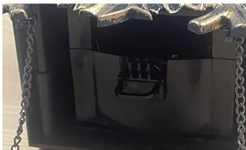
Pendulum suspended at the bottom