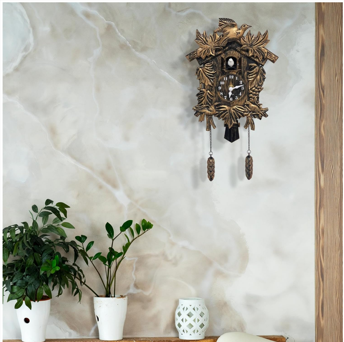
The WALPLUS Cuckoo Clock displayed on a wall in a home setting, illustrating its decorative appeal.