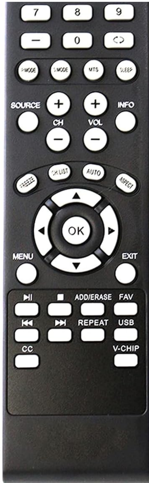
Image: The VINABTY Replacement Remote Control, showing its overall design and dimensions.