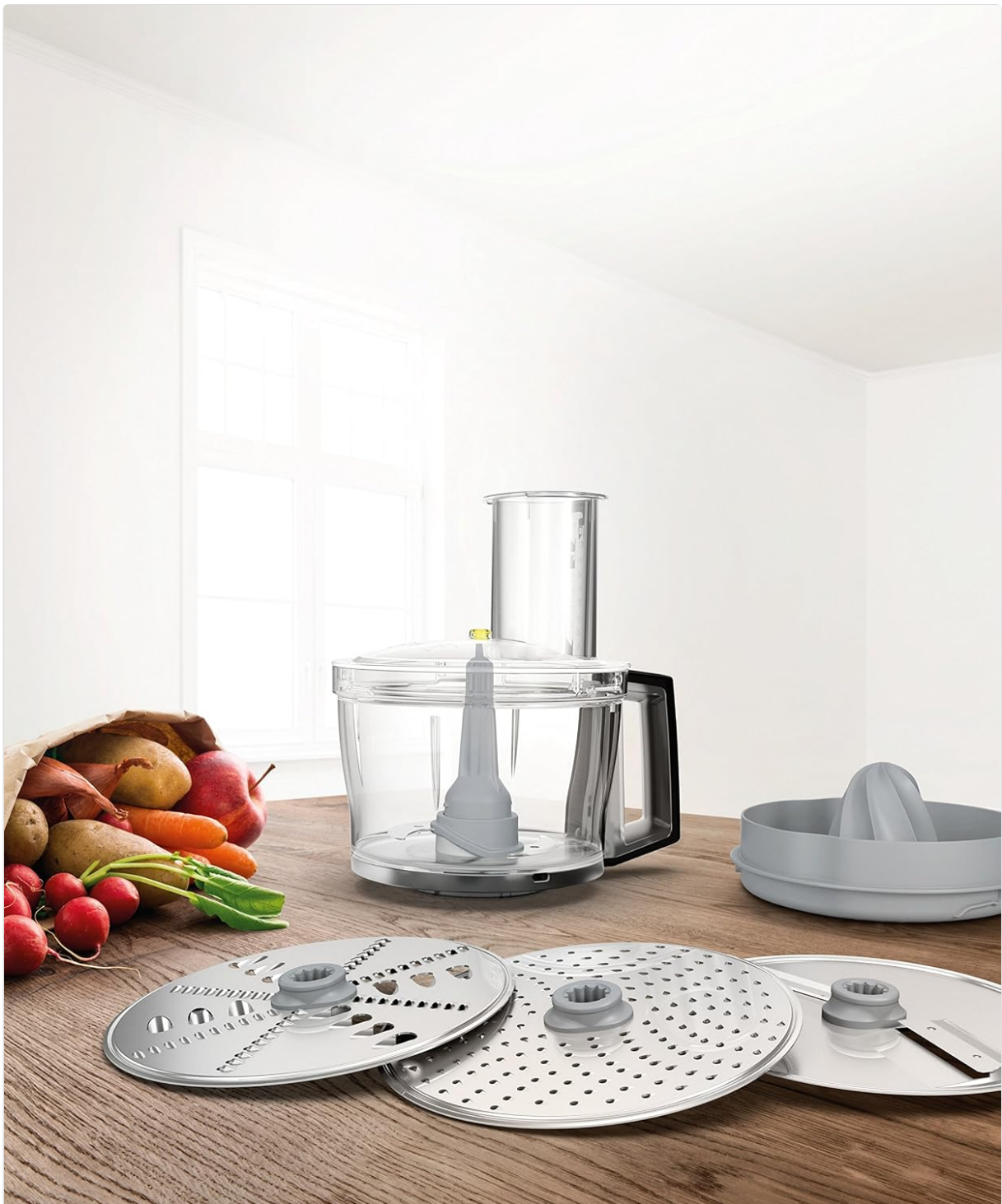
Figure 3: Detailed view of the different stainless steel discs and their resulting food preparations, including finely grated cheese, coarsely grated vegetables, and uniform slices.