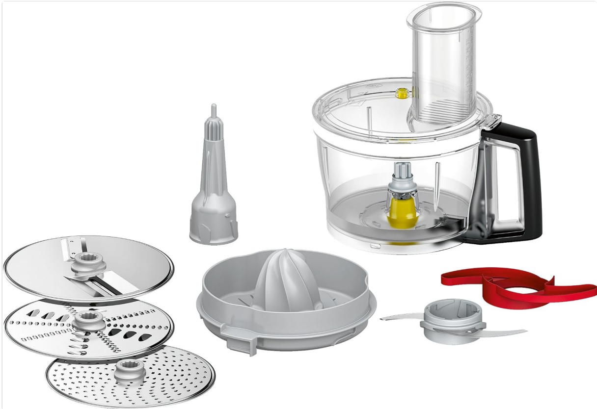
Figure 1: Overview of all included components in the Bosch Lifestyle Set Veggie Love Plus. This image displays the universal chopper bowl, lid, pusher, various stainless steel discs, the multi-function chopping blade, and the citrus press attachment.