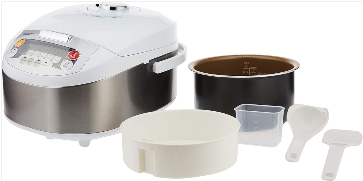
Figure 2: Philips HD3031/03 Rice Cooker shown with its included accessories: the inner pot, measuring cup, plastic steam tray, rice scoop, and soup scoop.