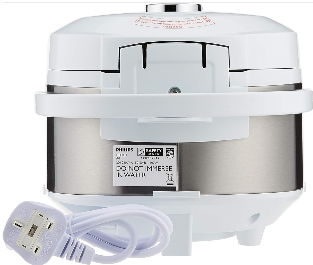
Figure 3: Rear view of the Philips HD3031/03 Rice Cooker, showing the product label with model number, voltage, and wattage information, along with the power cord.