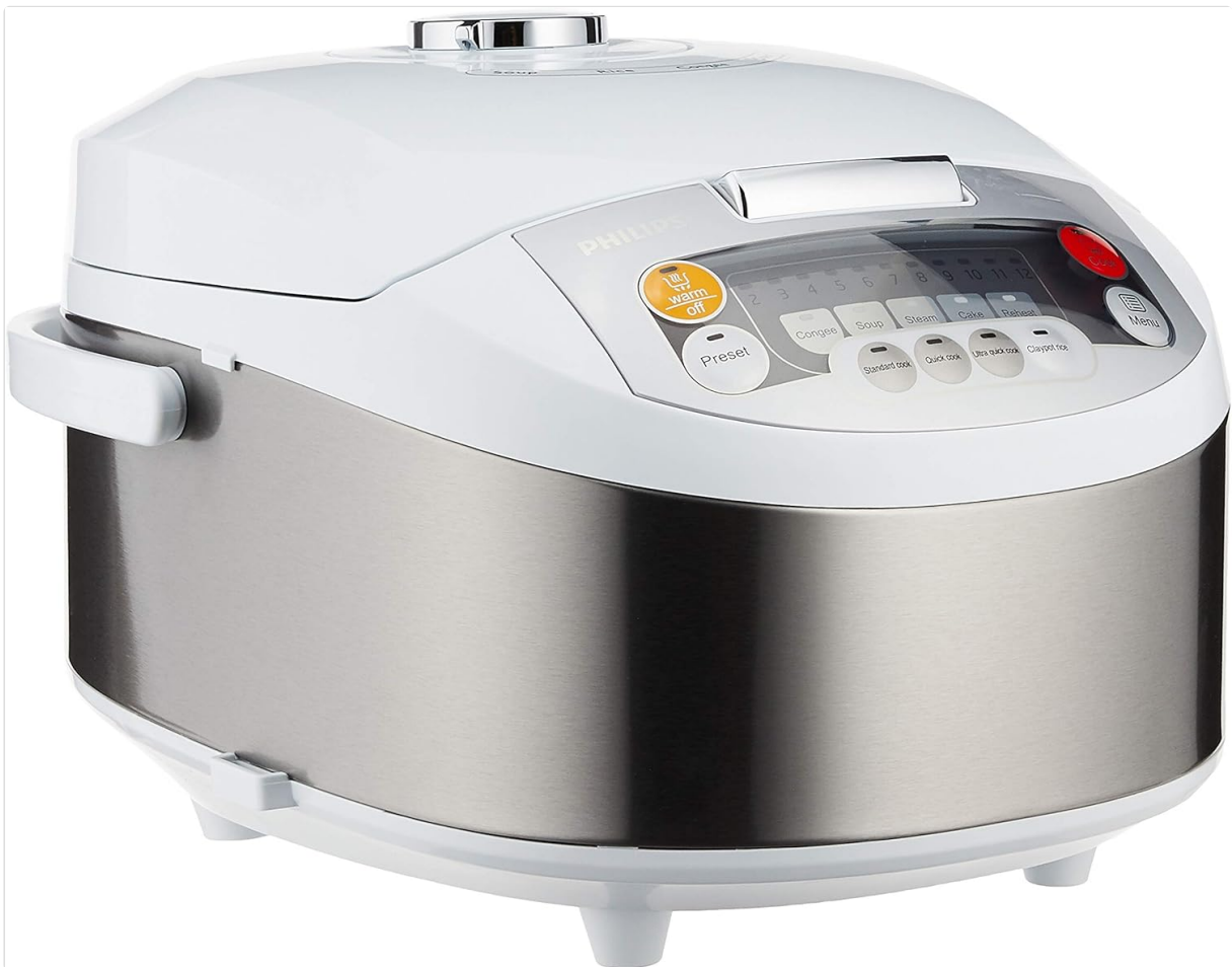
Figure 1: Philips HD3031/03 Viva Collection Fuzzy Logic Rice Cooker, front view. The cooker features a white and stainless steel exterior with a control panel on the front.