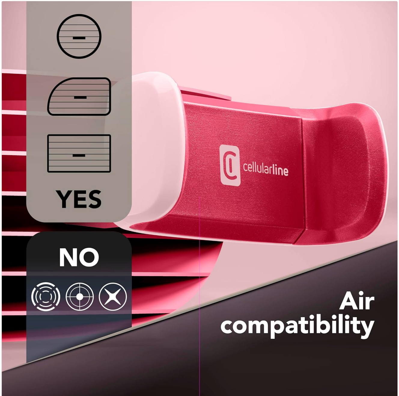
Figure 1: Air Vent Compatibility. This image illustrates which types of air vents are compatible (straight horizontal or vertical) and which are not (circular or complex designs).