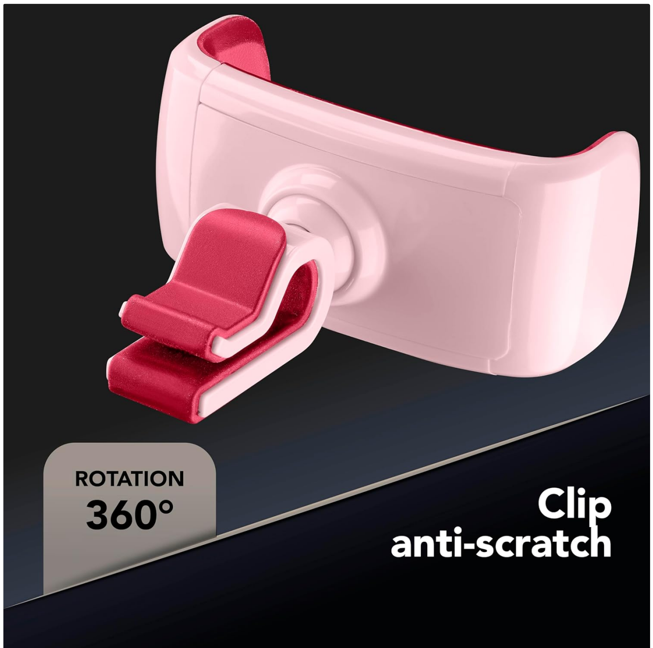
Figure 3: Anti-Scratch Clip. The clip is designed to securely attach to air vents while minimizing the risk of scratches.