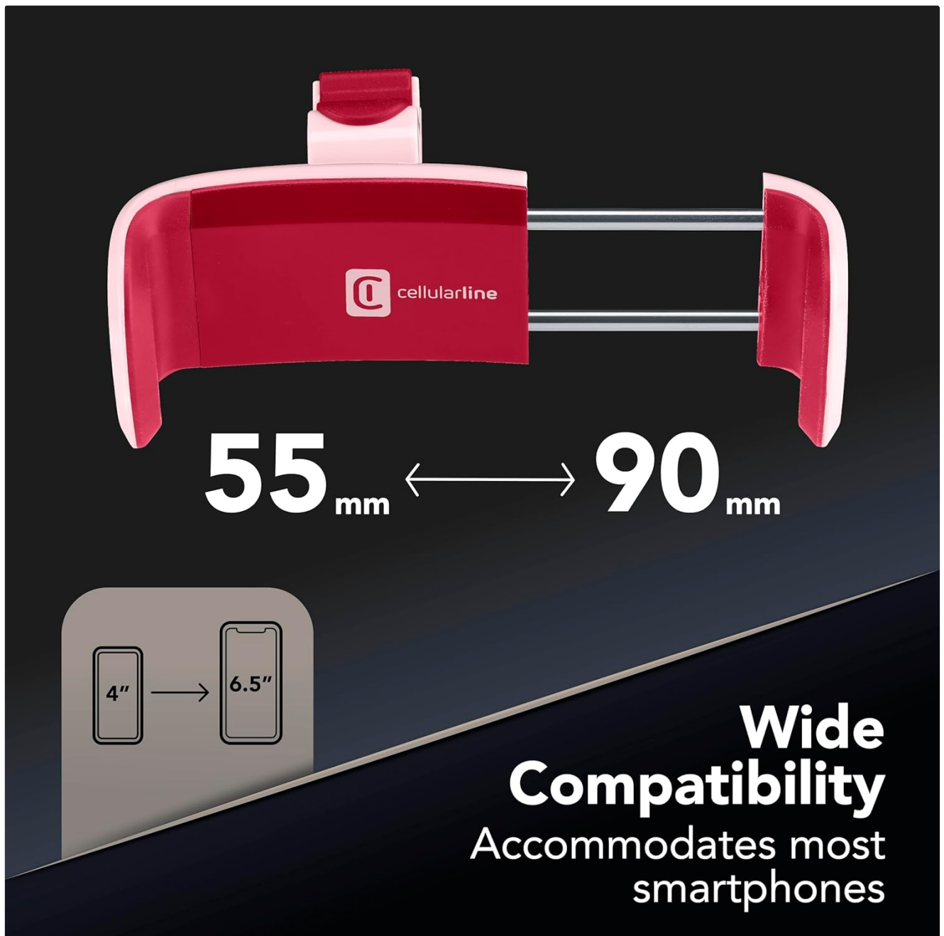
Figure 4: Wide Compatibility. The holder's adjustable arms can accommodate smartphones with widths between 55mm and 90mm, typically fitting devices from 4 to 6.5 inches.