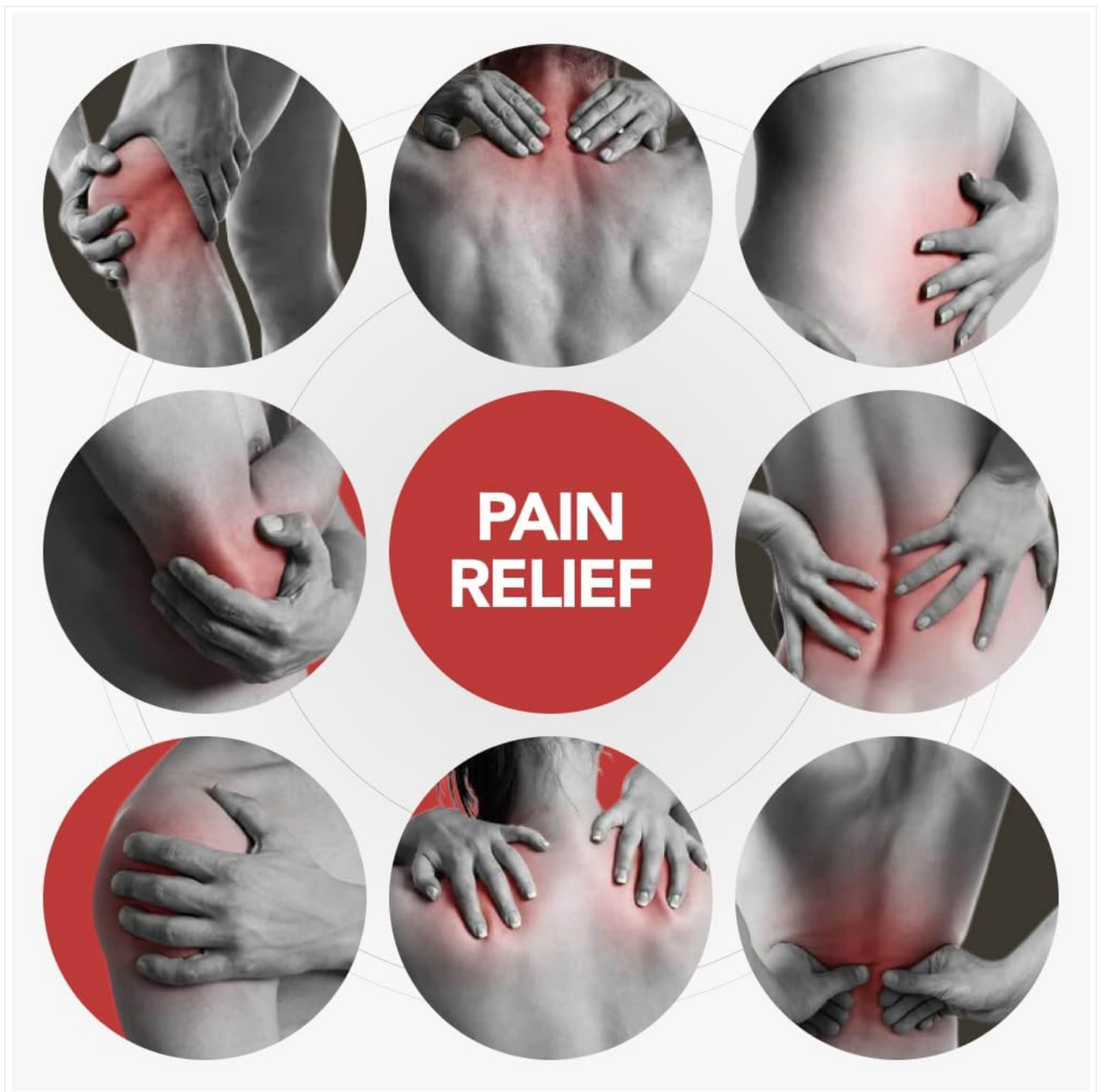
Image description: A circular diagram illustrating common areas for pain relief on the human body, including the knee, upper back, lower back, elbow, abdomen, shoulder, and neck, indicating where TENS unit pads can be applied.

Refer to the included quick reference guide or consult a healthcare professional for specific pad placement recommendations for your condition.