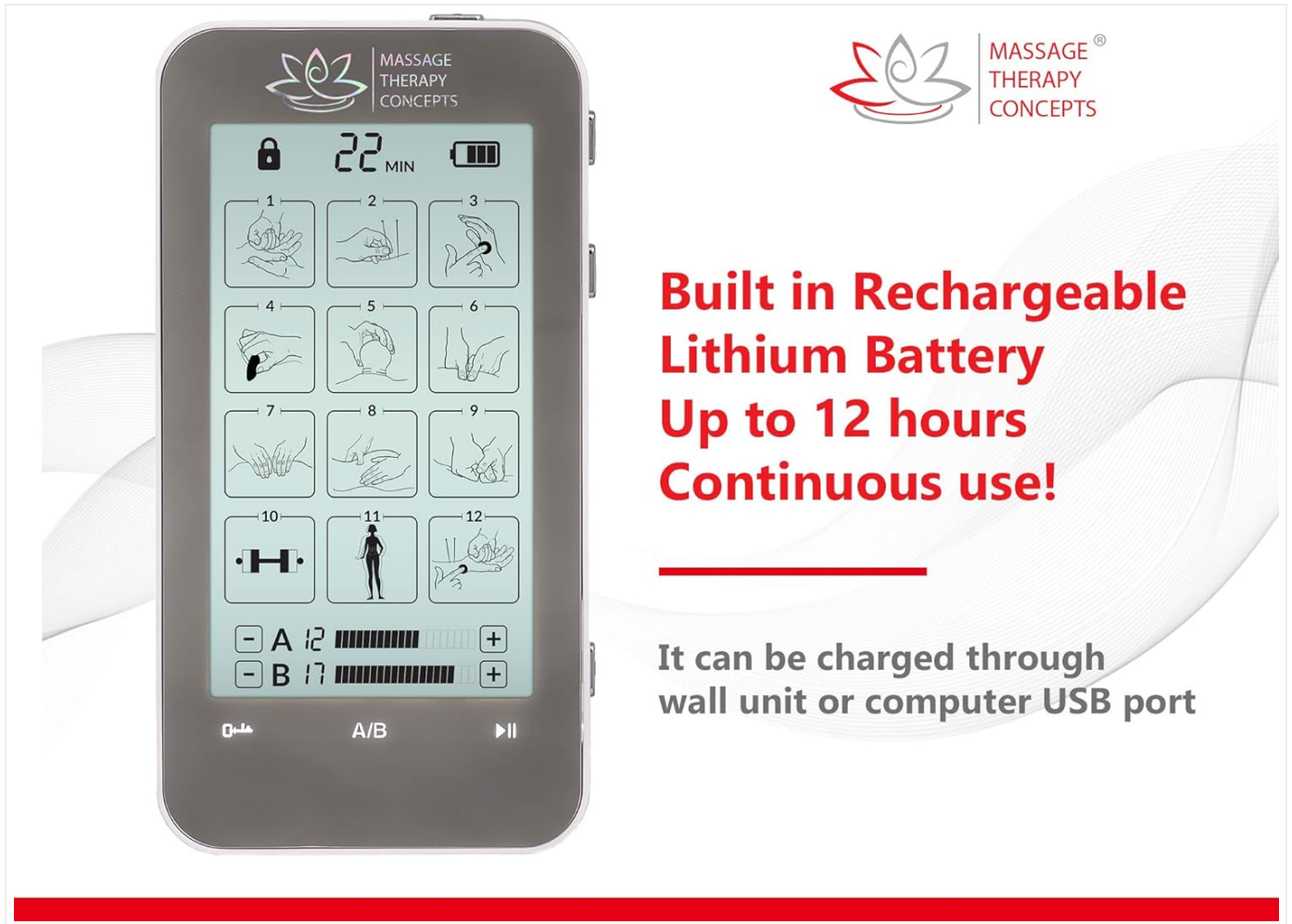
Image description: The TENS unit device is shown with text indicating it has a built-in rechargeable Lithium Battery, offering up to 12 hours of continuous use, and can be charged via a wall unit or computer USB port.