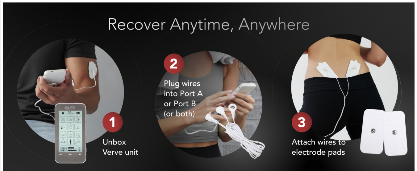
Image description: A composite image showing three steps: 1) Unboxing the Verve unit, 2) Plugging lead wires into Port A or B, and 3) Attaching wires to electrode pads.