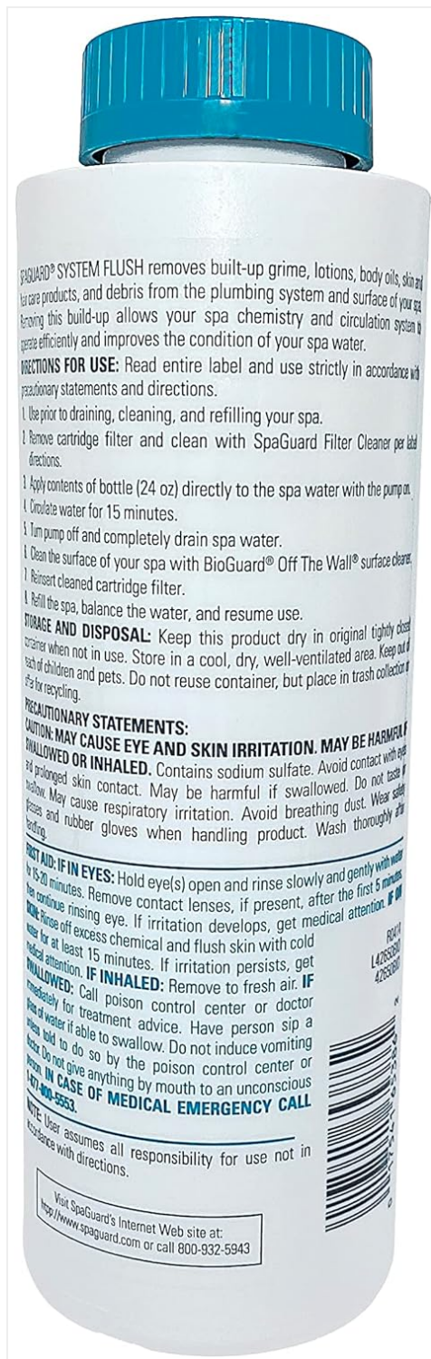
Image 2: Back view of the SpaGuard System Flush bottle, displaying detailed directions for use and safety precautions.