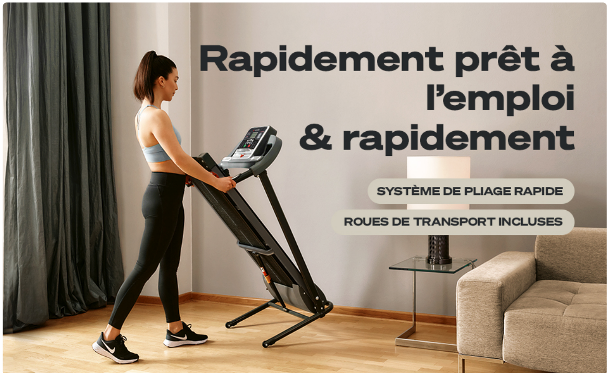
Image: The Sportstech F10 treadmill features a quick-folding system and transport wheels for convenient storage.