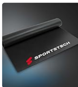
Image: Consider using a floor protection mat to safeguard your flooring and reduce noise.