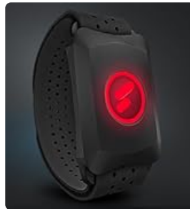
Image: The treadmill is compatible with heart rate monitoring devices for tracking your pulse during workouts.

Image: The treadmill supports app connectivity with platforms like Kinomap and iFitShow for interactive training.