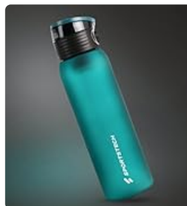
Image: Utilize the integrated bottle holders to stay hydrated during your exercise.

Image: The treadmill is compatible with heart rate monitoring devices for tracking your pulse during workouts.