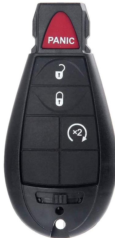
Image: SCITOO Key Fob with a list of compatible vehicle models and corresponding OE part numbers for verification.