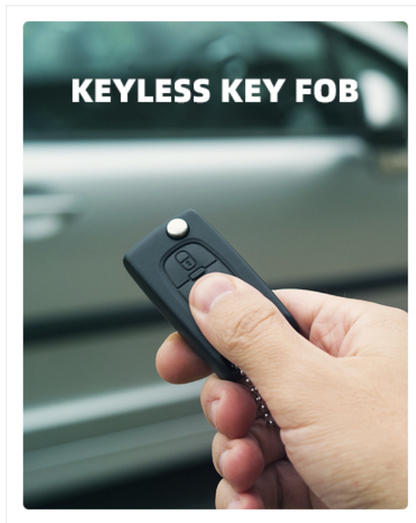
Image: A SCITOO Key Fob with a blank key blade. The blank key needs to be cut by a professional locksmith to match your vehicle's ignition.