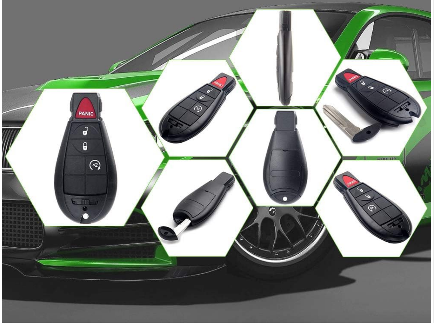
Image: Multiple detailed views of the SCITOO Key Fob from different angles, including the key blade.