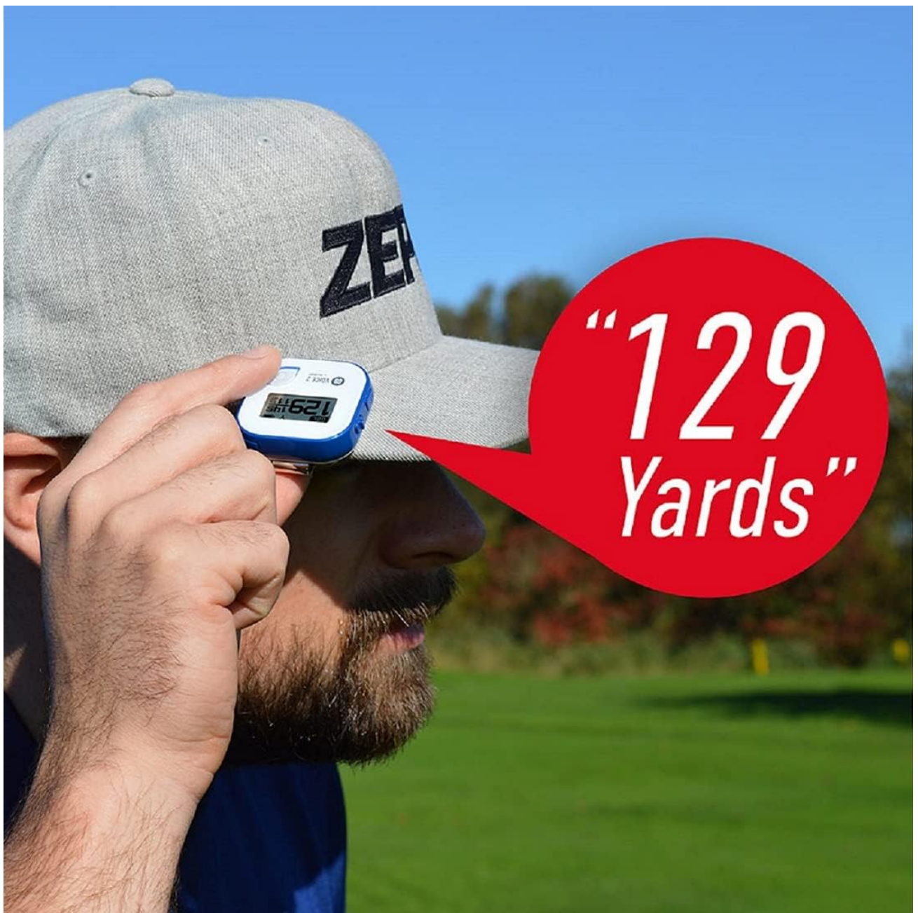
Figure 5: Golfer using the device for audio distance guidance.

The device provides convenient voice guidance for distances. You can adjust the audio guide volume from 0 to 5 using the side buttons to suit your preference.