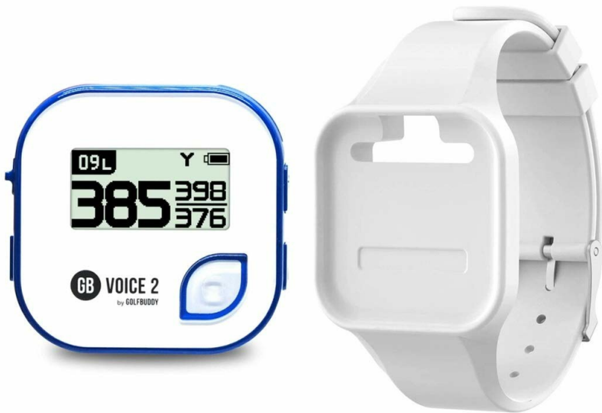
Figure 1: Front view of the GOLFBUDDY Voice 2S+ displaying distances.