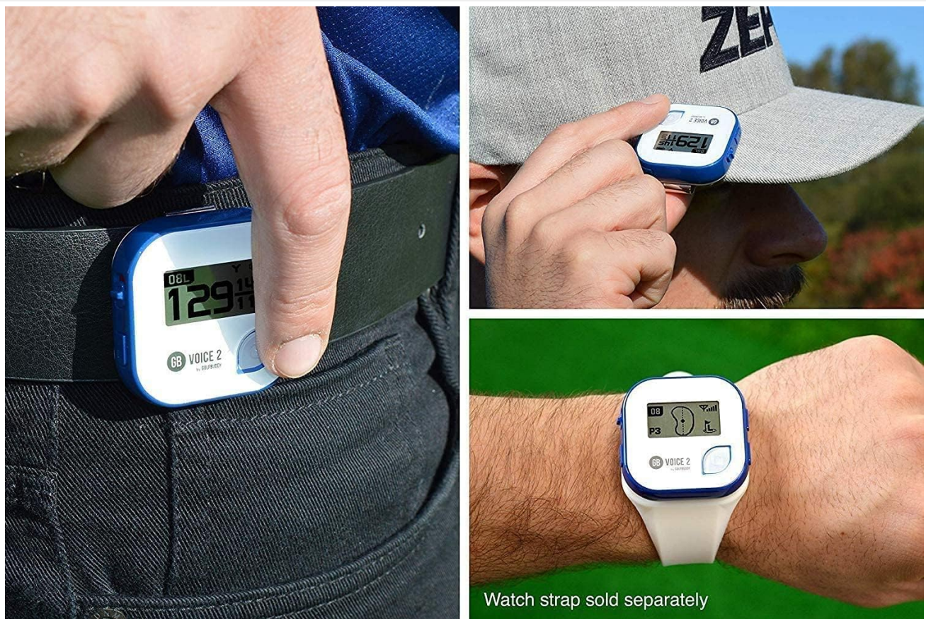
Figure 6: Various ways to wear and use the GOLFBUDDY Voice 2S+.