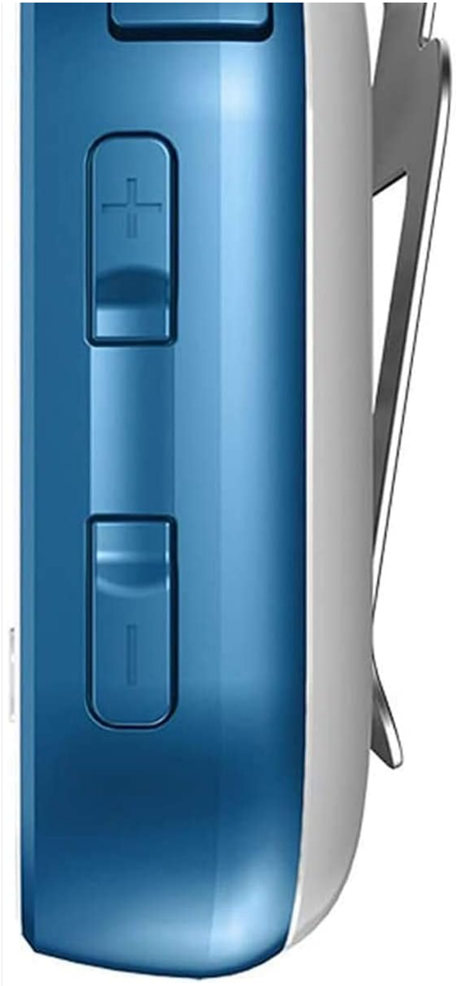
Figure 2: Side view illustrating the USB charging port and control buttons.