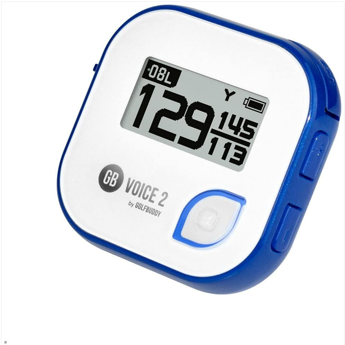
Figure 4: Device displaying current distances to the green.

Press the main button once to hear the distance to the center of the green. The screen simultaneously displays distances to the front, center, and back of the green. Repeated presses may cycle through additional information or repeat the distance.