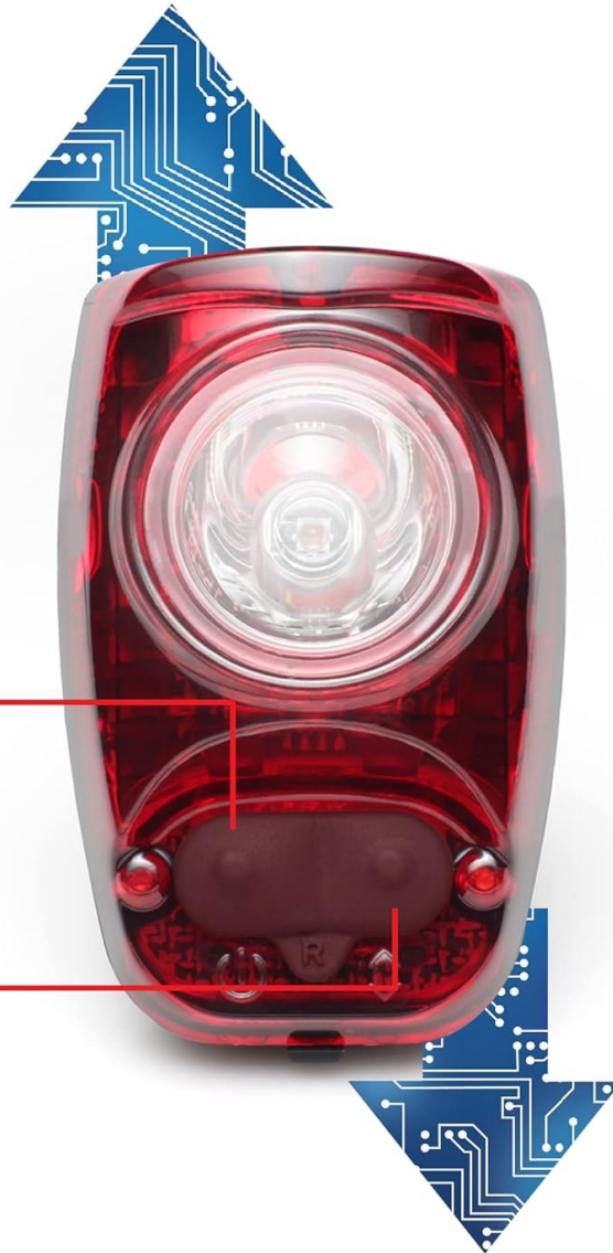
Image: A close-up view of the Cygolite Hotshot SL-50, highlighting the left power/mode button and the right adjustment button.