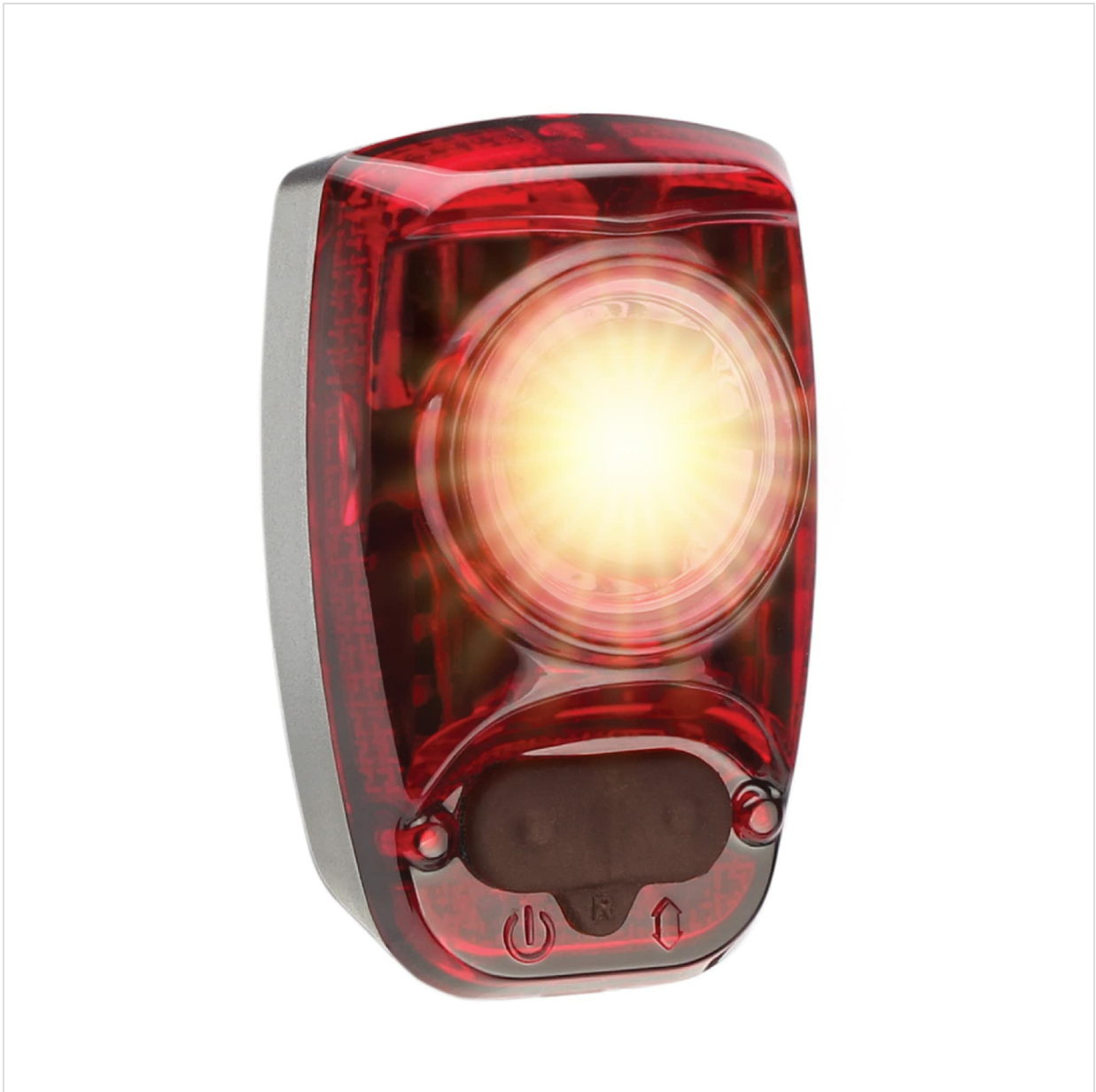
Image: The Cygolite Hotshot SL-50 tail light brightly illuminated on a bicycle seat post, demonstrating its visibility.