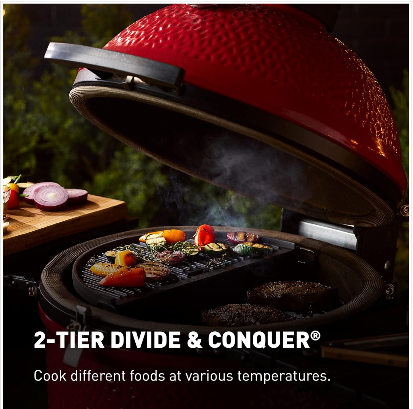
Figure 2: The 2-Tier Divide & Conquer system, showing different cooking levels and heat zones.