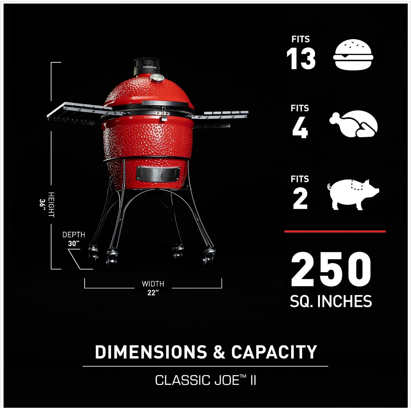
Figure 7: Visual representation of the Kamado Joe Classic Joe II dimensions and cooking capacity.