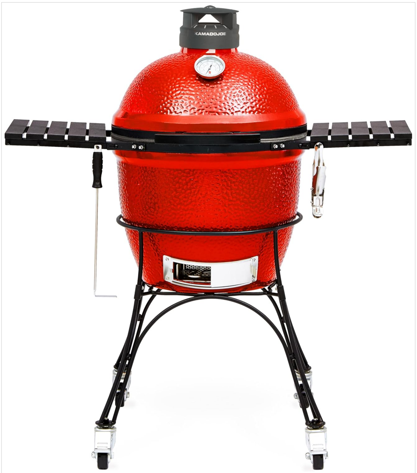
Figure 1: Kamado Joe Classic Joe Series II 18-inch Ceramic Charcoal Grill and Smoker with Cart and Side Shelves.