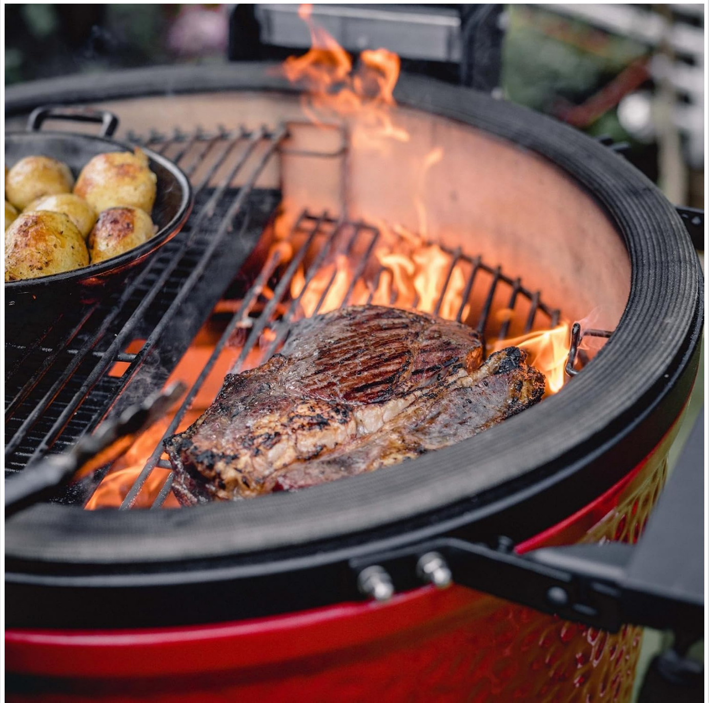
Figure 5: Food being cooked on the Kamado Joe grill, demonstrating its cooking capabilities.

Temperature control is achieved by adjusting the top (Kontrol Tower) and bottom vents. Small adjustments can lead to significant temperature changes due to the grill's excellent insulation. For lower temperatures (smoking), restrict airflow by closing the vents. For higher temperatures (searing), open the vents to increase airflow. Always allow the grill to stabilize at your desired temperature before placing food on the grates.